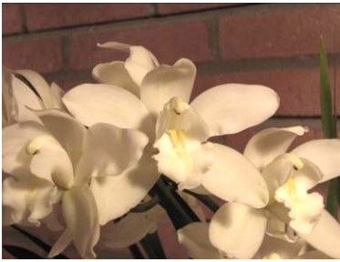
Cym. Sussex Dawn x Via Atlantica Espie Quinn