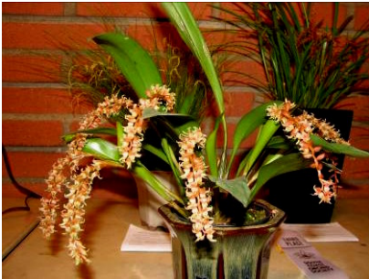
Dendrochilum cootesii (species) Butch & Miranda Arciaga