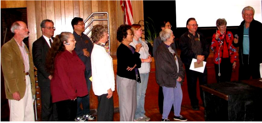
2007 Board of Directors and Officer Installation