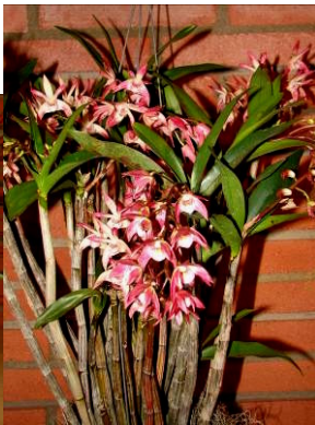
Den. Ranger x Falsifal Espie Quinn