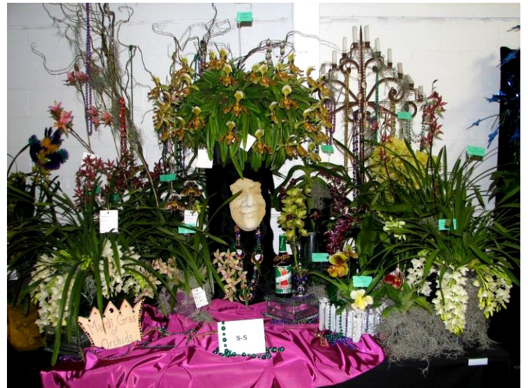
SCOS Display at Fascination of Orchids Show displaying the BEST Mardi Gras Theme

Congratulations Janell for your Paph. Nitens (insigne x villosum) (See the "head dress" above the mask.) for winning both Best Specimen Orchid Plant, Any Genus Highest Point Scored Slipper Orchid - CCE/AOS 95