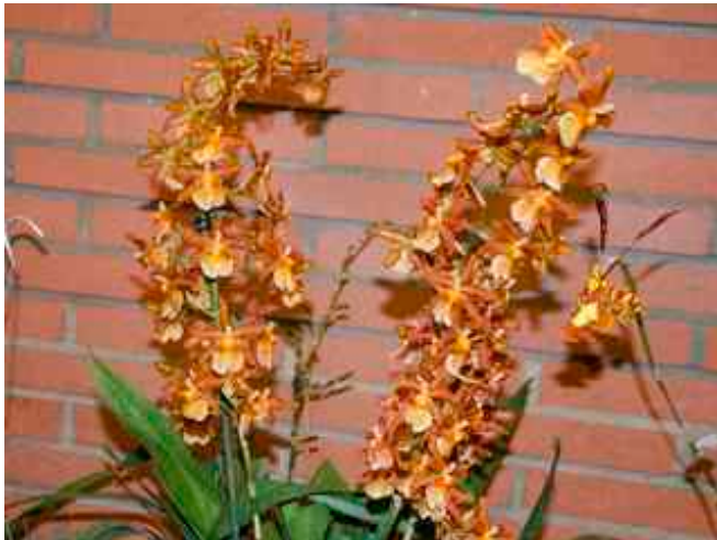
Oncidium Golden Sunset