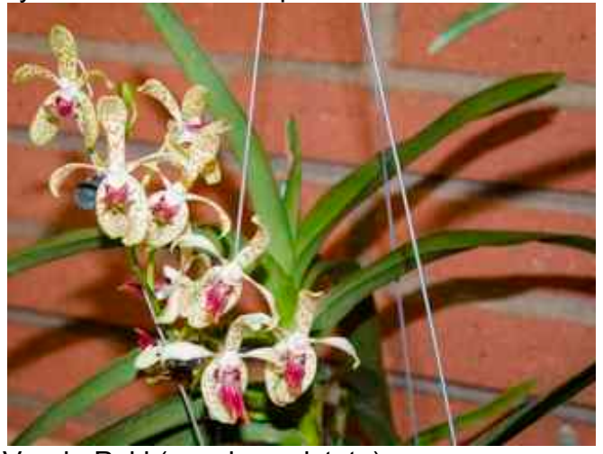
Vanda Paki ( suavis x cristata )