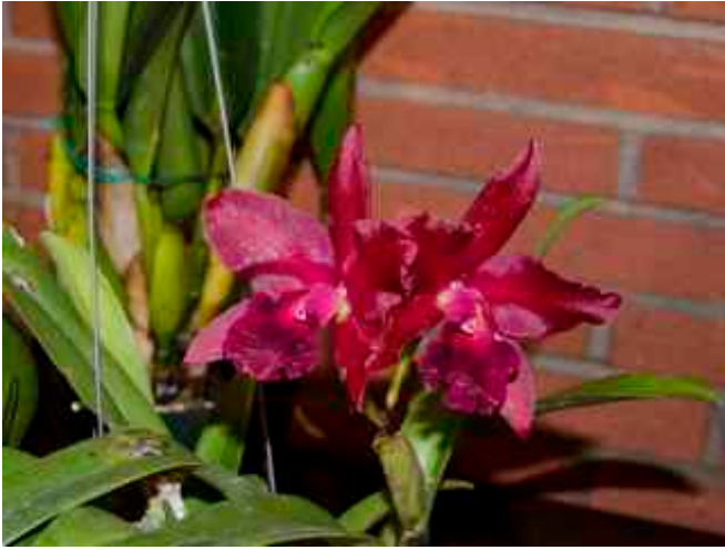
Blc. Cherry Susane