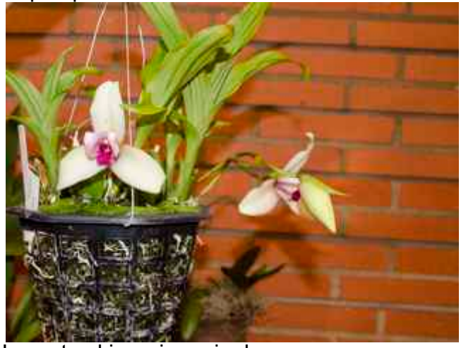
Lycaste skinneri var. ipala