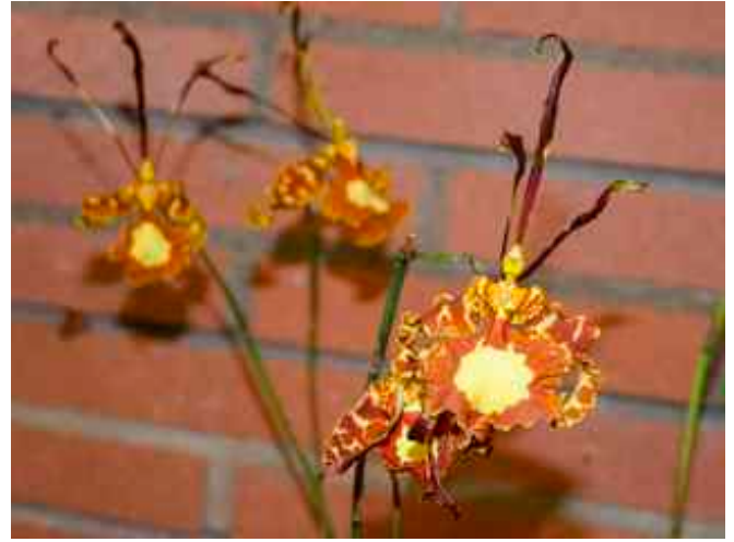
Psychopsis Memoria Bill Carter