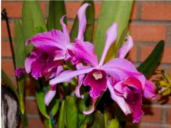
Laelia (Cattleya) purpurata