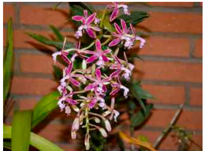
Epidendrum (Pfani x Raisenforum)