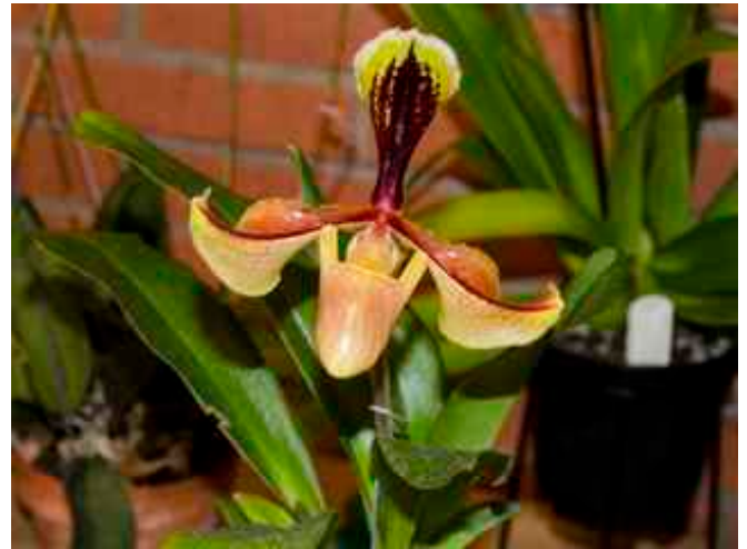
Paphiopedalum villosum 'CDM'