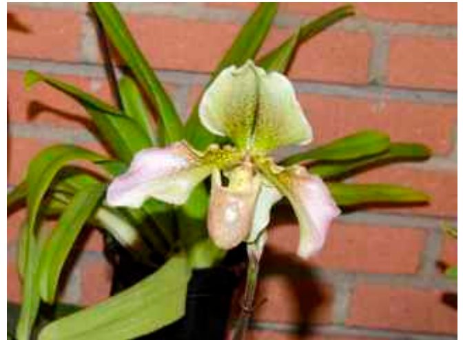
Paphiopedalum Topsy Turvey 'Twister'