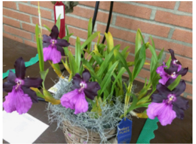
Miltonia spectabilis var. Mooreliana