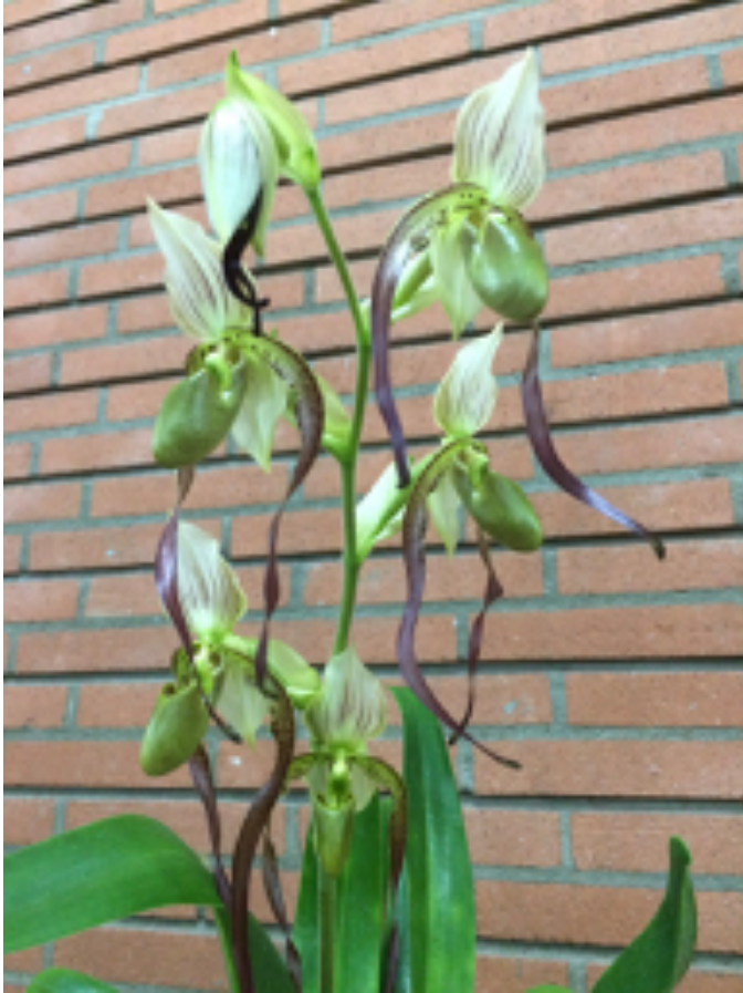
Paph. Umatilla 'All-A-Row' Am/AOS

Thanks to our members for the beautiful flowers.