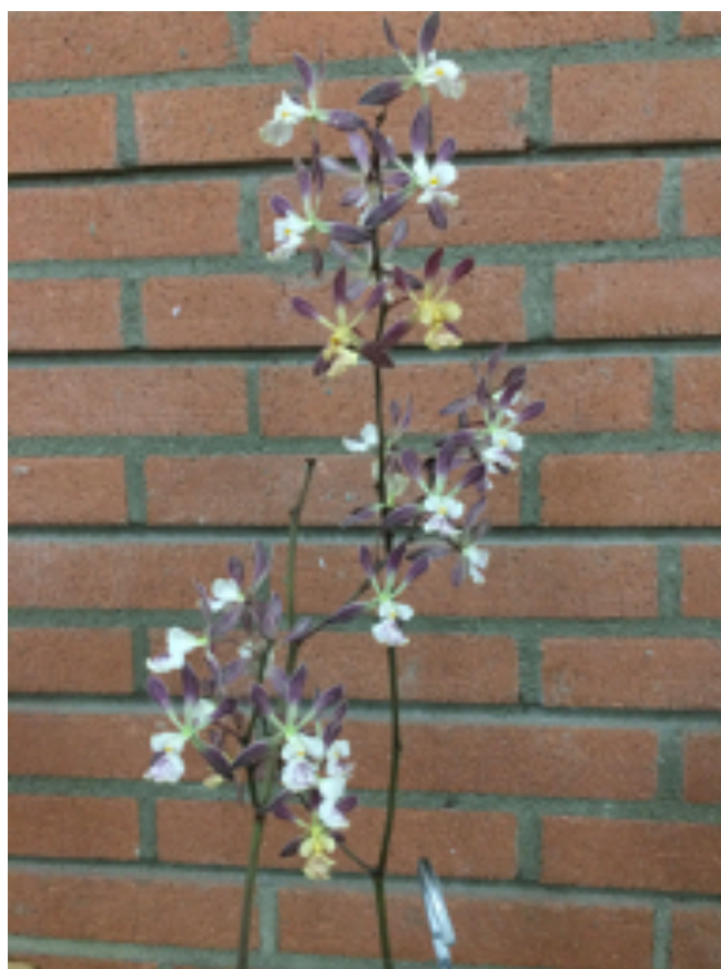
Enc. alatum 'SVO' x Enc. Cashen's Brown Sugar 'A-go-go'