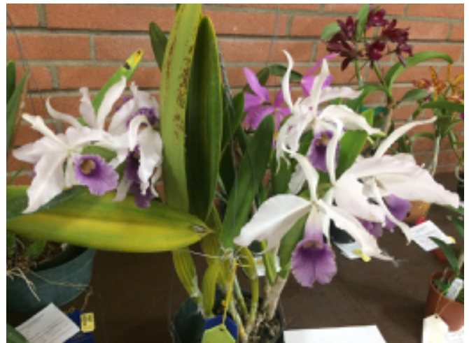
Lc. C. G. Roebling var. coerulea