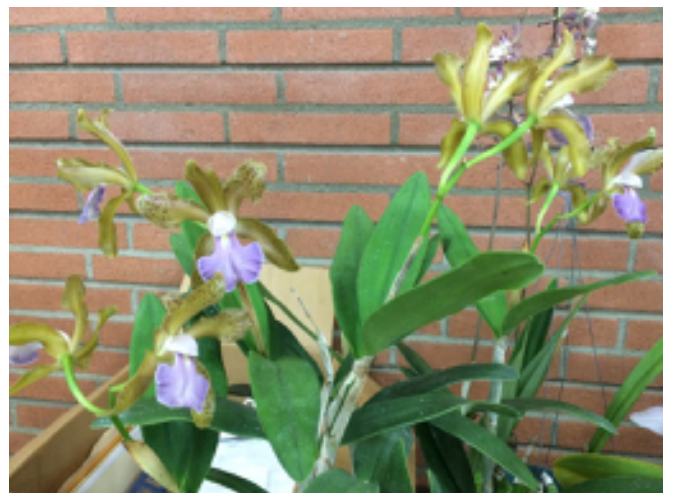
Cattleya Leoloddiglossa x C. bicolor