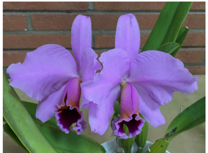
Cattleya percivaliana 'Merrill' AM/AOS