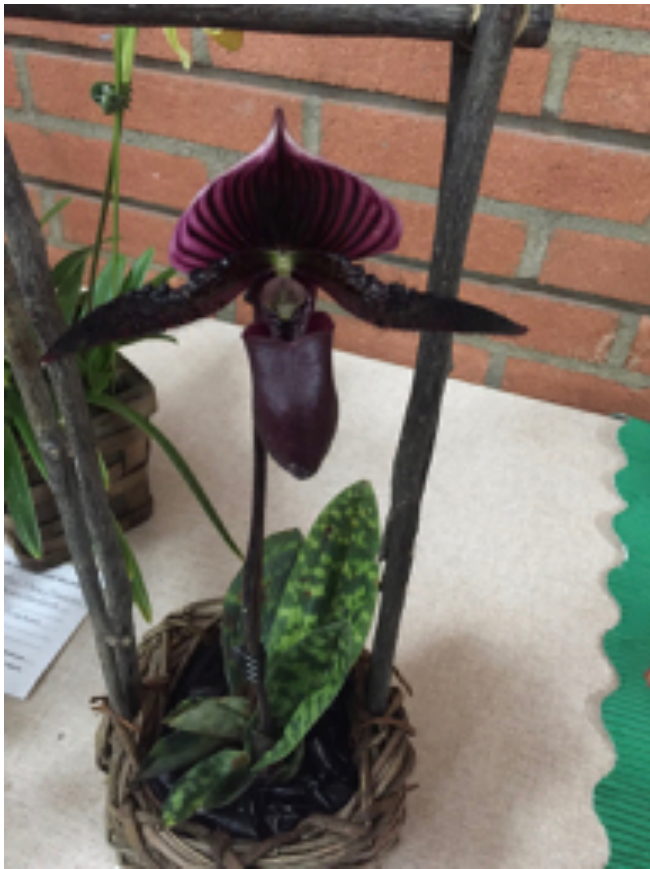
Paph. (Supersiuk x Raisin Pie)