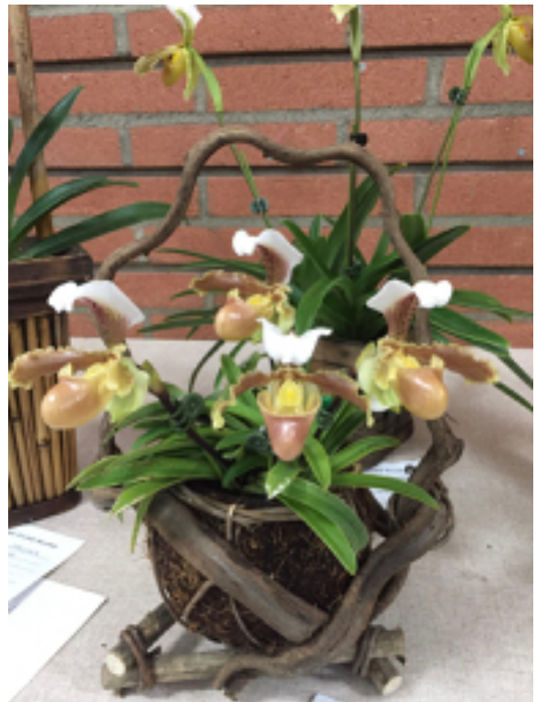
Paphiopedilum barbigerum CCM/AOS