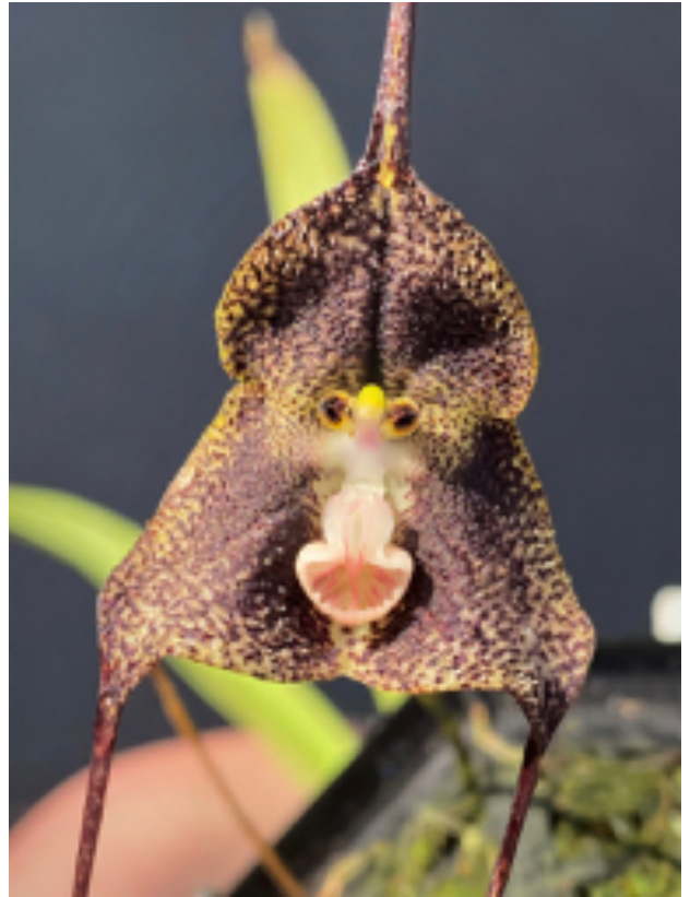
Dracula simia is always fun, with monkey-face flowers.