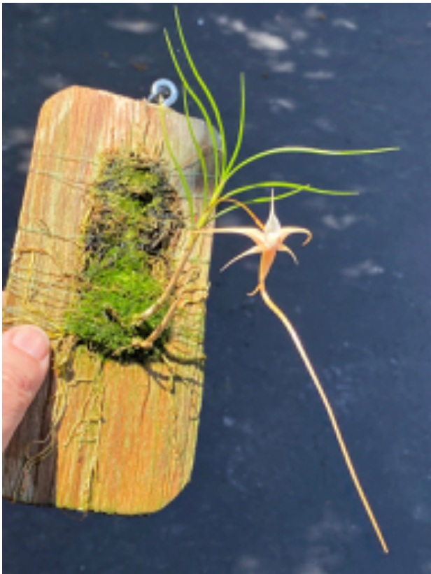
Angraecum teretifolium has pine-needle-like leaves and a great flower-to-plant size ratio!