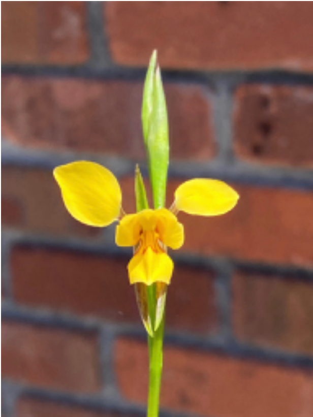
Diuris drummondii is the last of my Australian terrestrial donkey orchids to flower, with bright yellow flowers on tall spikes. It is summer dry/dormant