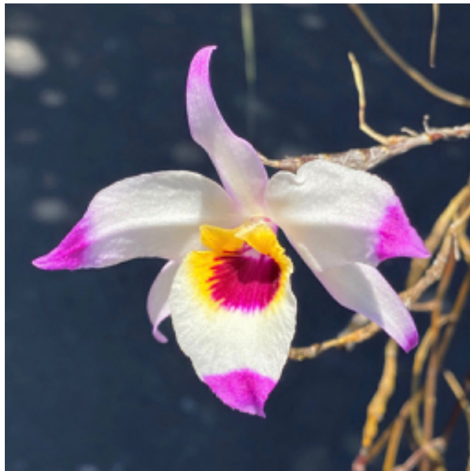
Dendrobium falconeri is a very pretty species from the Himalayas. I leave it outside in the rain over the winter and it seems to enjoy that