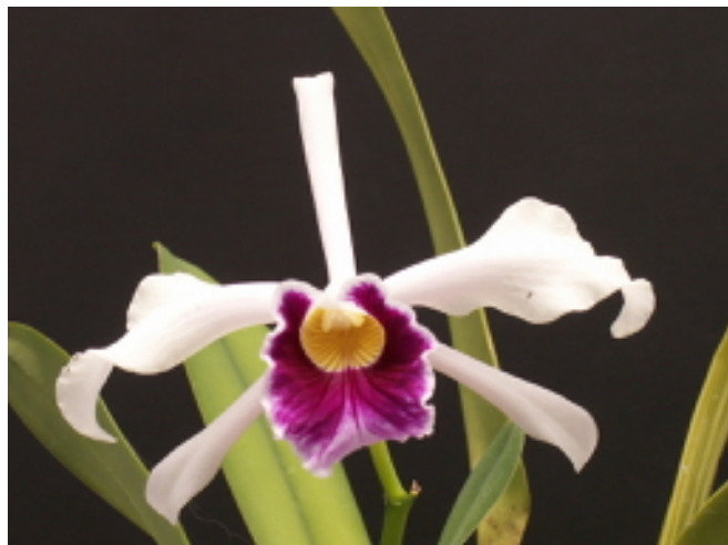
Laelia purpurata marginata from Encore Show Stopping Orchids December 1992