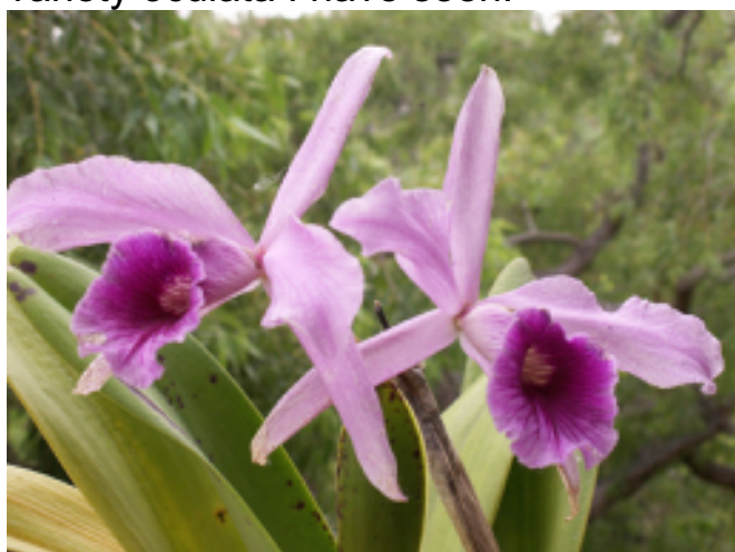
Laelia purpurata rubra