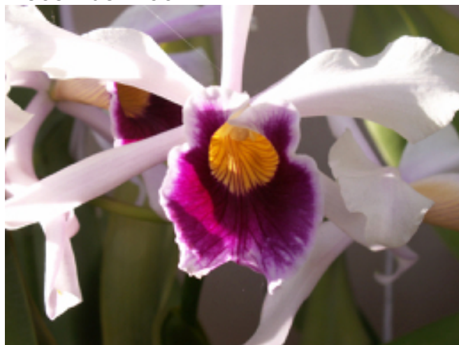
Laelia purpurata marginata (lip detail)