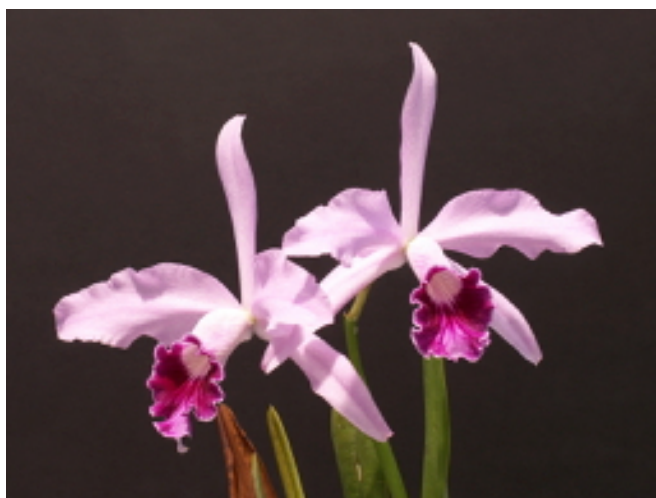
Laelia purpurata vinicolor from Orchidanica March 1992