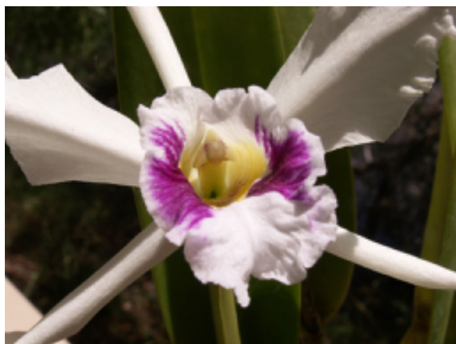
Laelia purpurata oculata