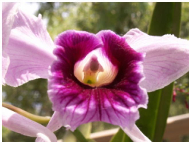
Laelia purpurata venosa from SBOE