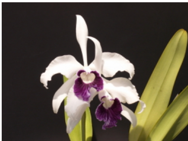
Laelia purpurata 'Schusteriana' (aco?) from Carmela as a tiny seedling 2014