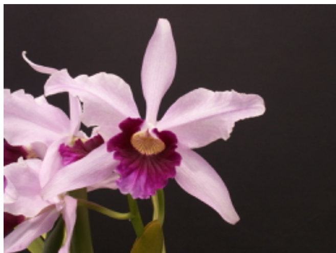
Laelia purpurata roxo-bispo from Floralia