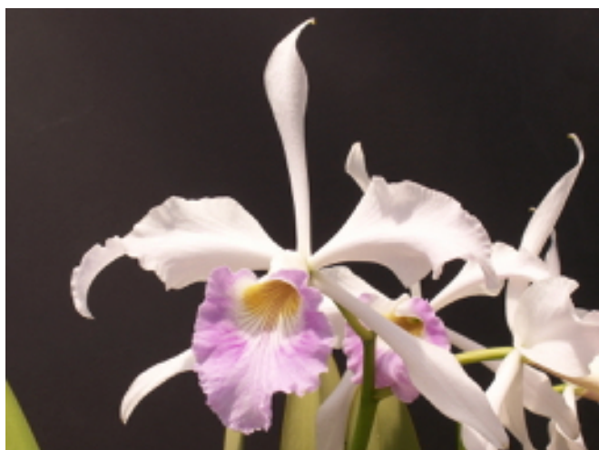
Laelia purpurata russeliana