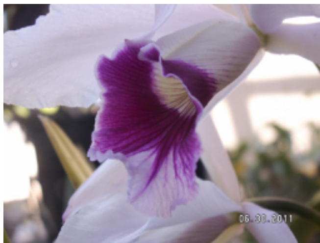
Laelia purpurata vinicolor 'Cabernet Franc' from Sea God Nursery (Raymond Burr Collection)

See our website for flyers: www.southcoastorchidsociety.com .