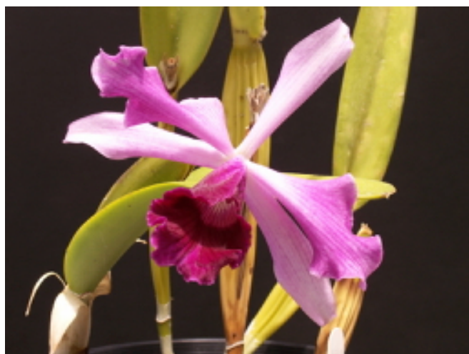
Laelia purpurata sanguinea