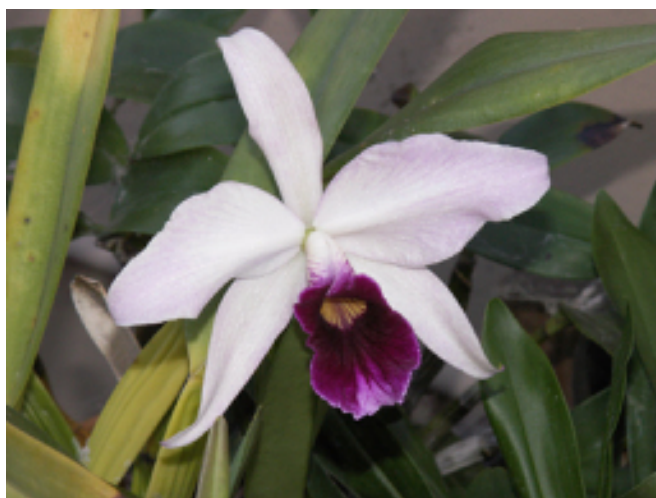
Laelia purpurata tipo from Floralia