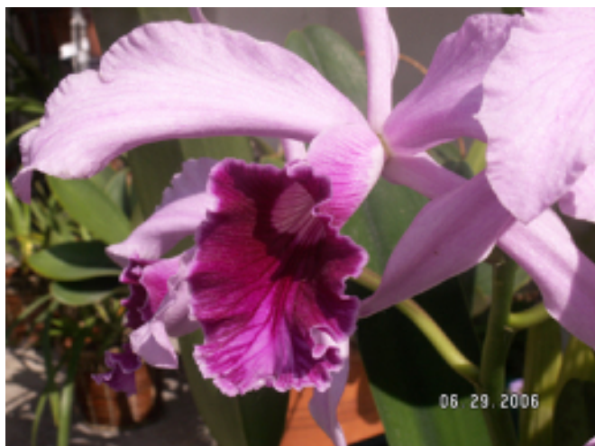
Laelia purpurata vinicolor (lip detail)