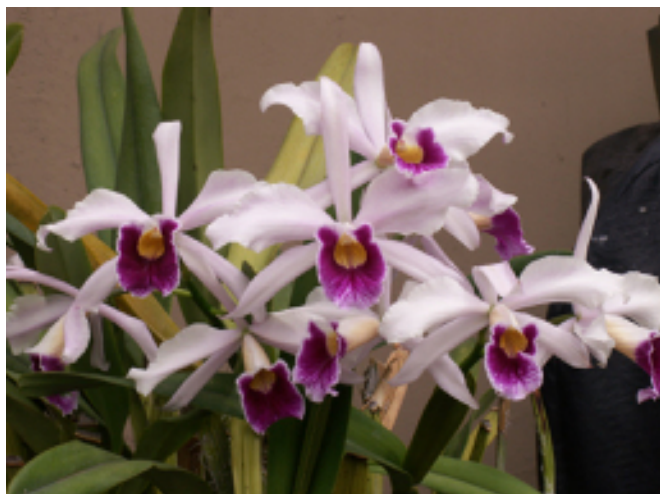
L. p. marginata (in a good year)