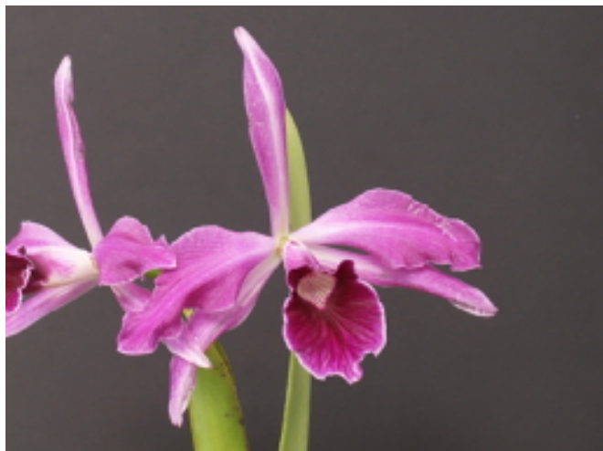
Laelia purpurata sanguinea