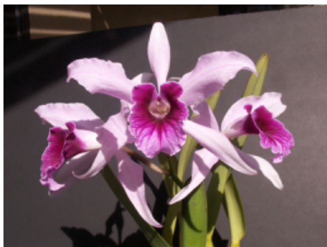
Laelia purpurata rubra