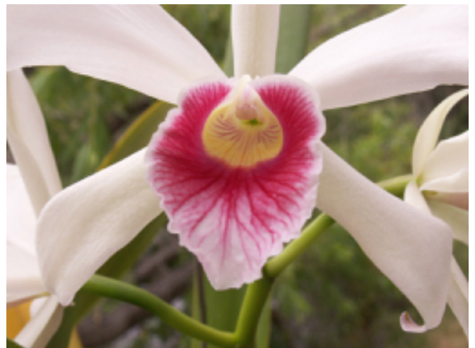
Laelia purpurata carnea (lip detail)