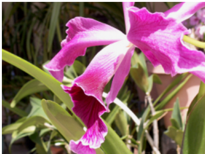
Laelia purpurata sanguinea