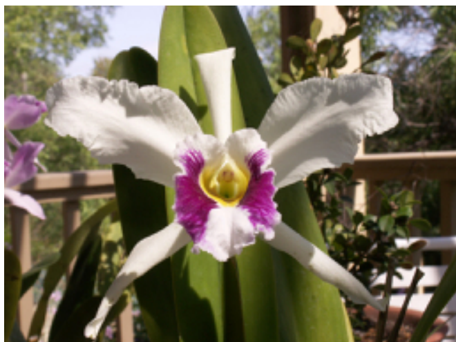
Laelia purpurata oculata . From Cal-Orchid December 1991. The only variety oculata I have seen.