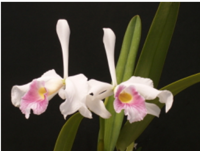
Laelia purpurata carnea