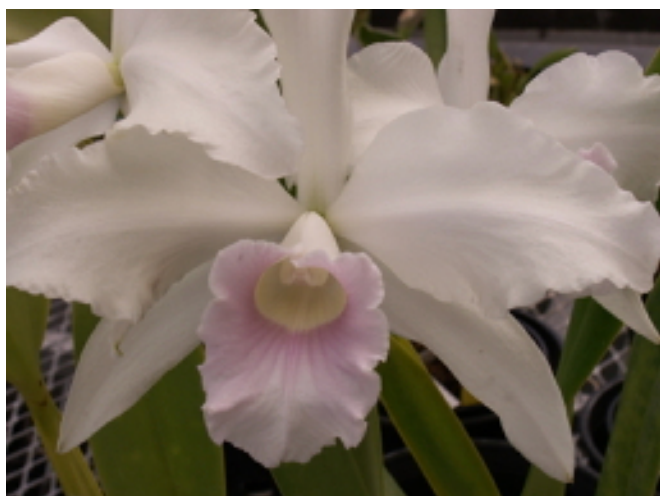
Laelia purpurata (variety unknown)