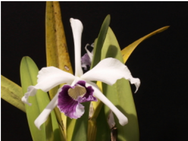
Laelia purpurata aco 'Clito' from Floralia July 1996

These photographs span the last 10 years. Most of these orchids are still alive today and producing fabulous flowers in June and July each year.