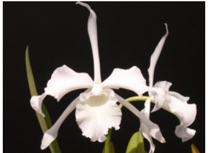
Laelia purpurata alba from Ecuagenera