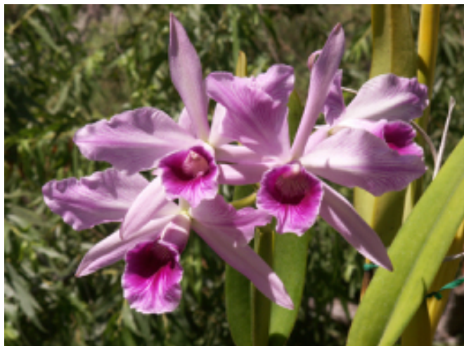
Laelia purpurata flamea 'do Elenesto' from Leucadia Orchids July 1992