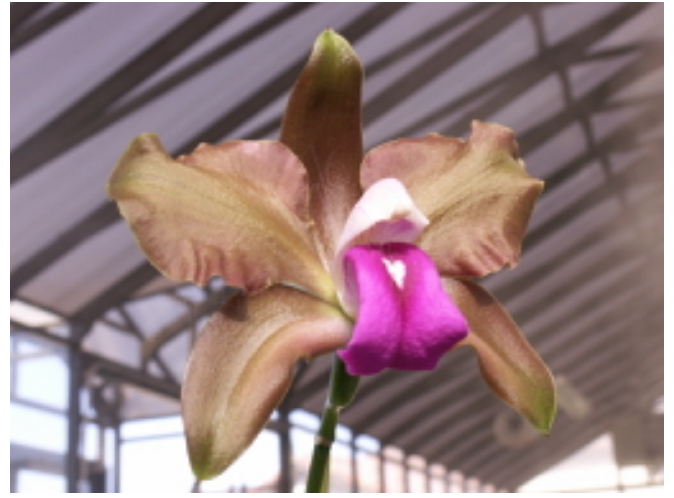
Cattleya bicolor (first bloom). The petal width stands out on this example, and the petal color is more bronze with a greener central area.