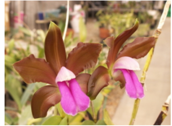
Cattleya bicolor. This bicolor has darker brown sepals and petals, the sidelobes are mostly white, and the lip is a lighter pink. The lip is also more narrow, and the dorsal sepal pointed.