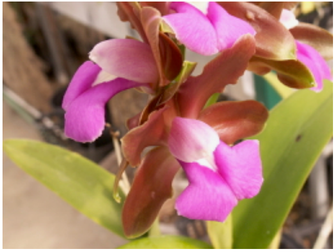
Cattleya bicolor var. braziliensis. The lip is flared at nearly right angles on each side.