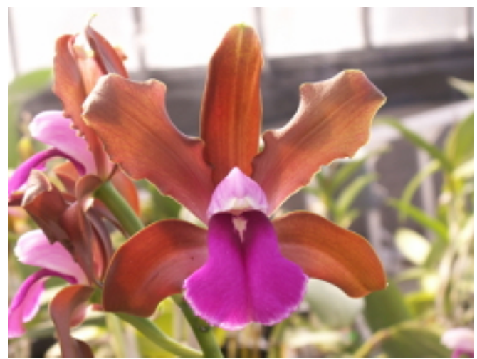
Cattleya bicolor. This example has lighter brown sepals and petals. The sidelobes covering the column are pink and the lip is a solid dark pink.

Although there are at least two distinct varieties of Cattleya bicolor, it is amazing how many differences your will find by growing different cultivars. Here are a few examples of the species, displaying differences one might not expect.