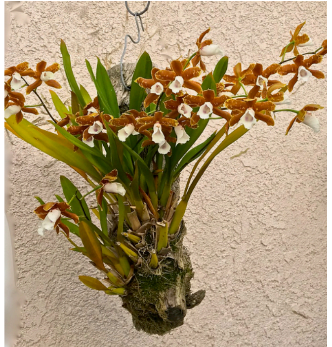
Miltonia candida