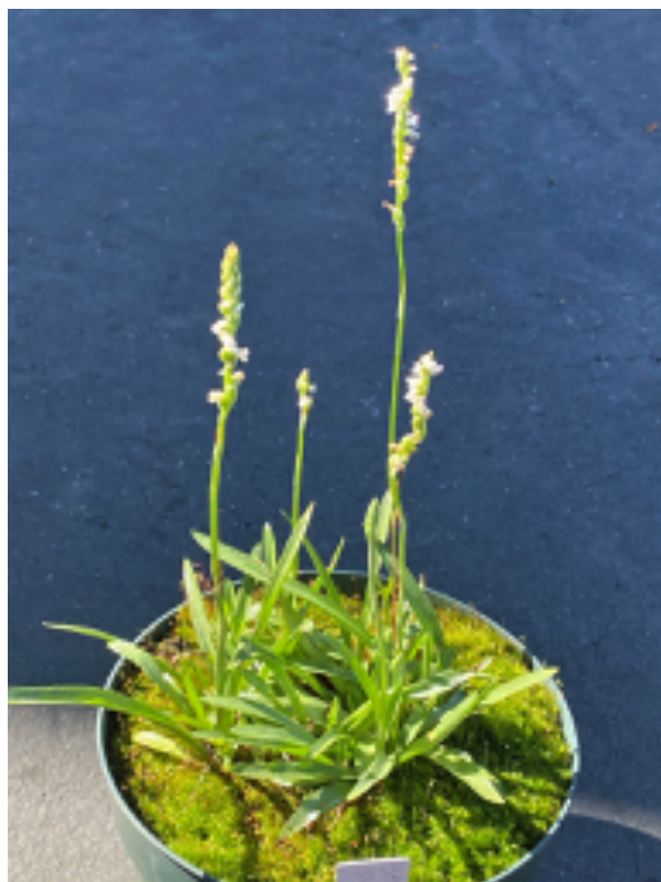
Spiranthes sinensis. The genus is named for the flowers that sequentially open in a spiral on the upright spikes. I find S. sinensis easier to grow than our native S. odorata, but both do reasonably well outside.