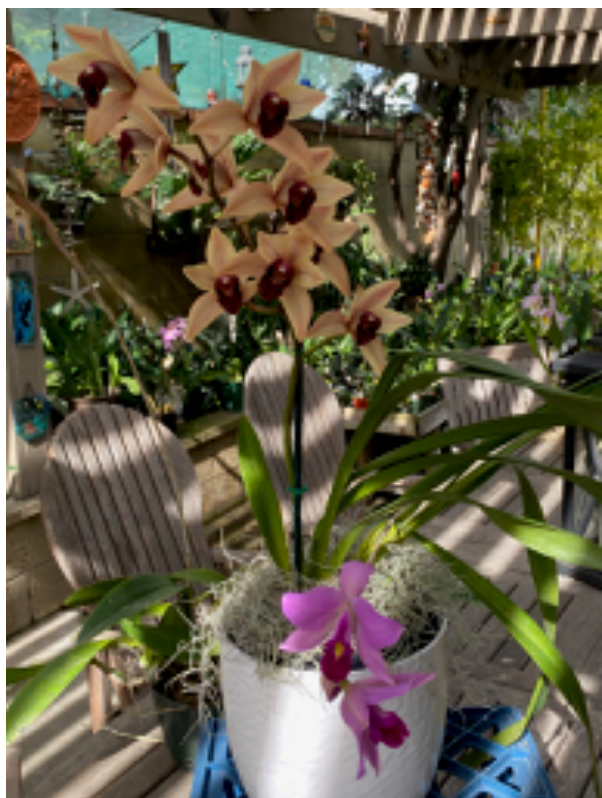
Cym. (Everglades 'Ivory Star' x Devon 'Odessey') and Laelia anceps roeblingiana 'La Jolla' x L. anceps 'Gigas'.