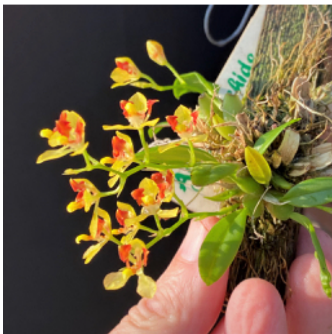
Gomesa ( Oncidium ) coloratum —an outdoor mini with long-lasting flowers. Scott McGregor

Sobralia (not) macra. Originally sold by Andy's Orchids as S. macra but now determined to be a new unidentified species. It has the unusual characteristic (for a Sobralia ) of blooming both from the top of mature canes, but also from the bottom of the plant on short, leafless spurs. The flowers last only a single day, but the plant flush-blooms repeatedly. Scott McGregor