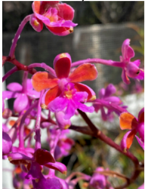
Oerstedella schwienfurthianum