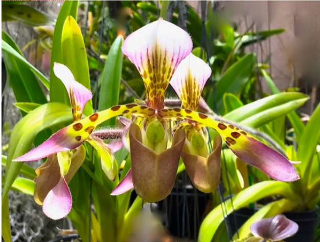
Paph haynaldianum.