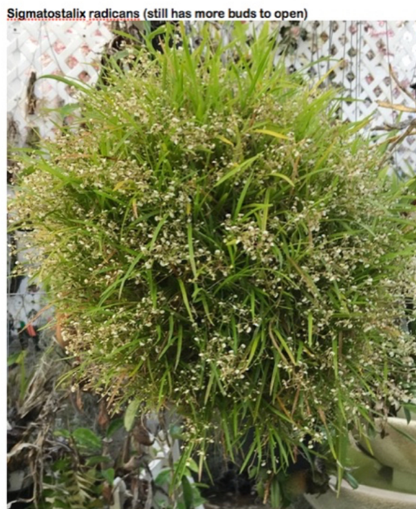
Sigmatostalix radicans (still has more buds to open) Sigmatostalix radicans. Lynn Wiand