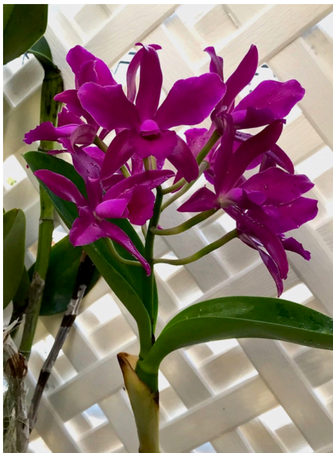
Cattleya Bactia 'Grape Wax'.