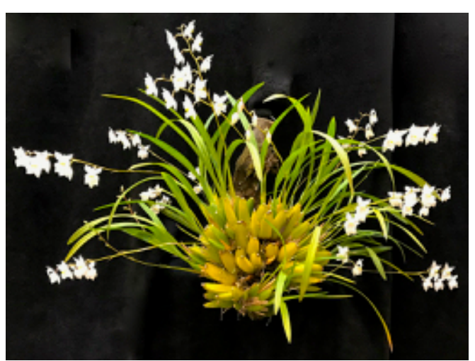
Osmoglossum pulchellum, a species from Mexico grows hanging on a tree branch over Lynn's patio. Lynn Wiand