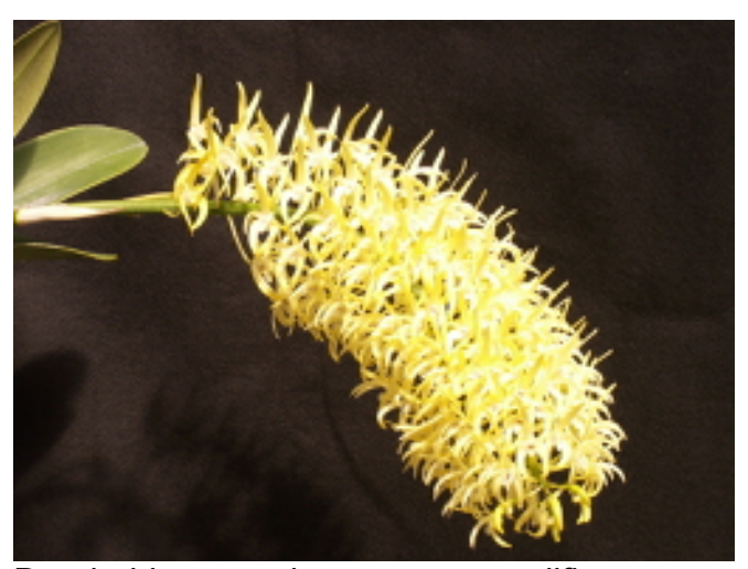
Dendrobium speciosum var. grandiflorum 'Dave's Gold' from Southern Queensland, Australia. Russ Nichols