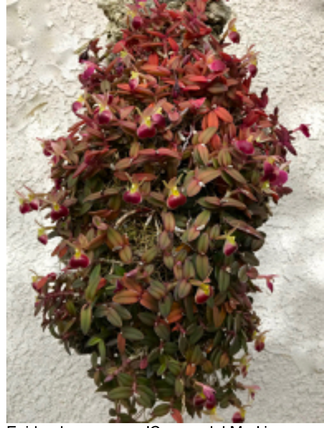
Epidendrum porpax 'Corona del Mar' is a species from Central America.