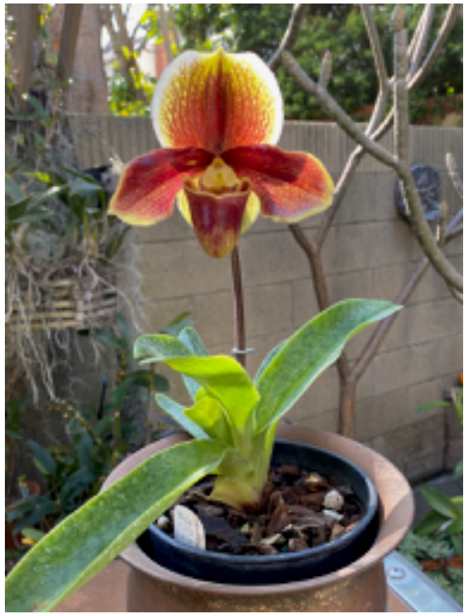
Paphiopedilum Hunston x Dragon Singer.