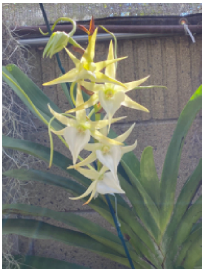
Angraecum Veitchii.