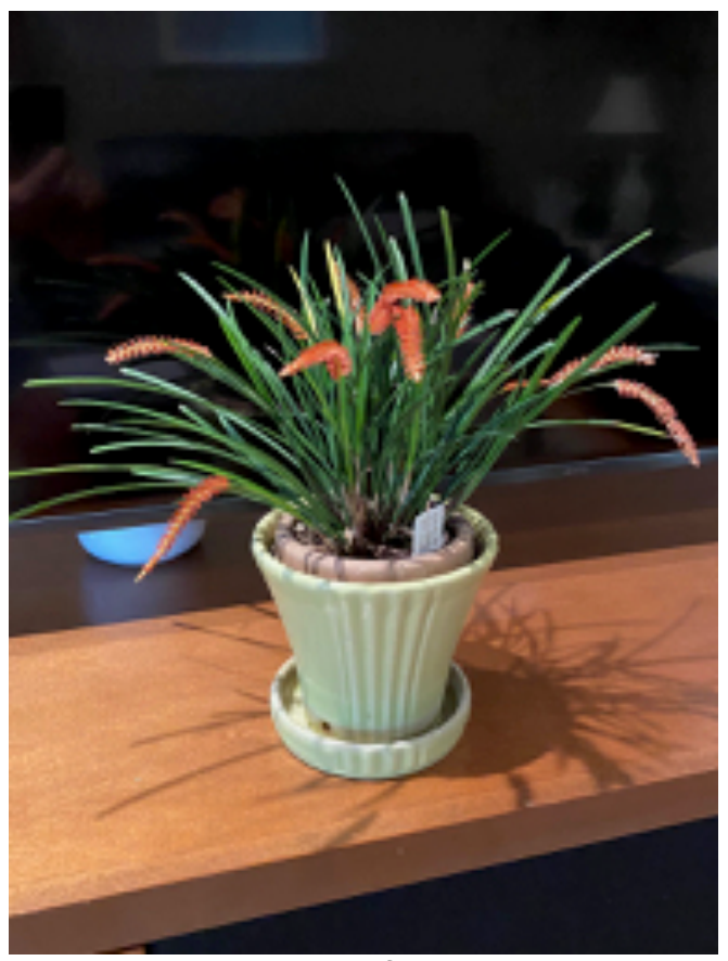
Dendrochillum wenzellii from the Phillipines is also known as the "red chain orchid".