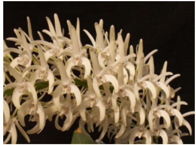
Dendrobium speciosum var. boreale 'Sky Shot' from Northern Queensland, Australia. Russ Nichols