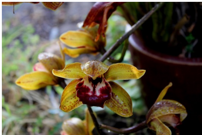
Cymbidium Dance Time, the last cymbidium to bloom this season.