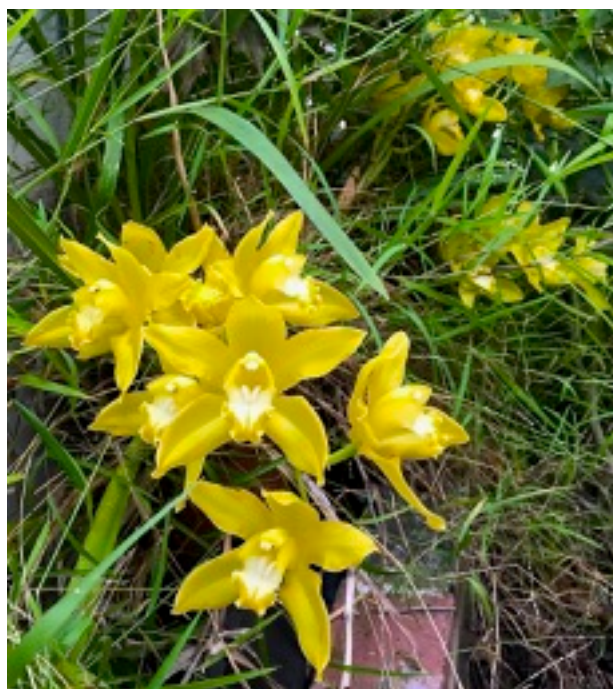
Cymbidium (lowianum x ?), 35 years and still alive and blooming in a forgotten corner of the yard. Lynn Wiand