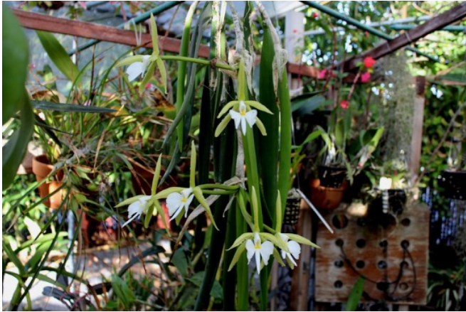
Epidendrum or Coilostylis, parkinsonianum grows large given time, space, and good conditions