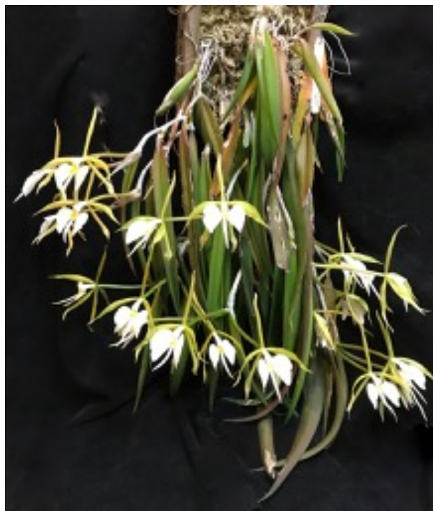
Epidendrum parkinsonianum , Mexican species purchased as a seedling at the NHOS show from Cal-Orchid. Grows easily outdoors. Fragrant at night. Lynn Wiand