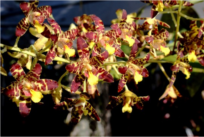
Ansellia africana.