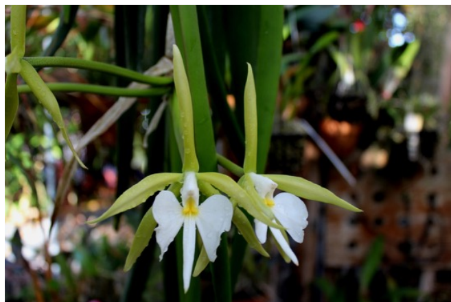
Coilostylis parkinsonianum (aka Epidendrum parkinsonianum; see prior page)