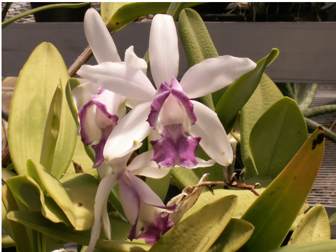
Cattleya intermedia fma. coerulea, this clone with lip side lobes also colored. Russ Nichols