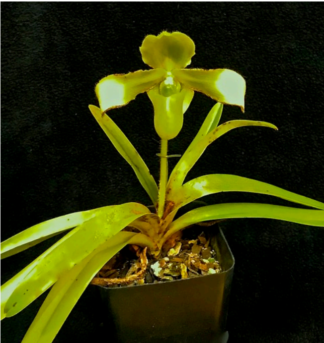
Paphiopedilum hirsutissimum album ('SVO' x 'Superb'); when older, this species will have multiple flowers on a tall spike. Lynn Wiand