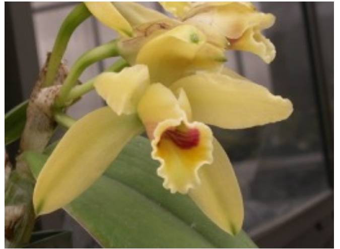
Cattleya luteola, about the same diameter as the Cattleya warscewiczii's lip (see third page)