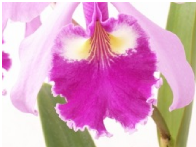
Cattleya warscewiczii , lip detail; a first bloom for this species orchid from Columbia, with two 8" diameter flowers. Russ Nichols