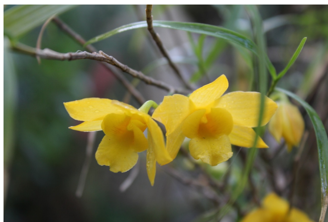
Dendrobium hancockii.