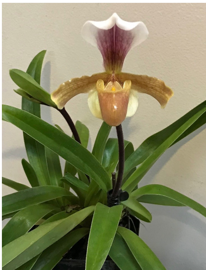
PAPHIOPEDALUM species areeanum (rhinomatsum) Burma 2 spikes (1 + 2)