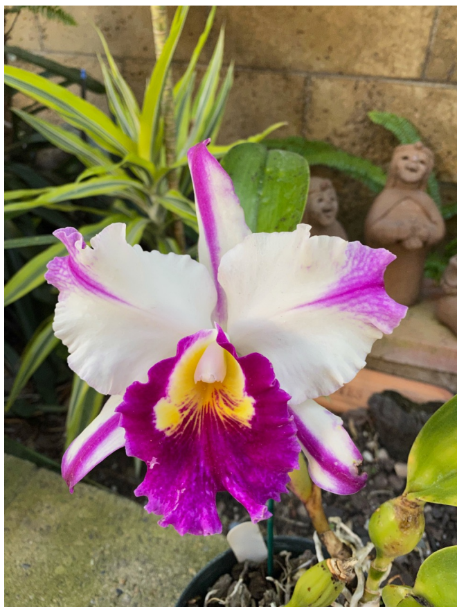
Blc. Ann Cleo 'Stars & Striped'.