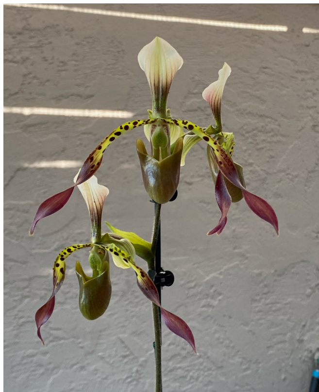
Paphiopedilum Bengal Lancer.