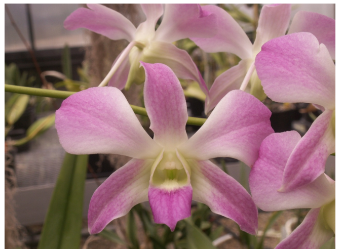
Dendrobium bigibbum.