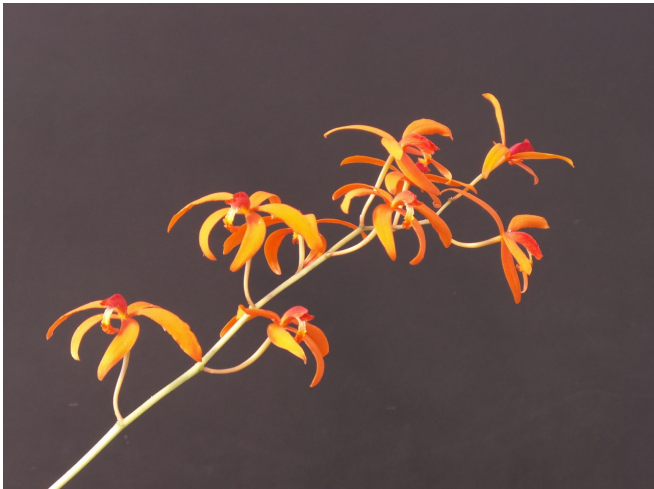
Laelia sanguiloba.