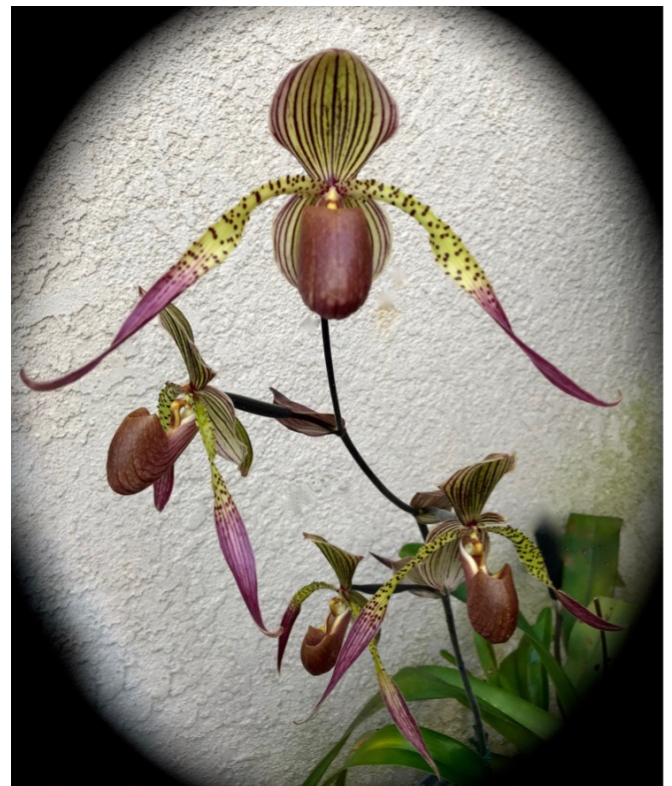
PAPHIOPEDALUM Julius (rothschildianum x lowii) 1-spk..better shape SVO