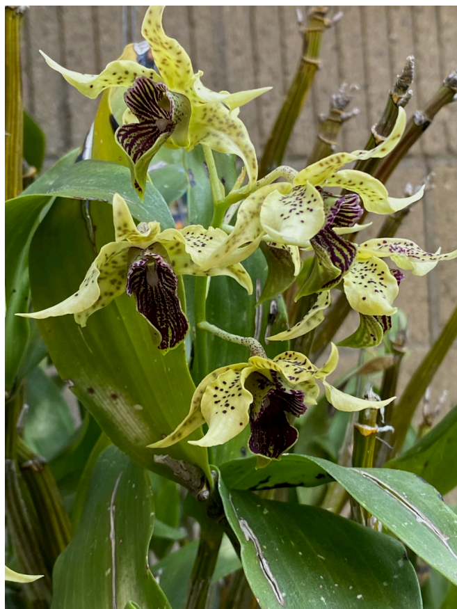
Dendrobium atroviolaceum..