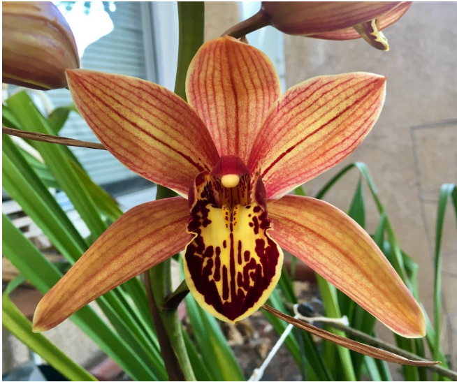
A very early blooming Cymbidium (name unknown).