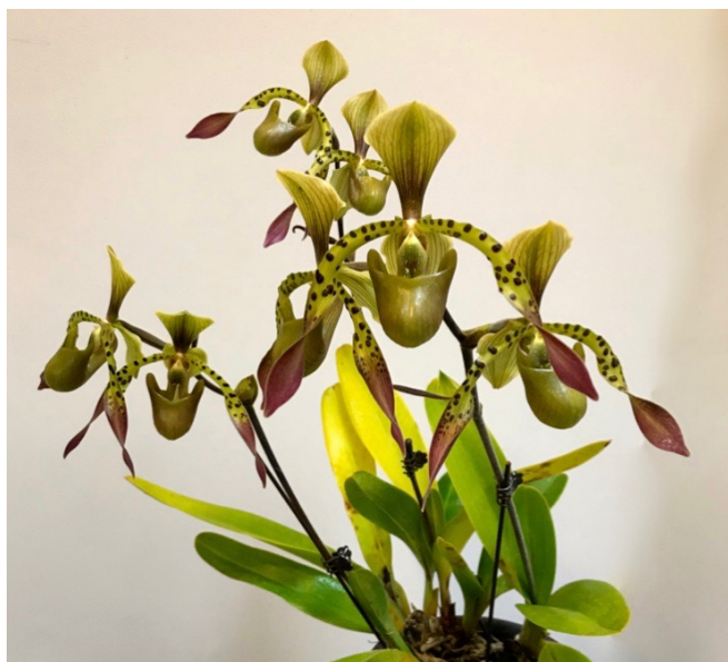
PAPHIOPEDALUM Linda Bell (lowii x Bengal Lancers) 3 spikes from Orchids Royale March 1994