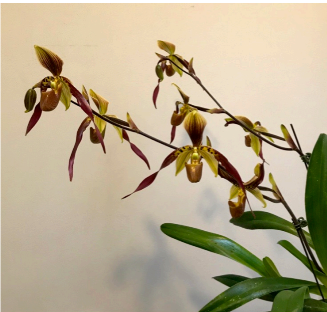
PAPHIOPEDALUM Berenice (philippense x lowii) 2 spikes