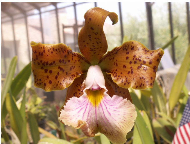
Cattleya velutina.