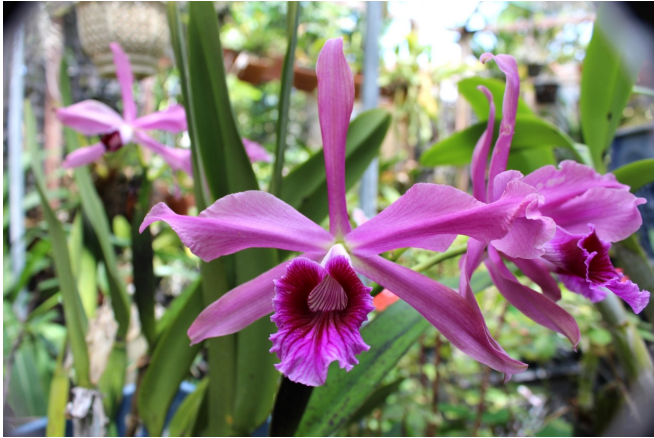
Cattleya Pacavia.