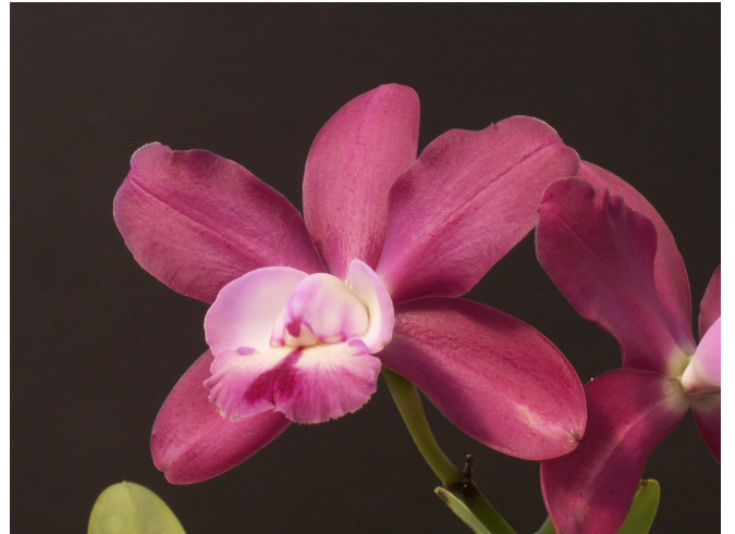
Cattleya Brabantiae 'Sentinel's Hot Pants' AM/AOS, an unusual color form. This plant is a mericlone from Cal-Orchid. Russ Nichols