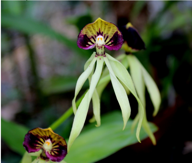
Encyclias cochleata.