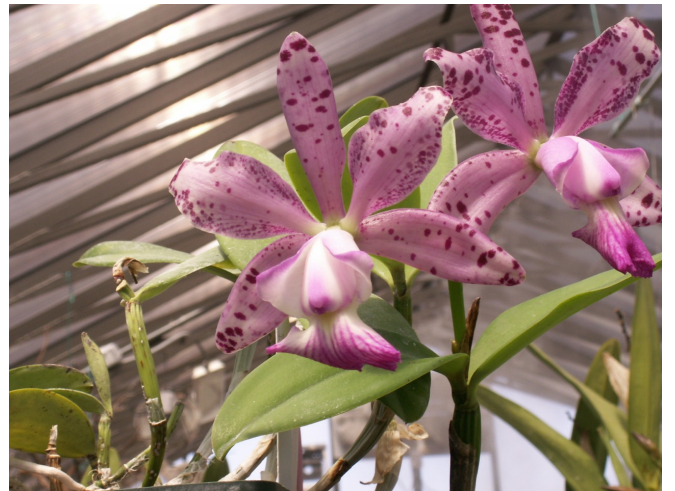
Cattleya Brabantiae, the more common color form. Russ Nichols