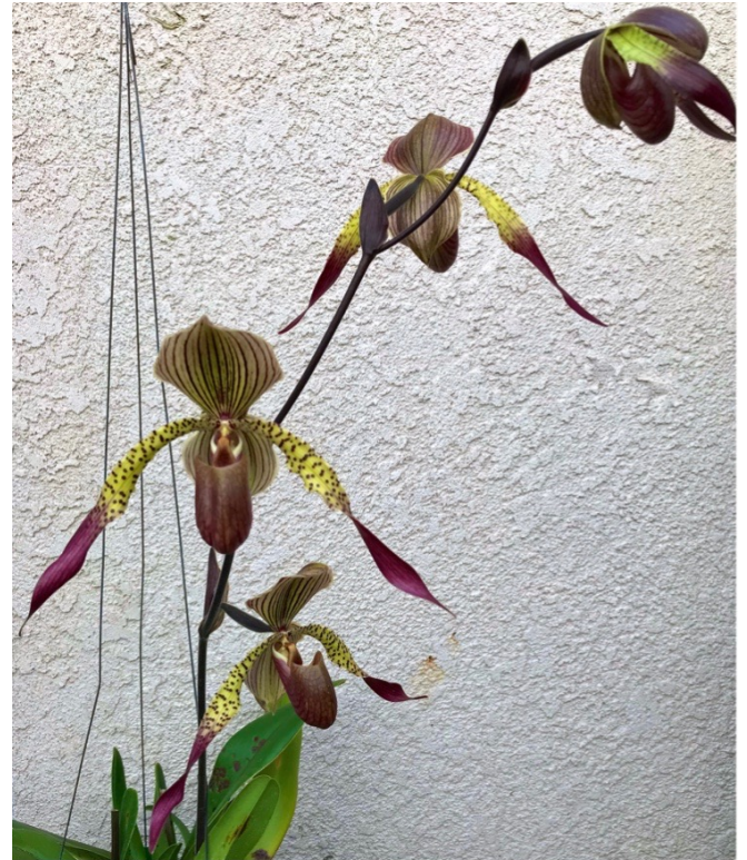
PAPHIOPEDALUM Julius (roth x lowii) 2 spikes okay shape