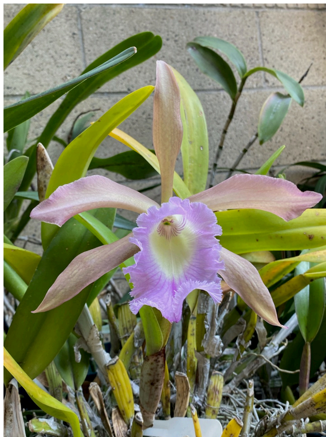
Laelia tenebrosa 'Rainforest' x B. digbyana.