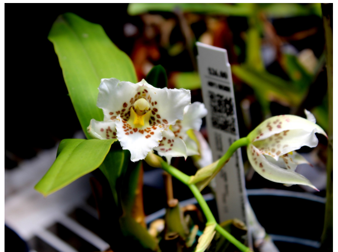
Rhynchostele aptera.