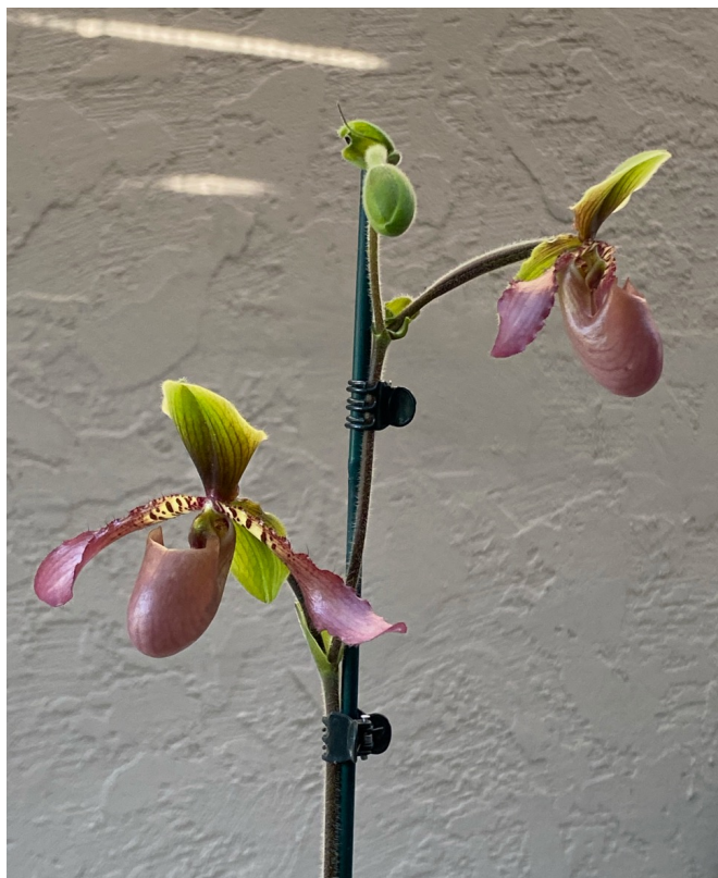
Paphiopedilum Glauco-lowii.