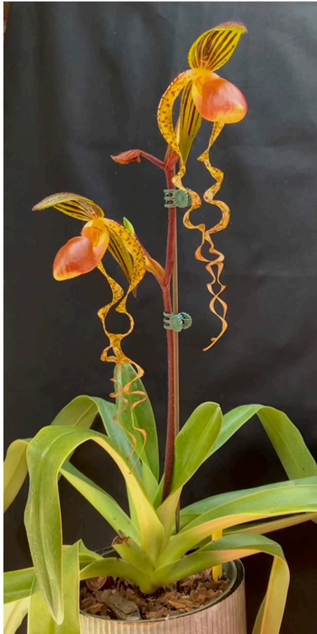
Paphiopedilum Chiu Hua Dancer, a primary hybrid between Paph. gigantifolium and Paph. sanderianum.