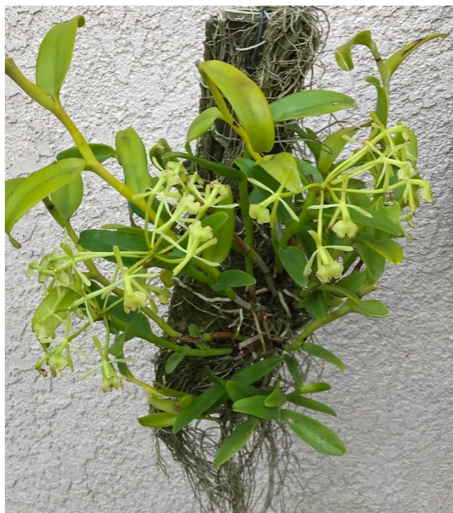
EPIDENDRUM species difforme (Mexico) 1" flowers