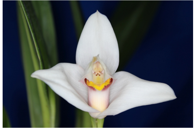
Maxillaria grandiflora.