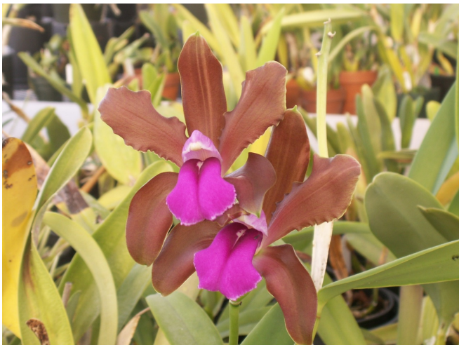
Cattleya bicolor (brownish-bronze sepals and petals, wider lip). Russ Nichols