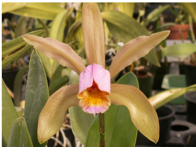
Cattleya forbesii