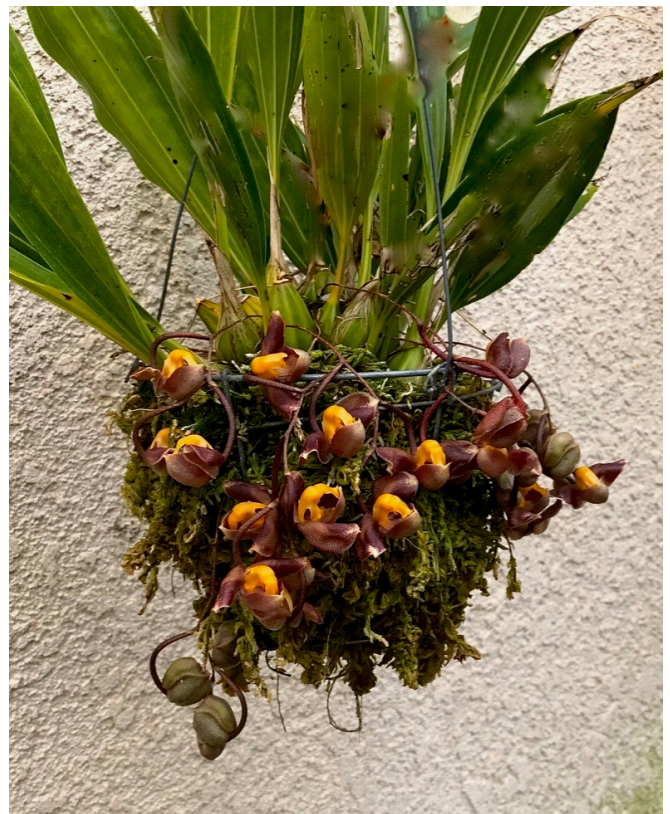
Gongora cassidea (Mexico)