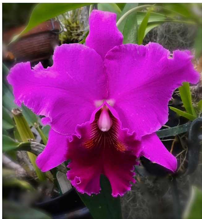
Blc Crispin Rosales ( C. Bonanza x Rlc Norman's Bay ) 7-1/2" GREAT fragrance!