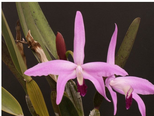
Laelia perrinii. Large flower for L. perrinii, about 6-7 inches in diameter.