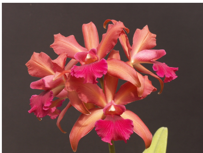
Unknown bifoliate from Park Nursery (R.I.P.) in LB circa 1993. Russ Nichols