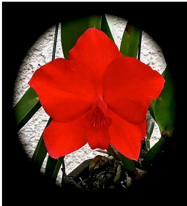
Slc Minipet (Sl Orpetii 'Kathleen' AM/AOS x Soph coccinea 'Higher Ground') 2-1/2" flower in 2" pot in a hanging basket