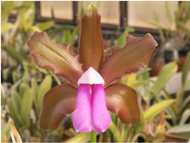
Cattleya bicolor (greenish-bronze sepals and petals, narrow lip). Russ Nichols