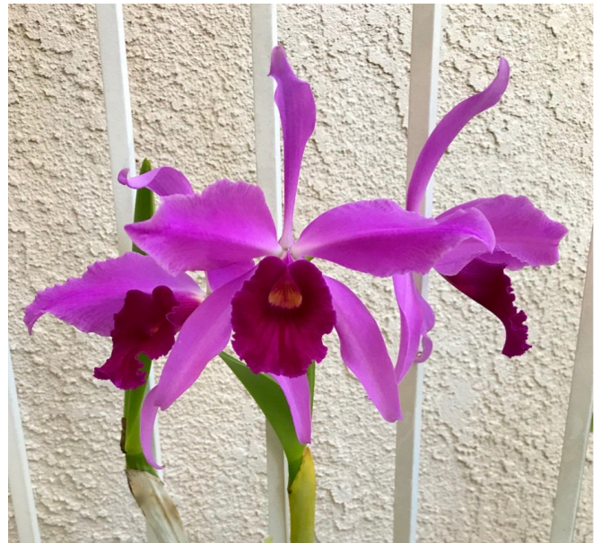
LAELIA (aka Cattleya) purpurata