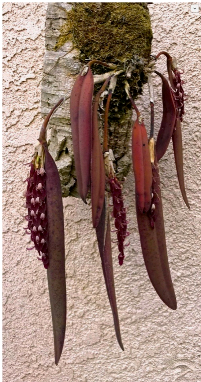
Pleurothallis strupifolia (Brazil)