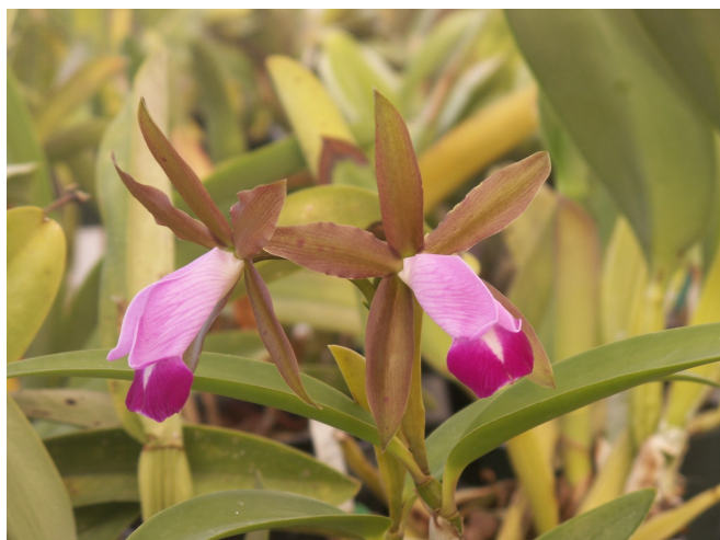
Cattleya dormaniana.