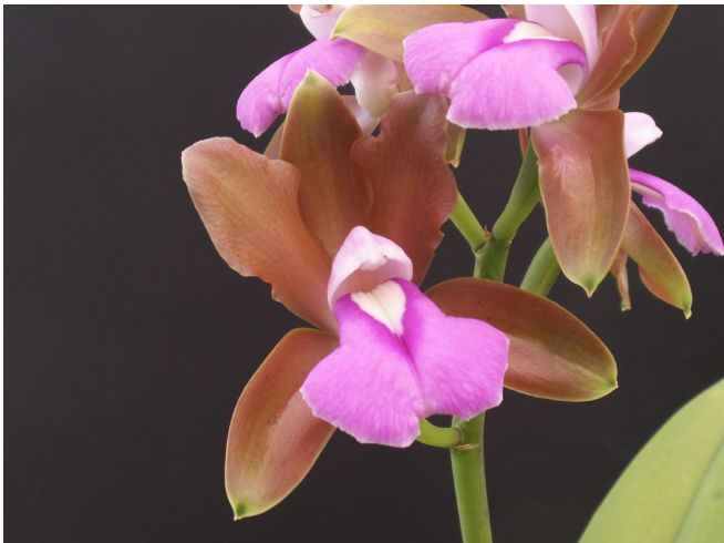
Cattleya bicolor.