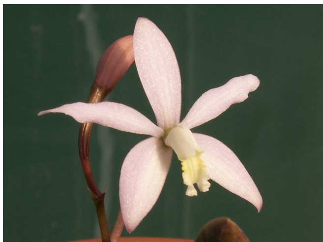
Laelia ghillanyi, one of the tiny rupicolous Laelias.