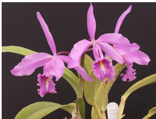
Cattleya maxima (lowland variety). Russ Nichols