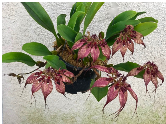
BULBOPHYLLUM rothschildianum 'Adoribil' FCC/AOS lsw This guy smells like something DIED !!!