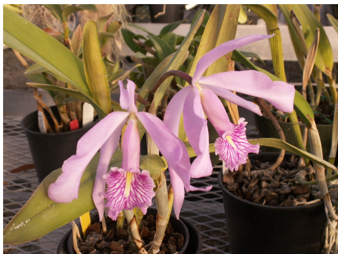
Cattleya maxima (lowland variety). Russ Nichols