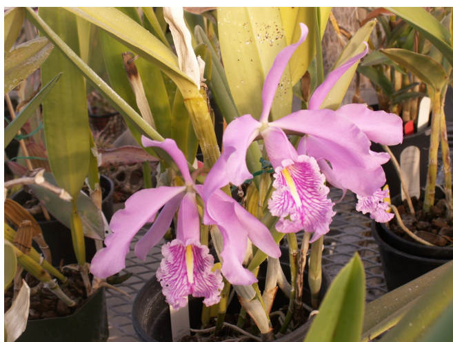
Another Cattleya maxima (lowland variety).