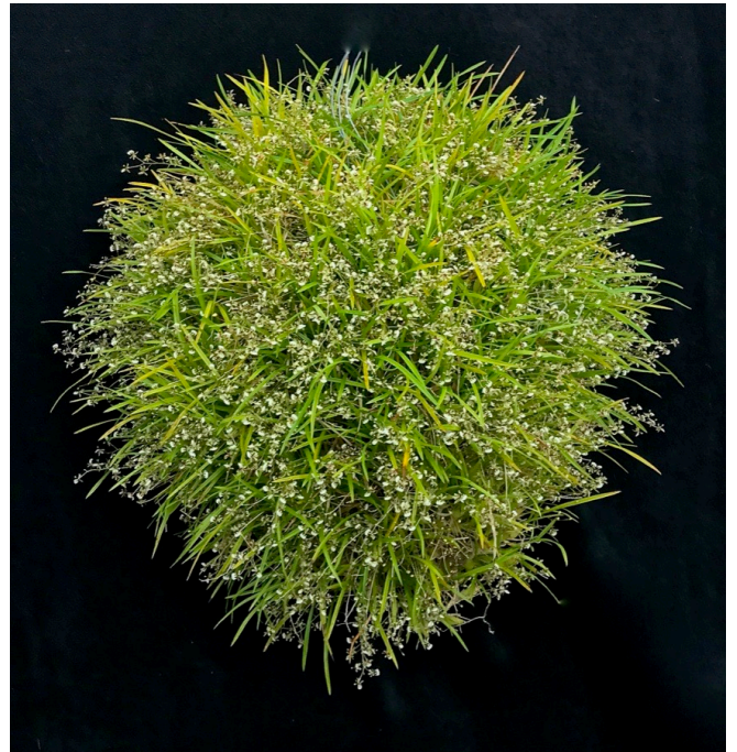
SIGMATOSTALIX (aka ORNITHOPHORA ) radicans BRAZIL.....more flowers this year than ever before! LSW