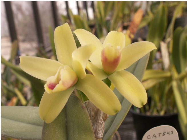
Cattleya luteola.