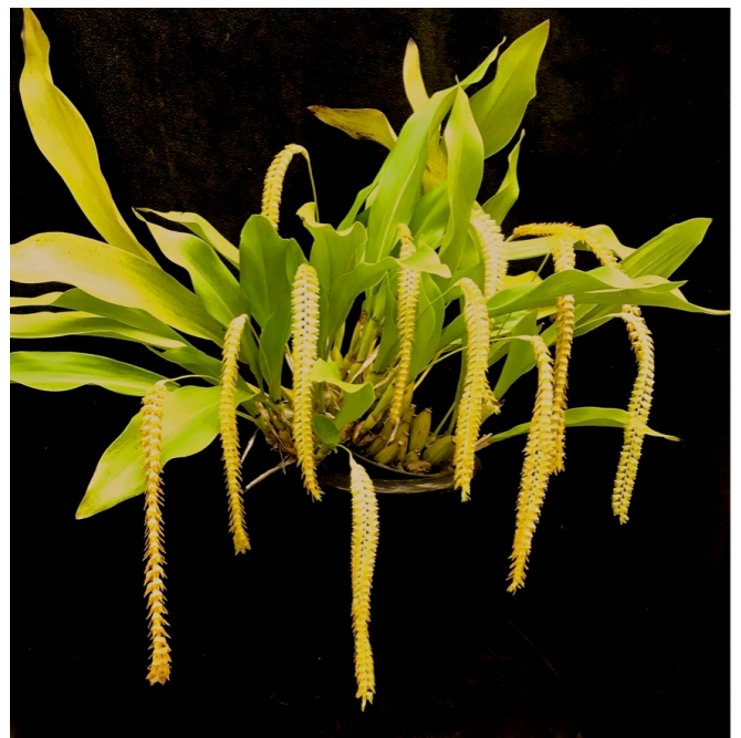
DENDROCHILUM magnum 14 spikes LSW