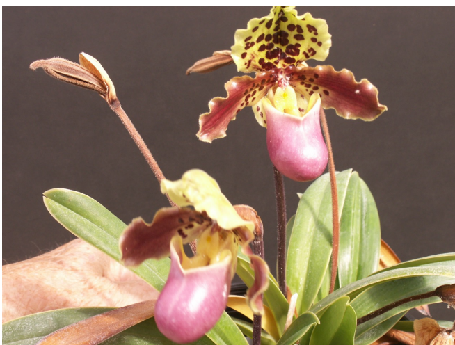
Paph henryanum.