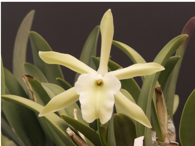
Brassavola glauca.