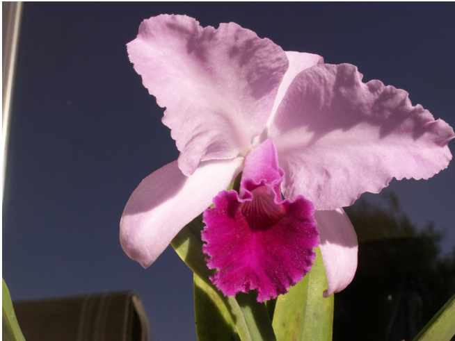
Cattleya trianaii (first bloom in 10 years).