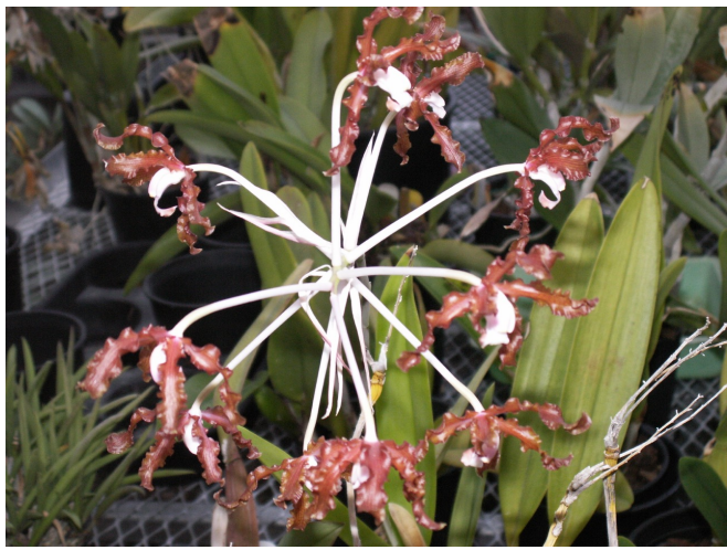
Schomburgkia weberbaueriana from Peru.