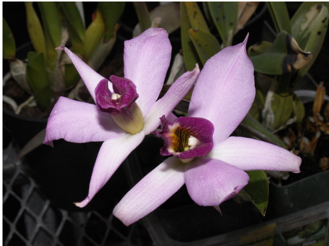
Laelia anceps, pointed flower segments due to low humidity. Russ Nichols