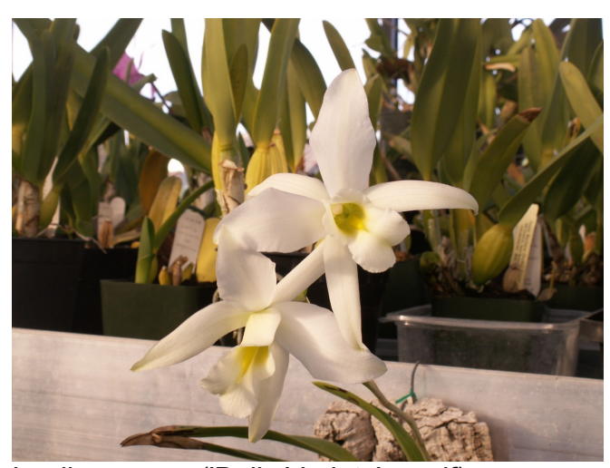
Laelia anceps ('Bulls Variety' x self), a very pure white with yellow throat make this a breeding favorite. Russ Nichols