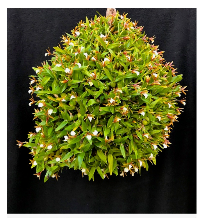
Encyclia polybulbon 'Cressy' species collected in Belize 1987 Lynn S. Wiand