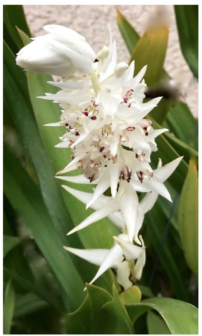
Eria vanoverberghii close up.