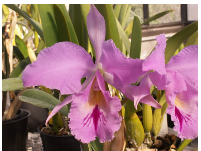
Cattleya jenmannii from Venezuela.