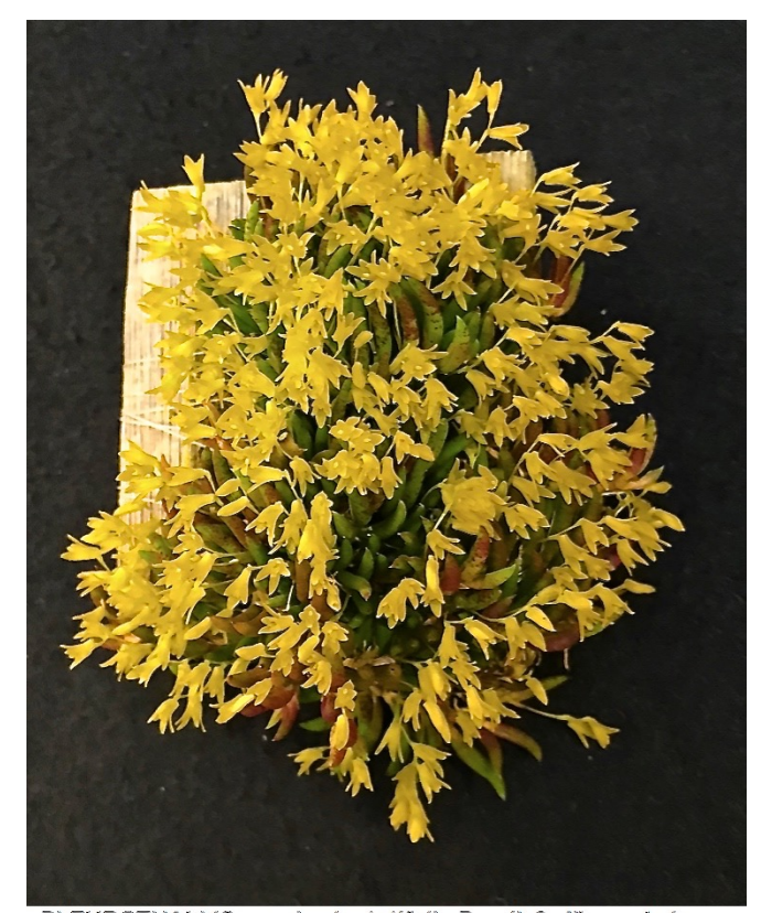
PLEUROTHALLIS species leptotifolia Brazil 3x4" wood plaque Lynn S. Wiand