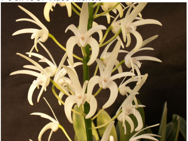
Dendrobium speciosum var. capricornicum 'Southern Cross', always the first Den. speciosum to bloom each year. Russ Nichols