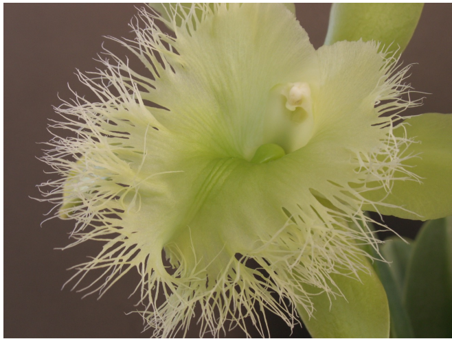
Brassavola (Rhyncholaelia) digbyana 'Mrs Chase' AM/AOS.