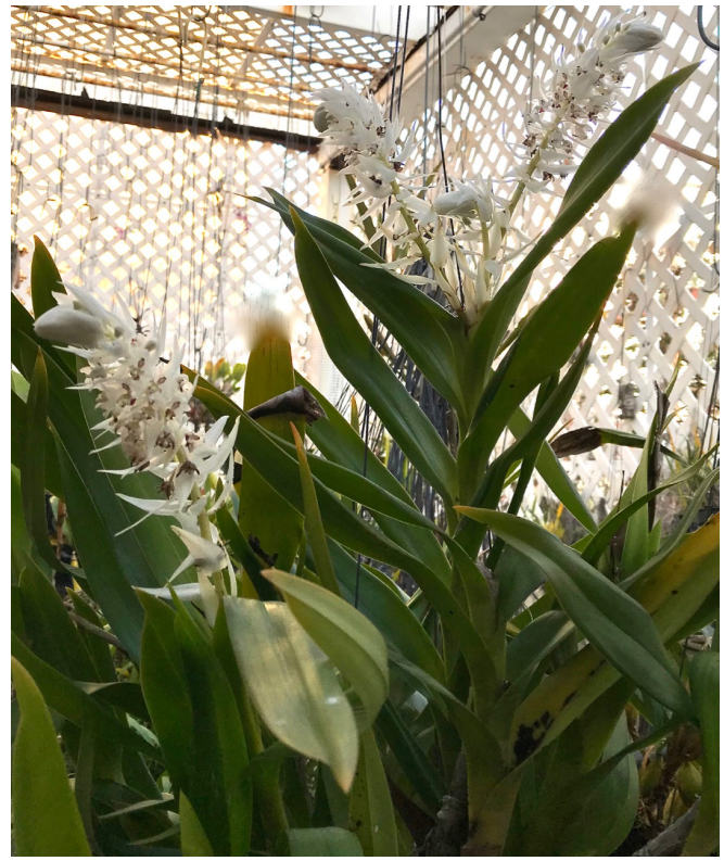
Eria vanoverberghii from the Philippines (two feet tall).