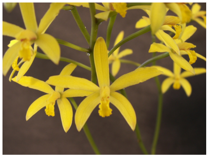
Laelia endsfeldzii from Brazil.