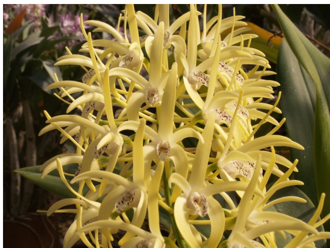
Dendrobium speciosum var grandiflorum ( 'Kroombit Gold' x 'Gallangowan' ). Russ Nichols