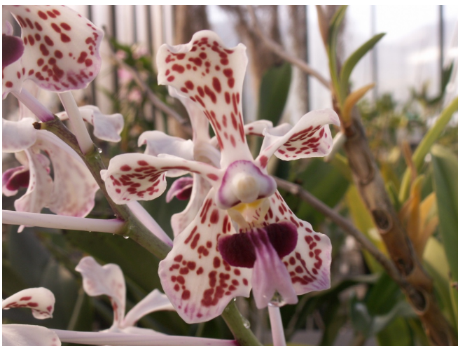
Vanda tricolor.