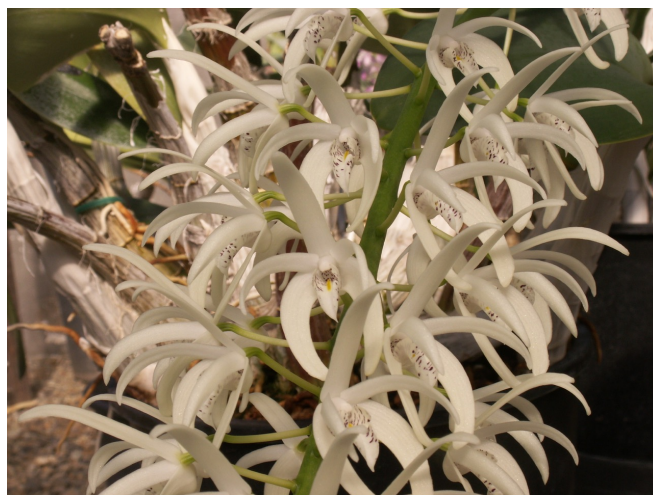
Dendrobium speciosum var speciosum 'Best Wattagan White' . Russ Nichols