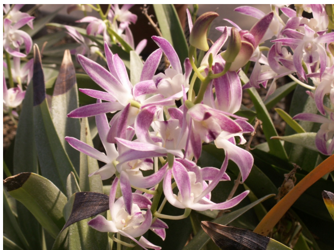
Dendrobium Specio-Kingianum.