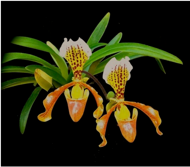
Paphiopedalum Nitens 'Sue' (insigne x villosum)