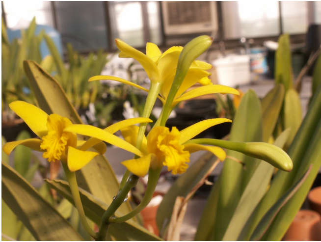
Laelia flava from Brazil.