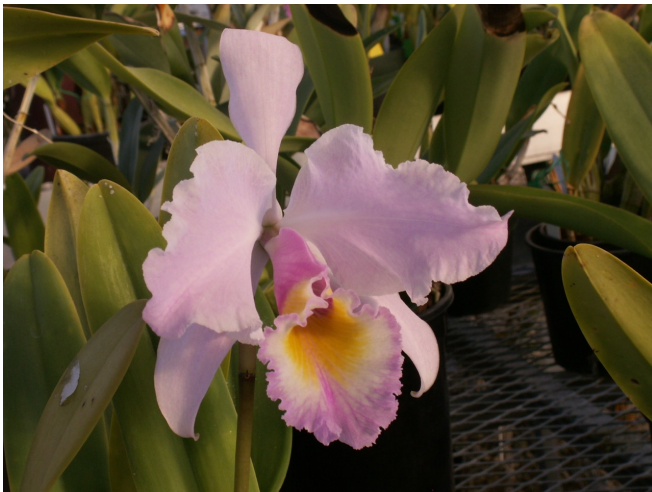
Cattleya schroederae.