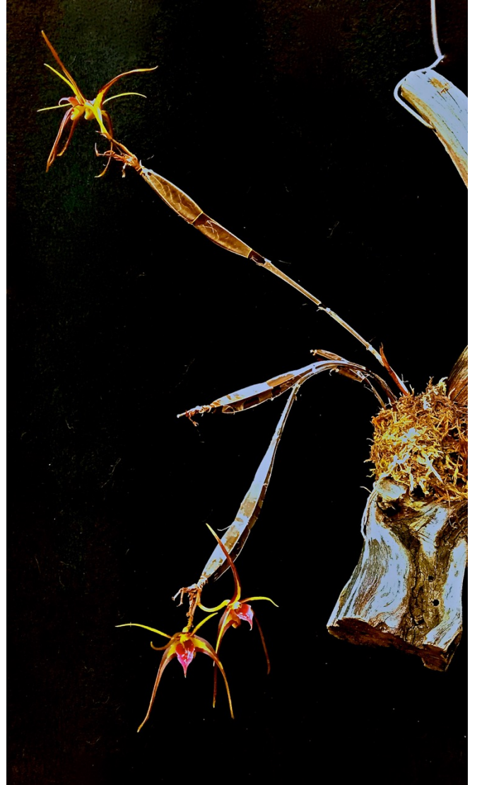
Dendrobium tetragonum from South East Australia. Lynn S. Wiand