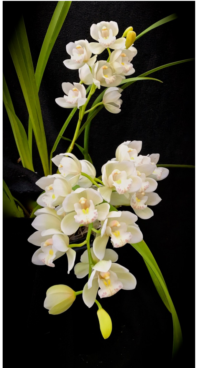
Cymbidium Cotton Ball (Sarah Jean x insigne 'alba').