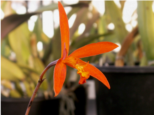
Laelia colnagoi from Brazil.