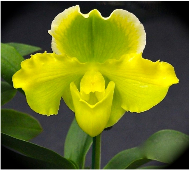
PAPHIOPEDALUM Coro Beauty (Donna Hanes x Alex Szebo*5)