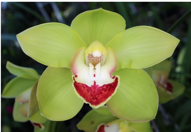
Cymbidium Shake Your Booty John McCoy

Mariposa Gardens donated 10 unbloomed seedlings to our 2018 auction. Unsold plants were kept for later SCOS meetings. Two went into the silent auction. Eight remain, and three have bloomed. They all look like something out of a tidepool, all spots and sepal-peloric shading. Some have better spots but less color overall, more pale green with maroon spots.