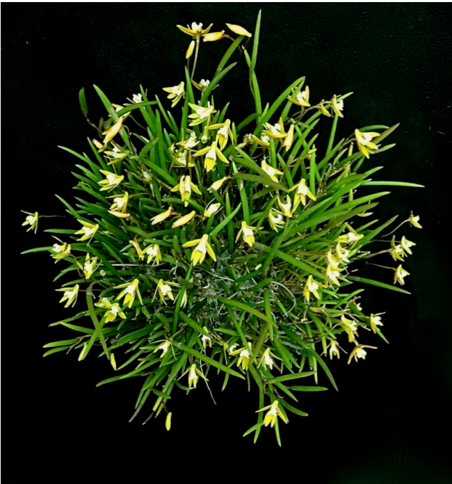
DENDROBIUM striolatum (Tasmania)