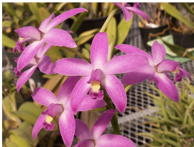
Laelia crispata from Brazil. Another rupicolous Laelia.