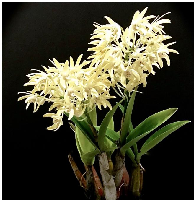
DENDROBIUM speciosum pedunculatum (smallest speciosum species)