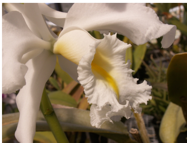
Cattleya maxima alba from Floralia 2013, first bloom. Fragrant. Russ Nichols

The actual plant is 12" tall in a 3-1/2" pot but trying hard to bust out. Spikes are upright without staking. Acquired as a little seedling at the NHOS in 2012; this may be a first or second blooming.