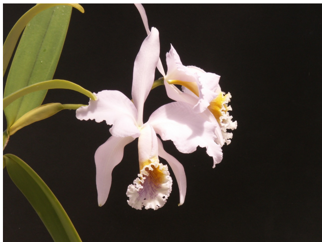
Cattleya mossiae coerulea