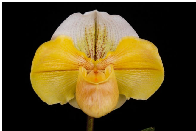
Paph. Stone Crazy 'Beauty' HCC/AOS. AOS Award photograph by Art Pinkers of Tim's 'Beauty'.