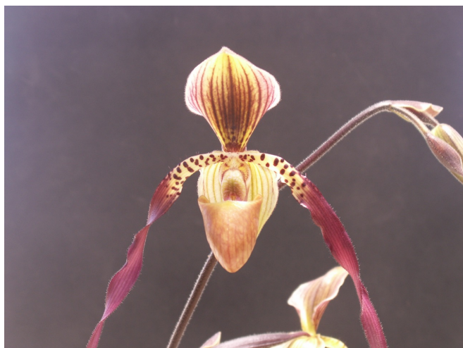
Paph. Berenice (lowii x phillipinense)