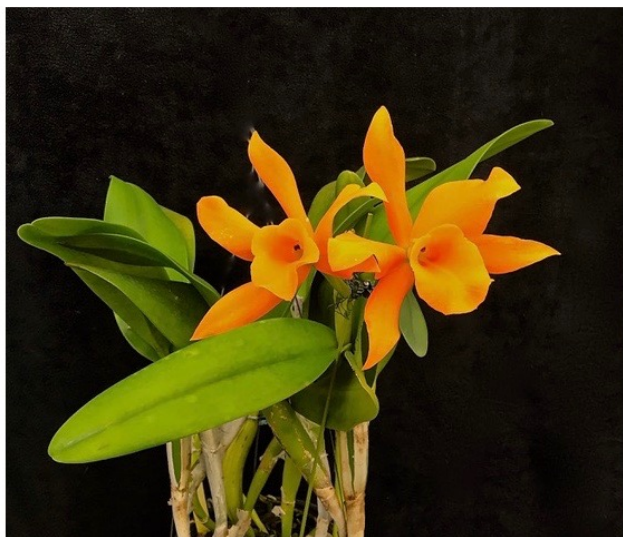
BLC Haw Yan Gold 'Y2K' x LC Daffodil 'Bees Wax'