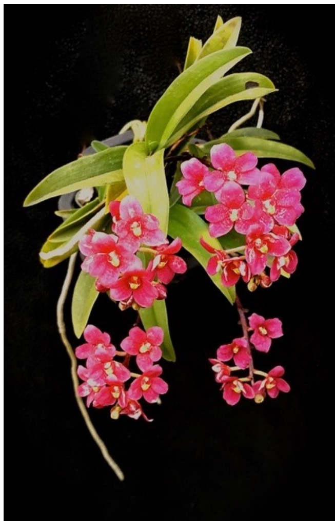
Sarcochilus (Bunyup x Elegance)