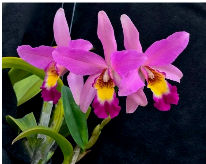
LC Tropical Song 'Tango' x L anceps 'Gigas'