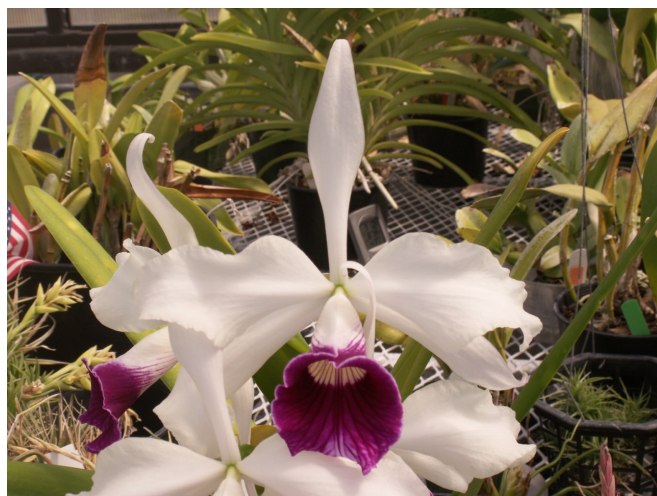
Laelia purpurata ('Schusteriana' x 'Cindarosa')