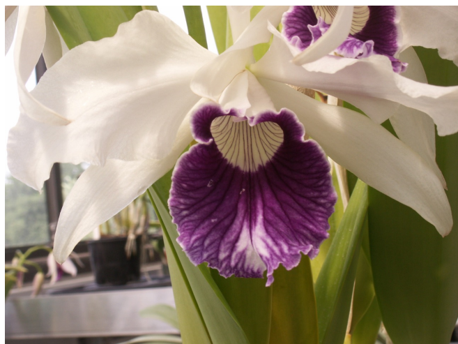
Laelia purpurata 'Schusteriana'