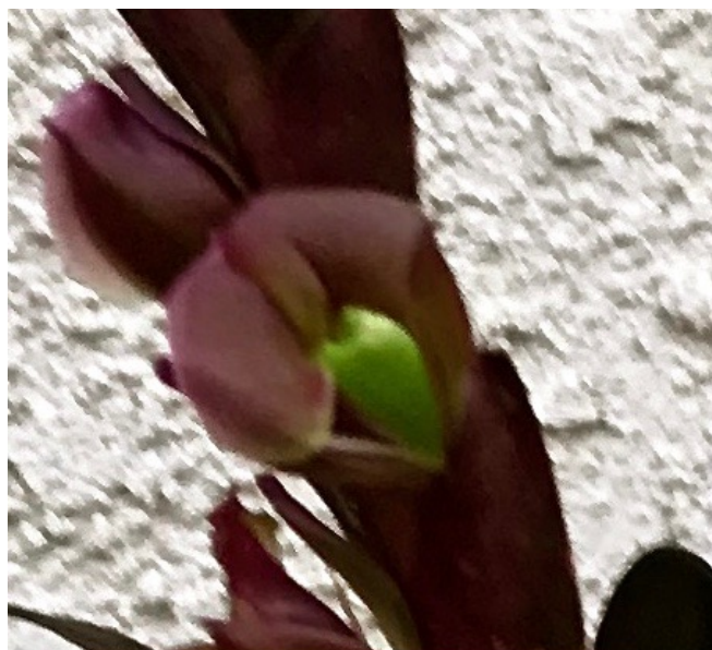
EPIDENDRUM summerhayesii Close-up