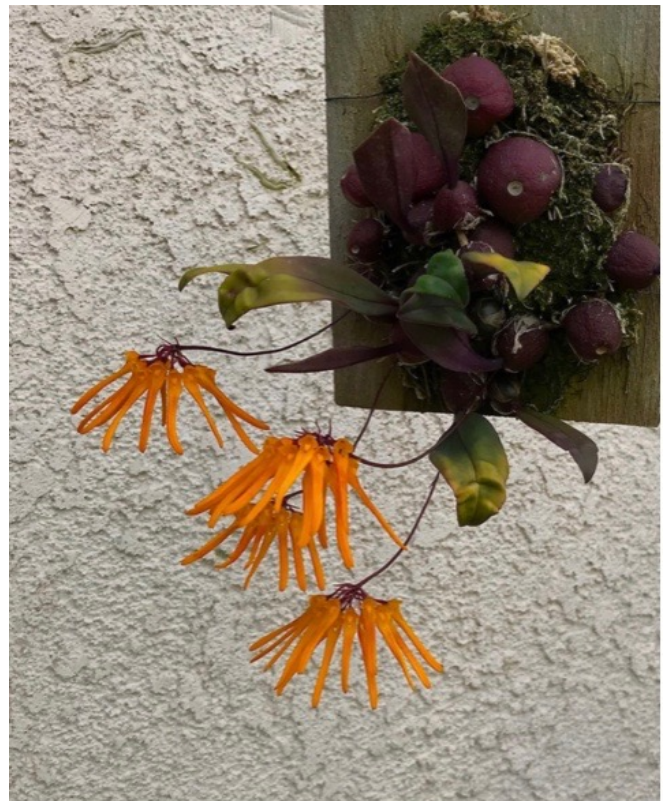
BULBOPHYLLUM thalorum (yellow form) Vietnam