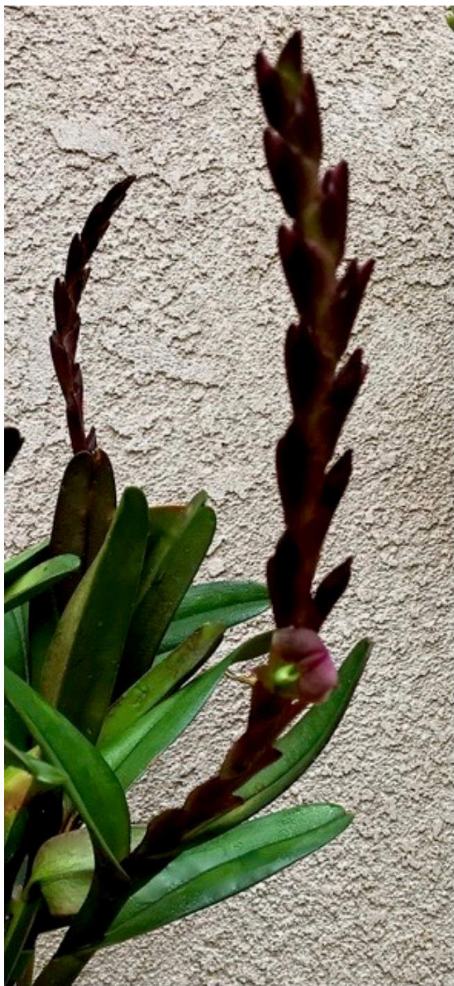
EPIDENDRUM summerhayesii Multi growths off and on all year...blooms one flower at a time starting from bottom of each spike...stinky fragrance