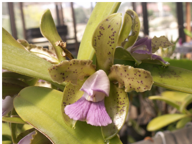
Cattleya leopoldii coerulea