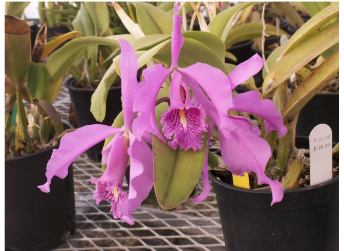
Cattleya maxima , lowland (darker) variety Russ Nichols