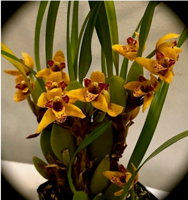
MAXILLARIA Ben Berliner 'Yellow Cape' AM/AOS Strong but wonderful fragrance!

Many thanks to those members, who submit photos for the newsletter, and for our member's enjoyment.