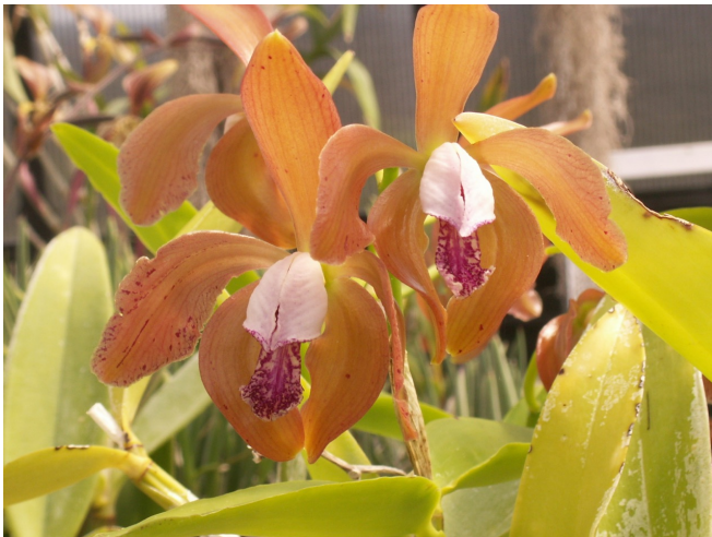
Cattleya porphyroglossa.