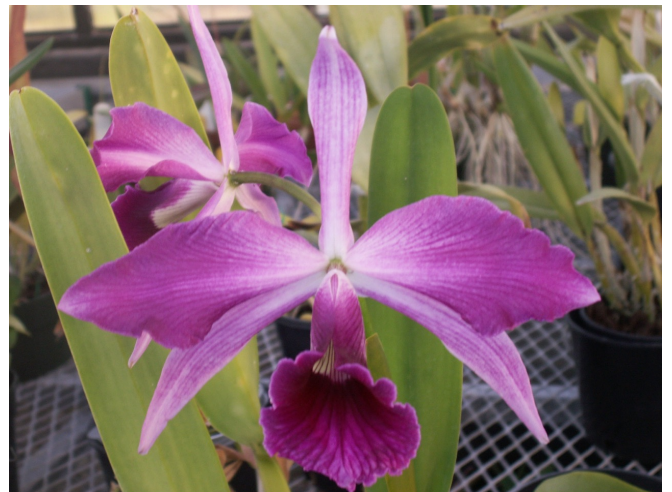
Laelia purpurata var. sanguinea , always among the last purpurata varieties to bloom