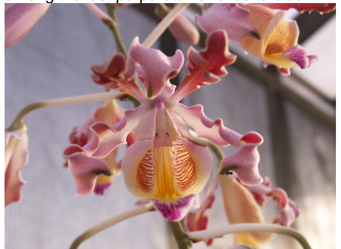
Schomburghkia tibicinis , oddly beautiful