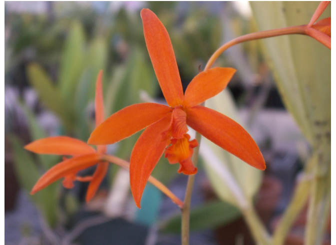
Laelia colnagoi , a relatively recent discovery