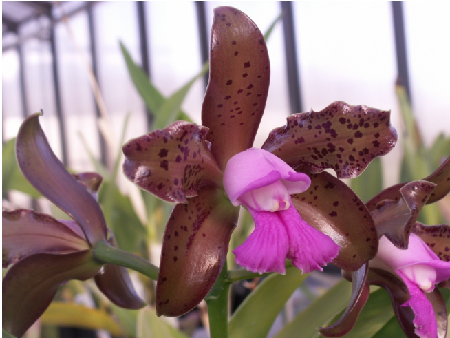
Cattleya leopoldii (tigrina), fragrance to die for