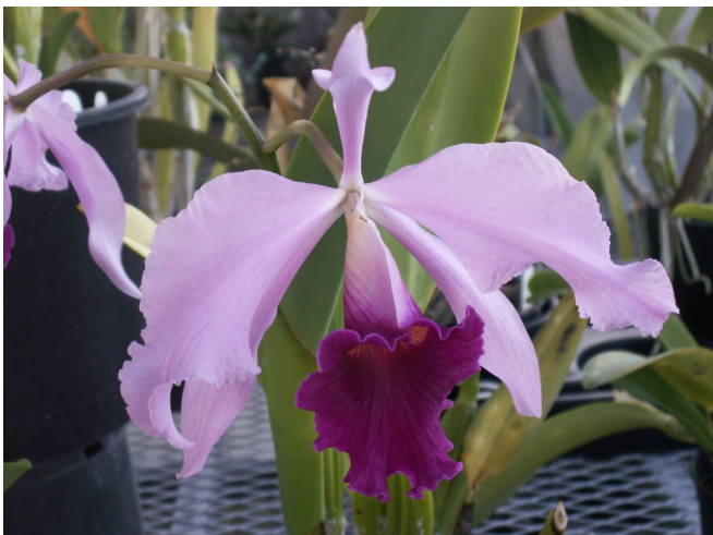
Lc. Calistoglossa , a primary hybrid