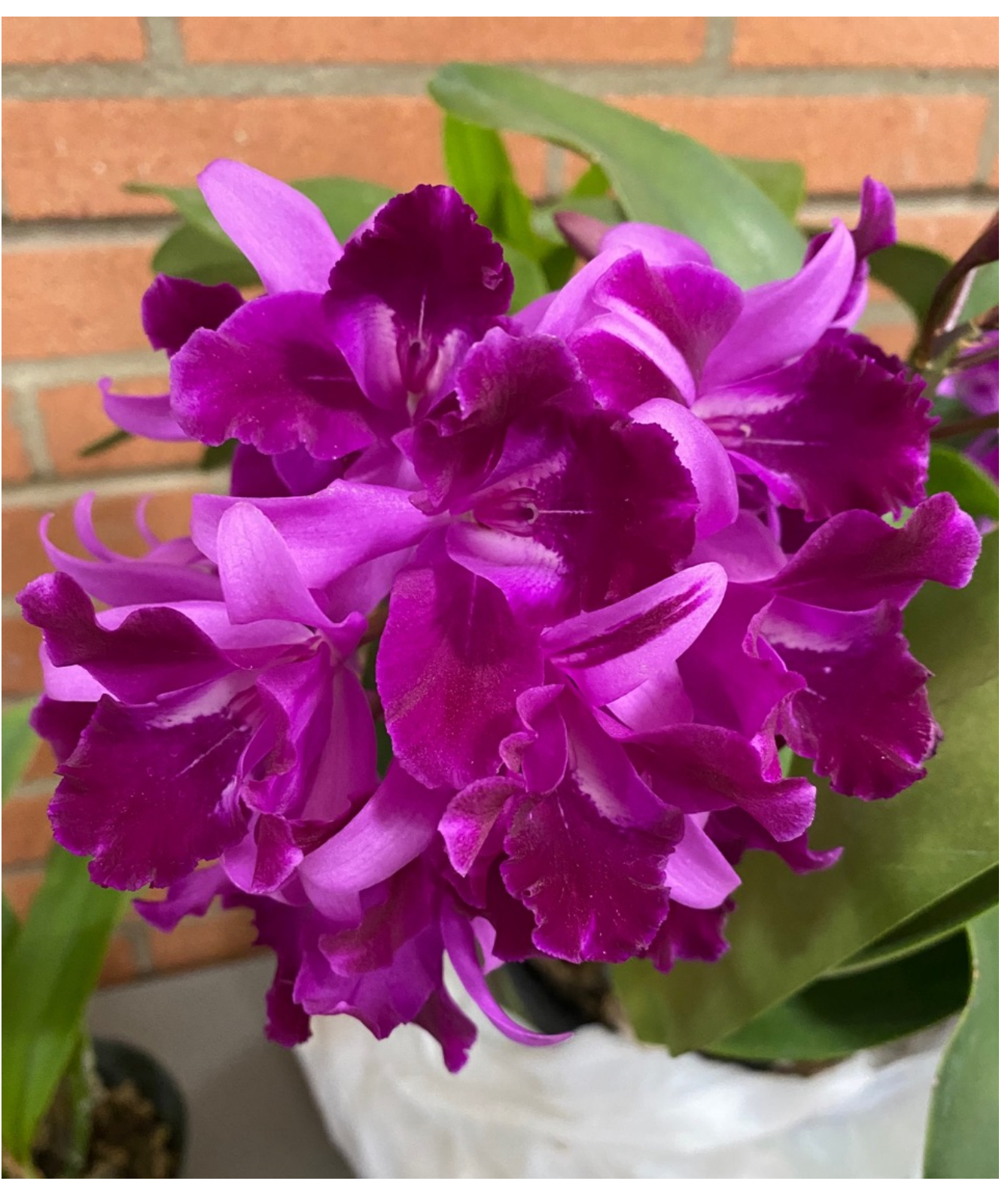
Lc. Tristar Bouquet 'Hawaii'

Thanks to our members for bringing these orchids in for display, and thanks to Mong Noiboonsook for photographing them.