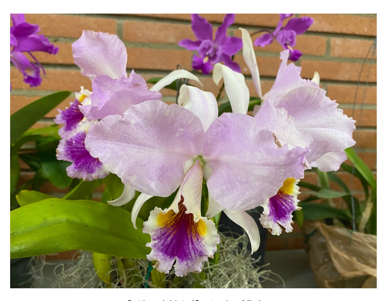
Cattleya labiata 'September Mist'