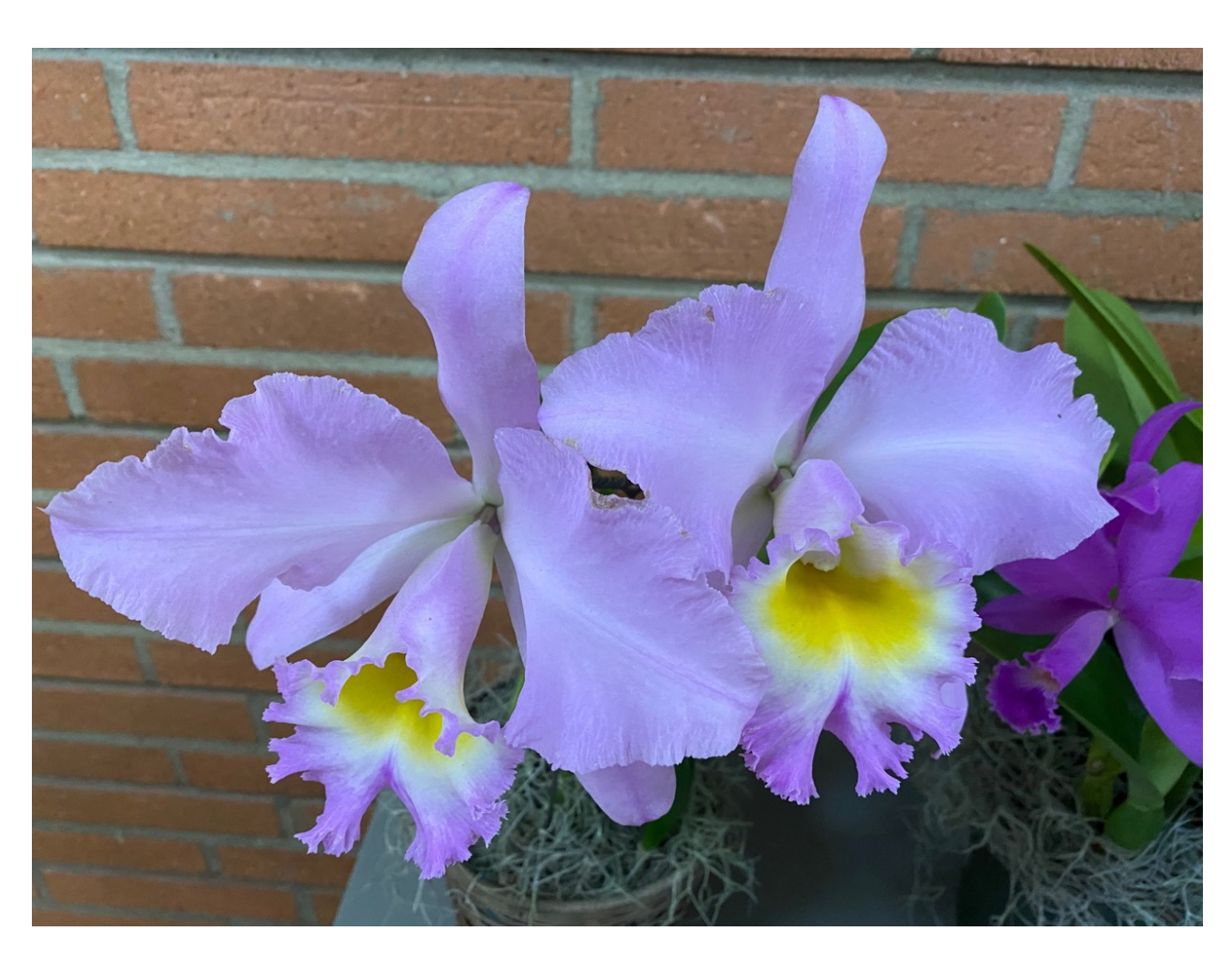
Blc. Nacouche 'Pink Feathers'