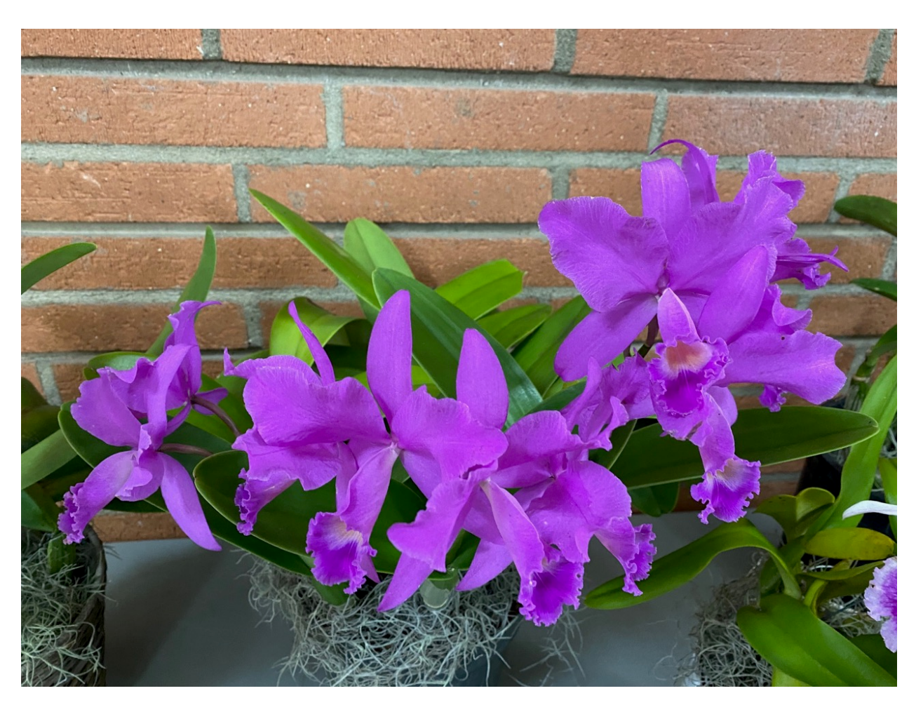
Cattleya deckeri 'Brecht's'