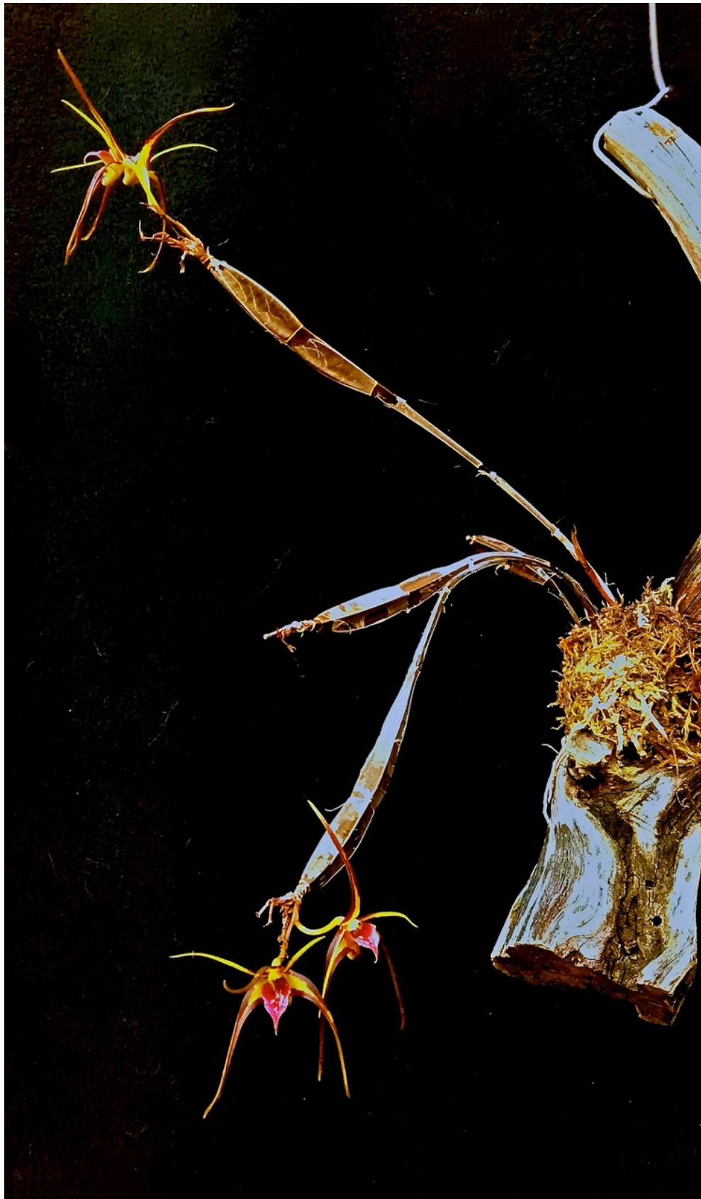
Dendrobium tetragonum from Southeast Australia grown by Lynn Wiand It blooms every year on my patio, but never grows any leaves! Would it perhaps be happier in a greenhouse?