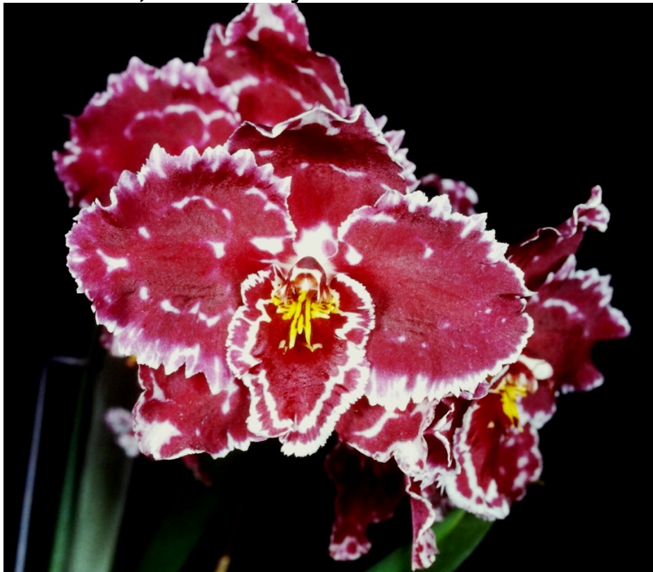
Odontioda Bogota 'San Bar Flame' HCC/AOS, Awarded at Long Beach, March 24 1980, exhibited by Santa Barbara Orchid Estate