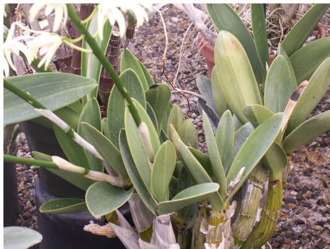
Variety capricornicum is one of the smaller varieties of Den. speciosum. Though the flowers look much the same, this variety is characterized by its small leaves. grown by Russ Nichols