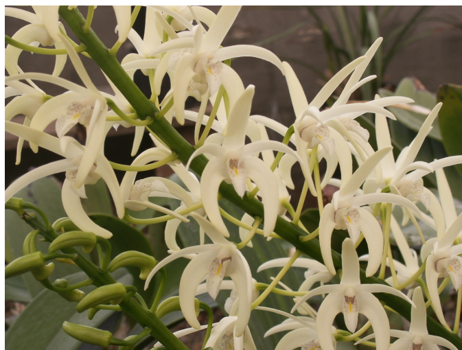
Dendrobium speciosum var. capricornicum 'Southern Cross' Consistently the first to bloom, grown by Russ Nichols