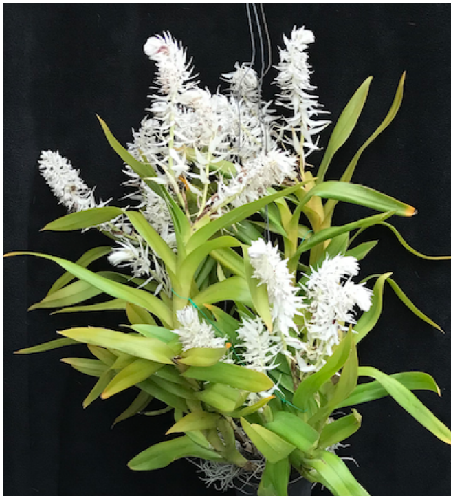
ERIA vanoverberghii (Brazil) Has 2 to 4 spikes at end of each growth...large plant in 5 inch pot, grown by Lynn Wiand