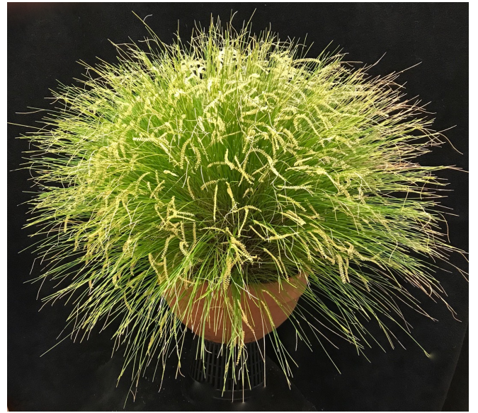
DENDROCHILUM tenellum (Philippines) grown hanging in NZ sphagnum moss in an 8 inch wide clay bowl. Always blooms in January-February - fragrant, grown by Lynn Wiand