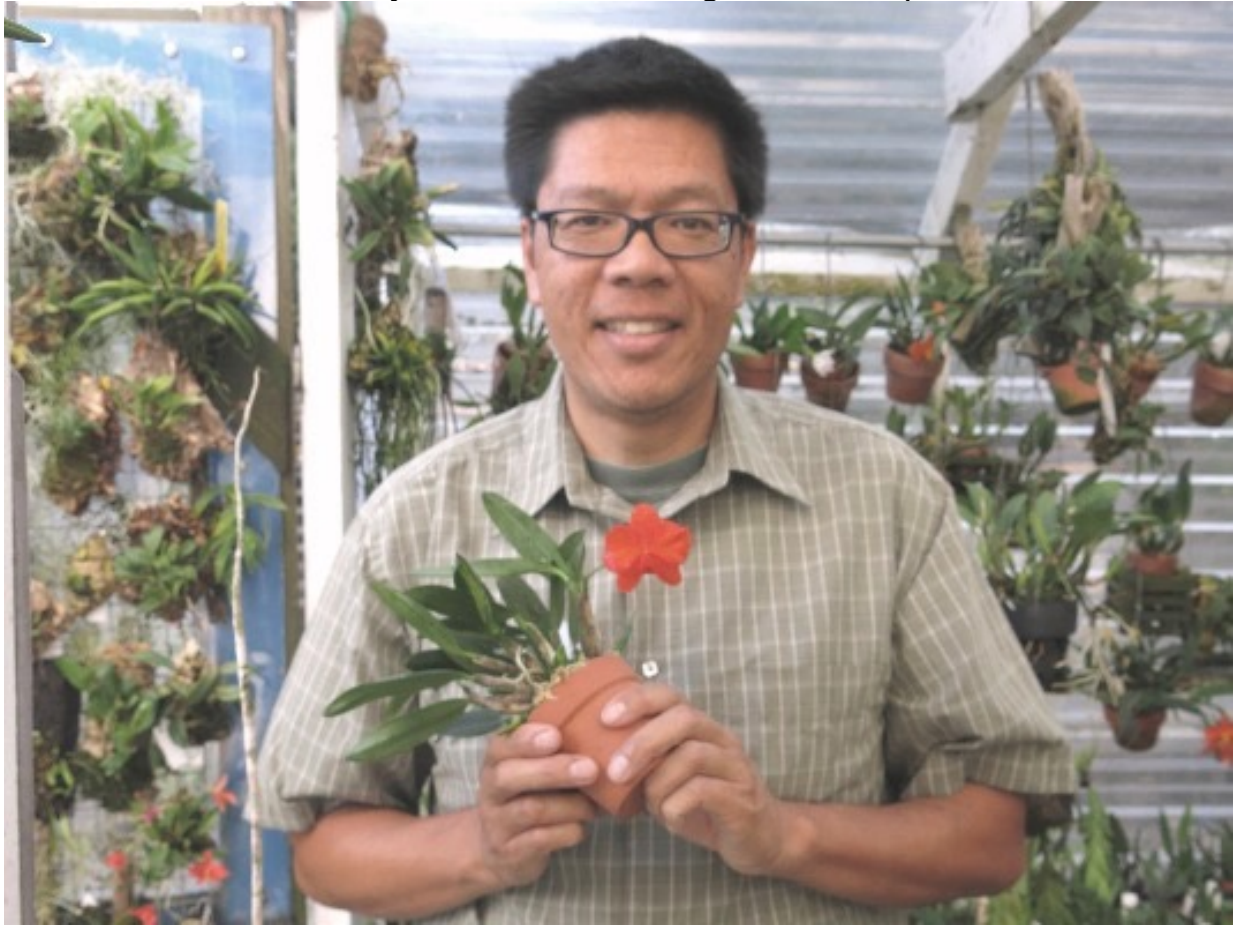
January Meeting Photos Thanks to Mong Noiboonsook for the excellent pictures.