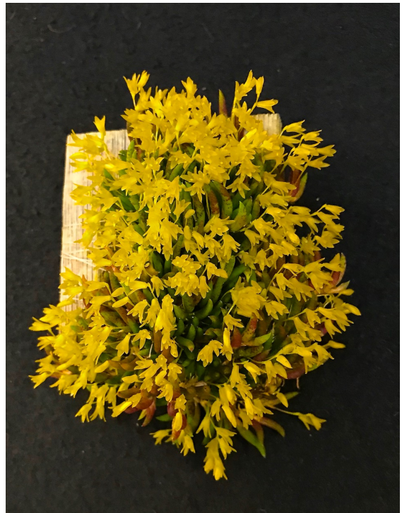
PLEUROTHALLIS leptotifolia (Brazil) tiny flowers that really smell bad...mounted on a 4 inch piece of bark, grown by Lynn Wiand