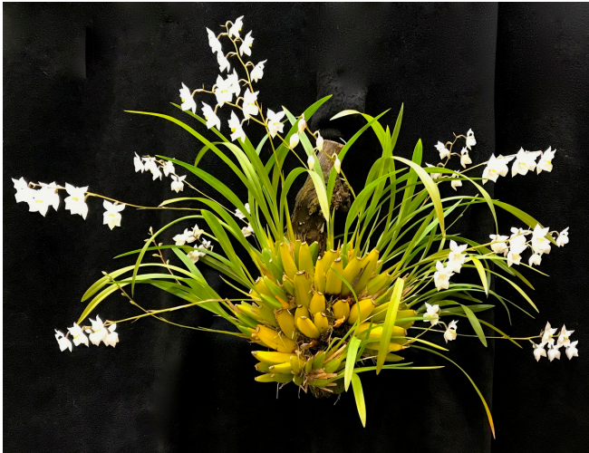
OSMOGLOSSUM pulchellum (Mexico) mounted on a 6 inch vertical hanging piece of tree branch nicely fragrant, grown by Lynn Wiand