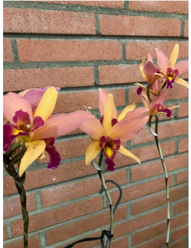
Laelia Santa Barbara Sunset 'Showtime'