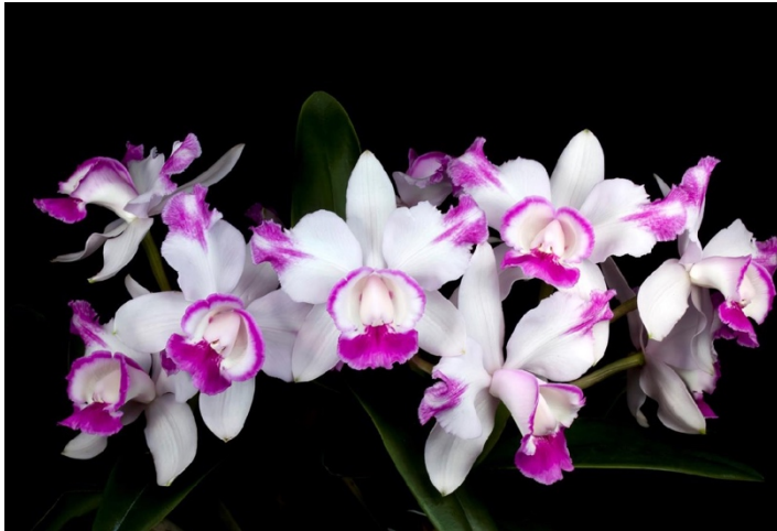
Above: Cattleya intermedia Aquinii Orlata 'Arnie's Best' AM/AOS (86 pts) awarded March 7, 2023 in San Diego.