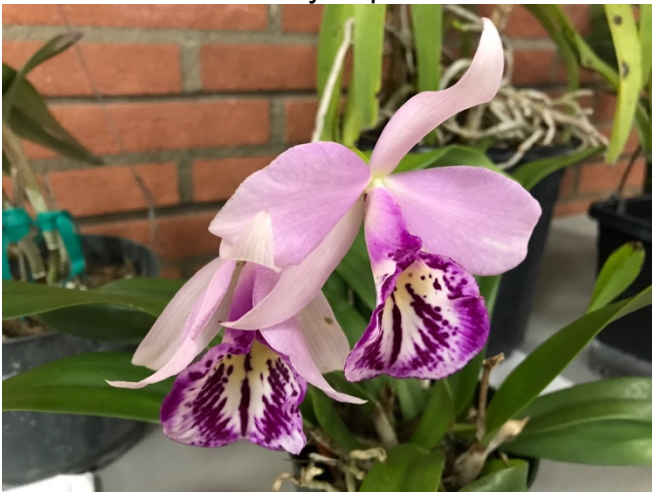
Bc Taiwan Big Lip Ta-Hsin Exhibited by Una Yeh