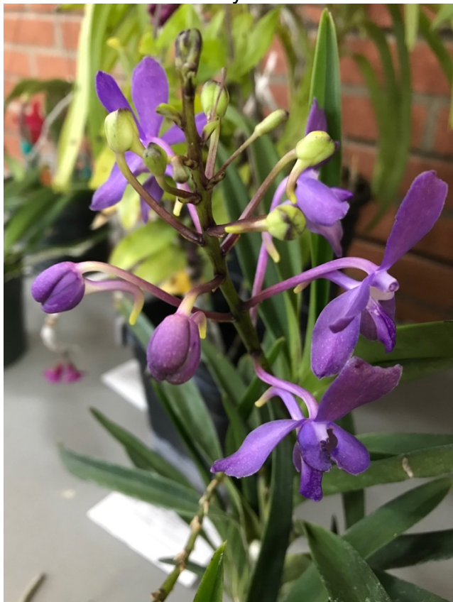
Darwinara Charm 'Blue Palifu' Exhibited by Una Yeh