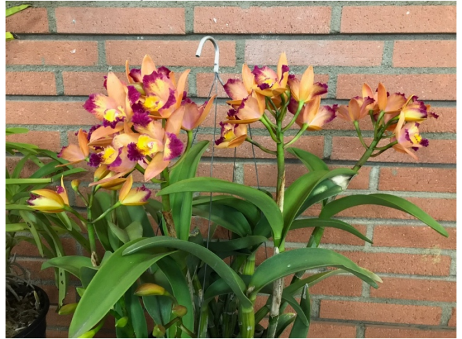
Lc. Straight Answer No Question Exhibited by Una Yeh