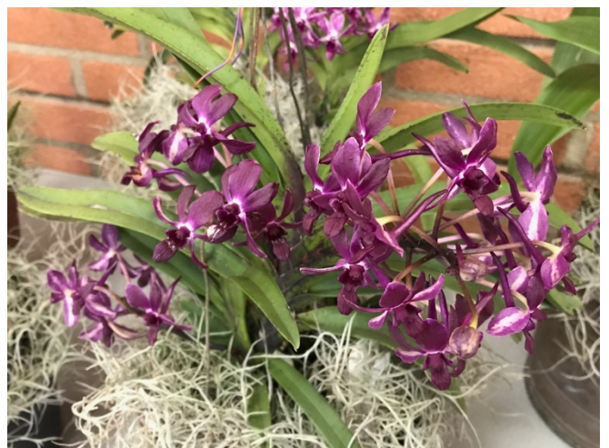
Neostylis Pinky 'Dark Purple' Exhibited by Espie Quinn