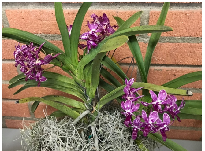
Neostylis Pinky 'Spotted Purple' Exhibited by Espie Quinn