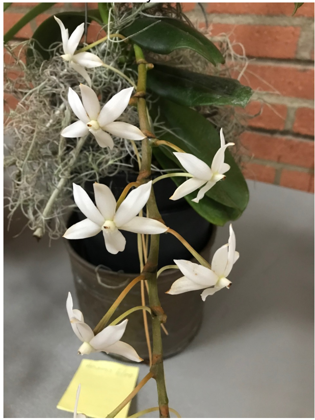
Aerangis Elro Exhibited by Espie Quinn