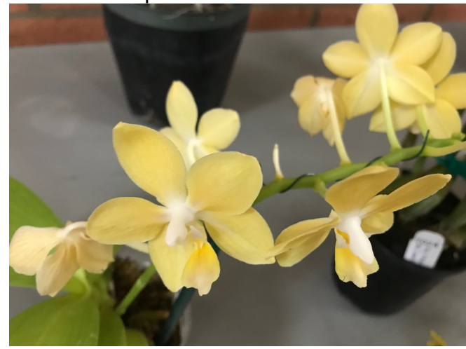
Phal. Mini Lemon Drops 'Sweetheart' Exhibited by Una Yeh