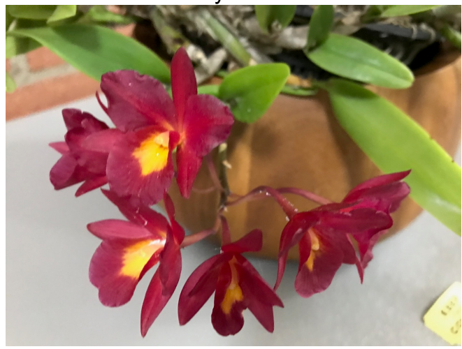
Ctna. Why Not 'Summer in Montego' Exhibited by Mong Noiboonsook