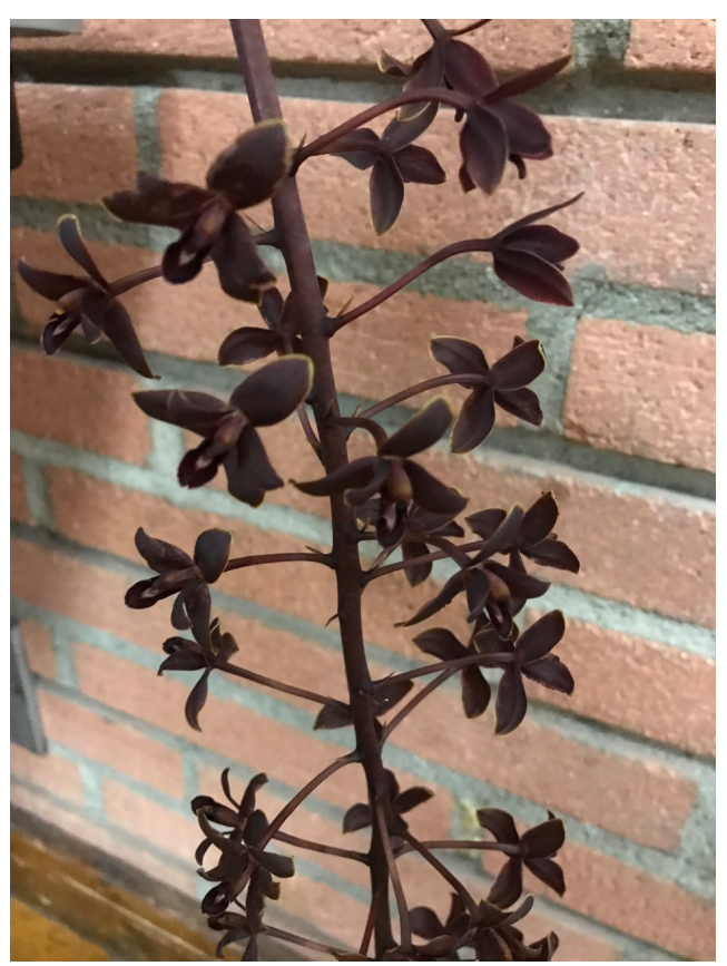
Cym. Little Black Sambo 'Black Magic' Exhibited by Una Yeh