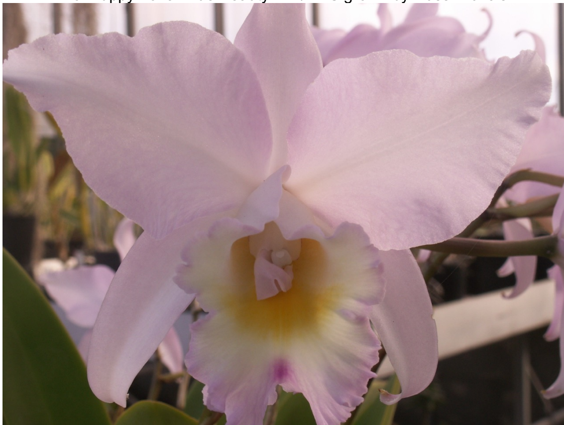
Best bloom in 30 years since purchase at Stewart's in Culver City.