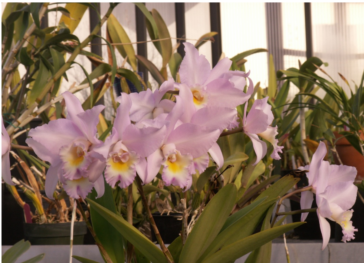
Lc. Puppy Love 'True Beauty' AM/RHS grown by Russ Nichols