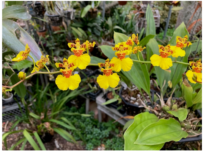
Oncidesa Gower Ramsey at Trader Joe's