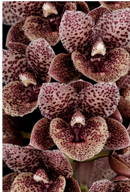
Fred Clarkeara Doubtless 'Sunset Valley Orchids' AM/AOS 12/23