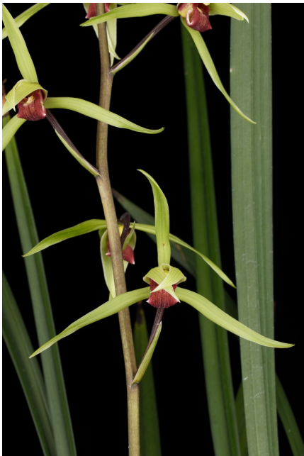
Cym. kanran 'Xue Zhong Hong' AM/AOS 12/23