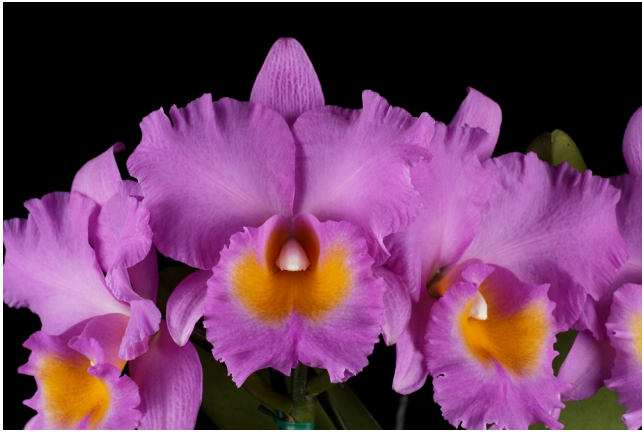
Blc. Ella Mangis 'My Precious' AM/AOS 12/23