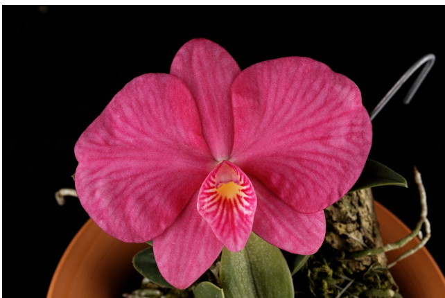
Cattleya (Sophronitis) wittigiana 'Pink Pearl' AM/AOS 12/23