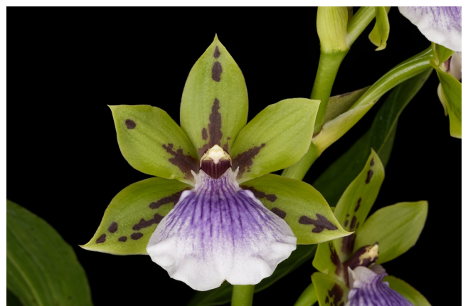
Zygoneria Adelaide Meadows 'Sunset Valley Orchids' AM/AOS 12/23