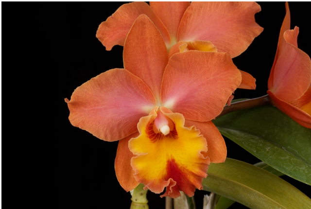
Pot. Beau Sunset 'Fuente' AM/AOS 11/23