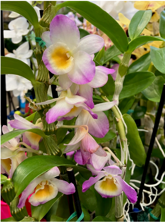
Dendrobium, nobile type, at Lowe's