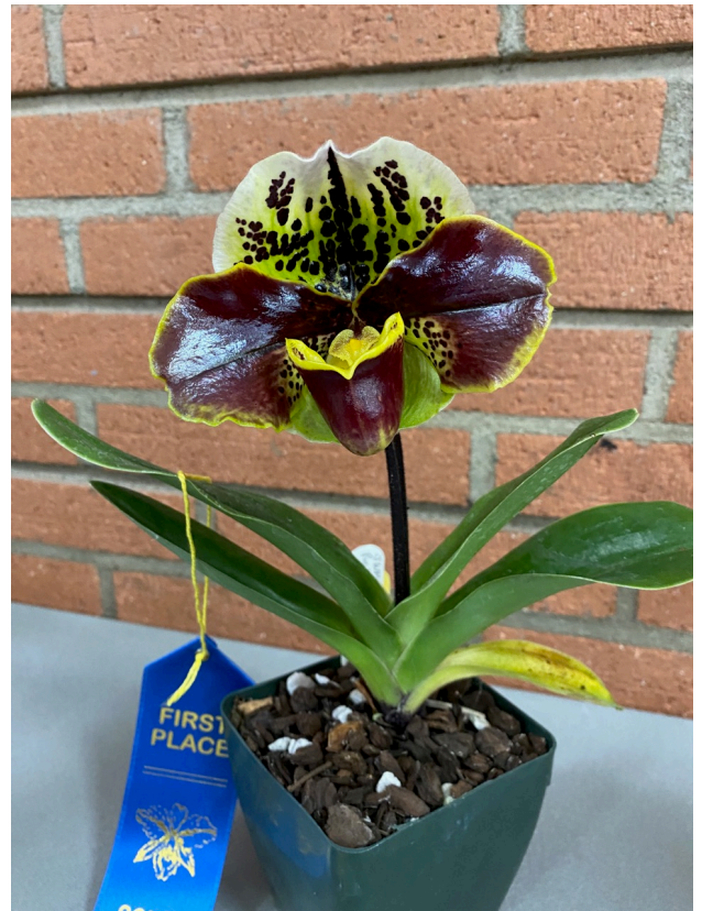
Paph. (Mesmerized x Tiger Top)