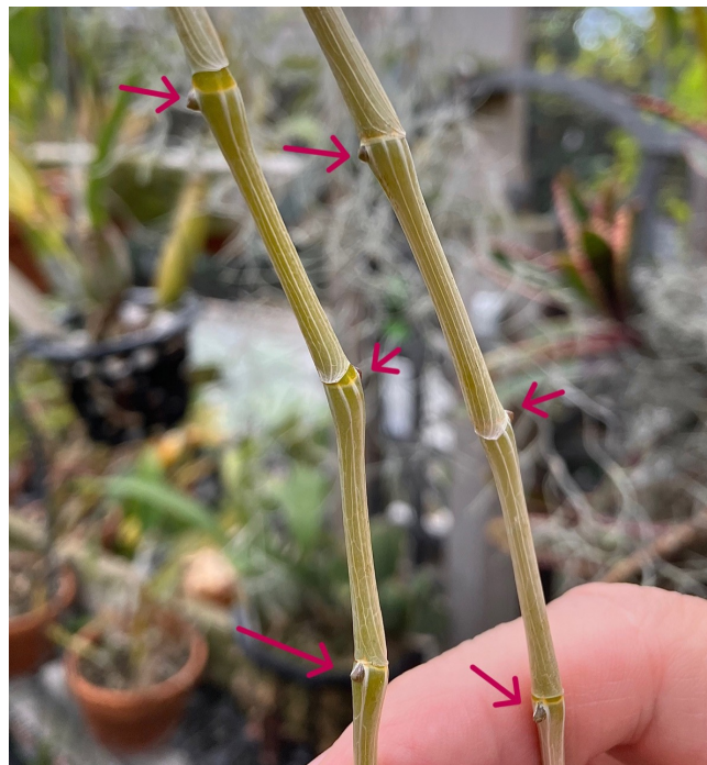
Dendrobium aphyllum buds