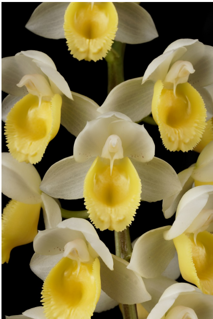
Ctsm. Memoria Dorothy Wells 'Sunset Valley Orchids' AM/AOS 12/23