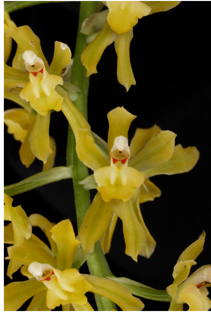
Gomesa recurva 'JWB's Surprise' HCC/AOS 12/23