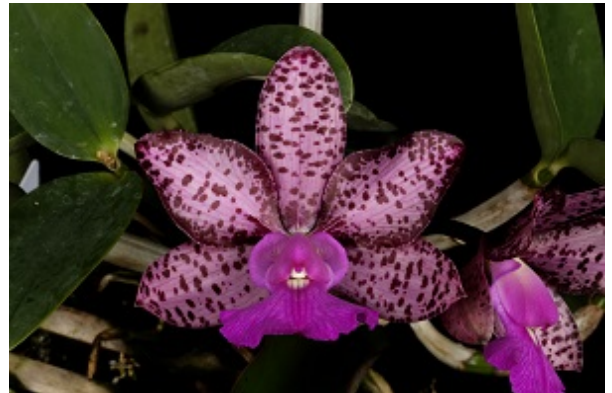
Cattleya Measureseiana 'Bravo Orchids' AM/AOS 12/23