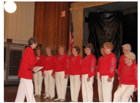
The Choral Bells Entertainment