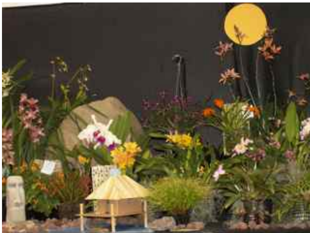
Moon over paradise