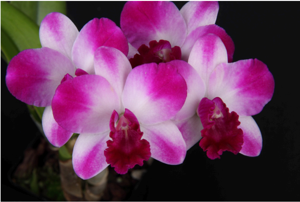
Otr. (Not Registered) 'Diamond Orchids' HCC/AOS (78 pts) (C. Hsinying Excell x Vkt. Fiesta Flare)