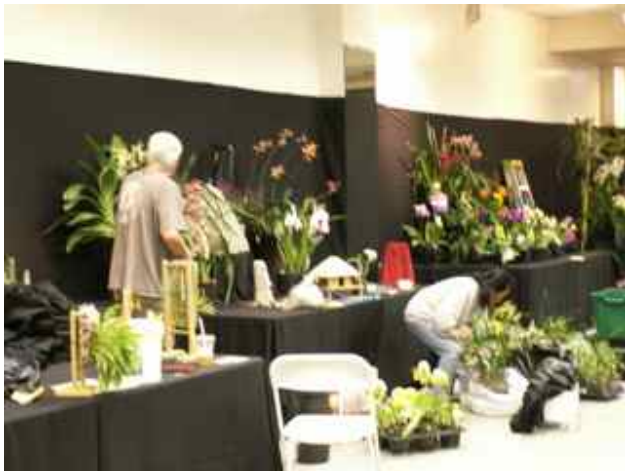
In the beginning, ...