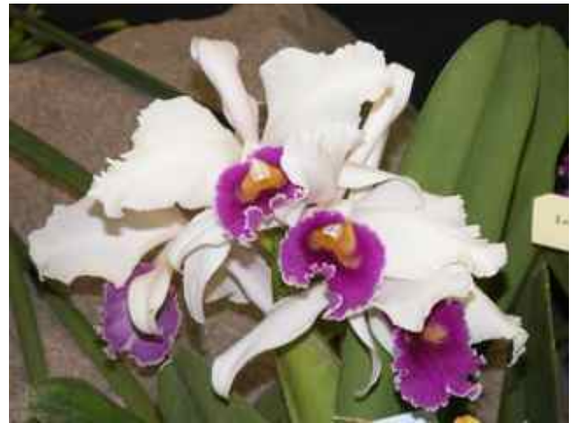
The "hub" of our exhibit