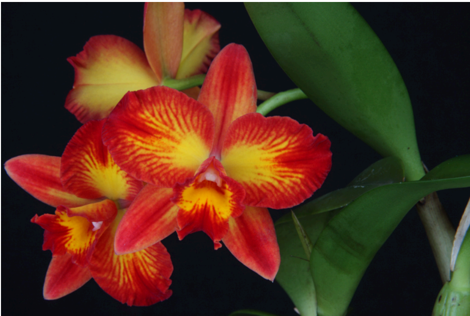
Slc. (Not Registered) 'Diamond Orchids' AM/AOS (82 pts) (C. Pole-star x C. Fire Fantasy)