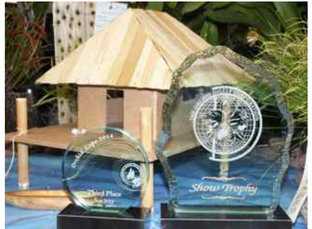
Orchid Digest Show Trophy and NHOS Third Place Society Award