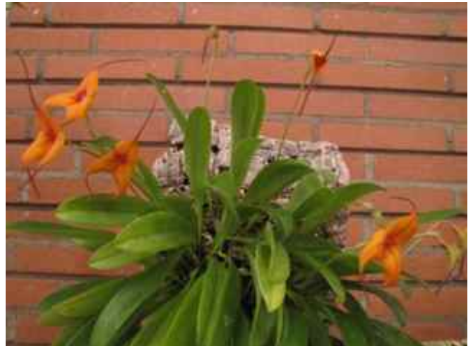
Masdevallia Orange Glow