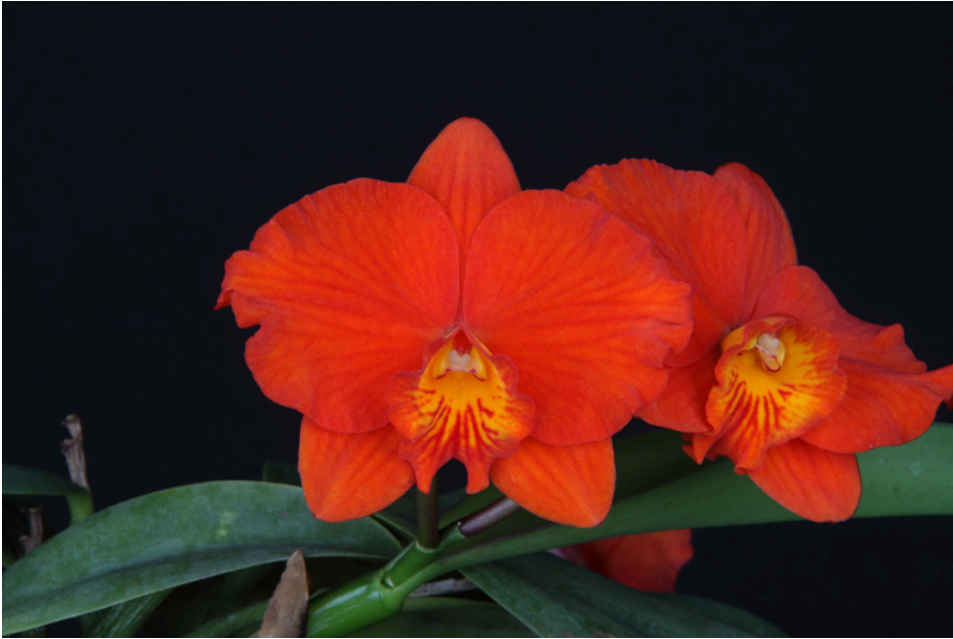
Slc. Seagulls Apricot 'Diamond Orchids' AM/AOS (82 pts)