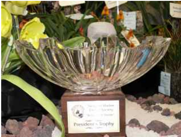
President's Trophy - Best Use of Theme