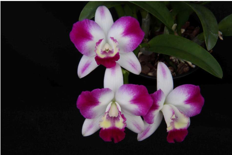
Otr. (Not Registered) 'Elise' HCC/AOS (75 pts) (C. Hsinying Excell x Vkt. Fiesta Flare)