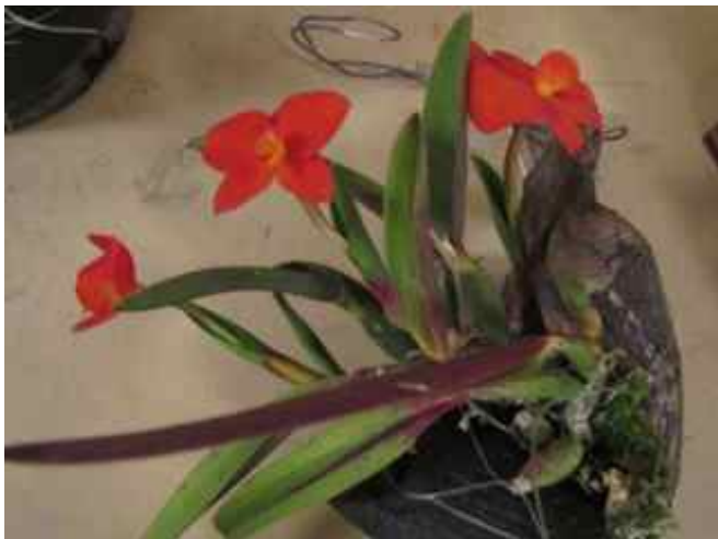
Sophronitis coccinea 4N