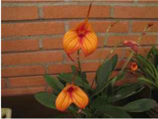
Masdevallia Pat Akehurst 'Golden Zebra'