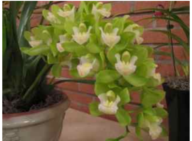
Cymbidium (green mini)