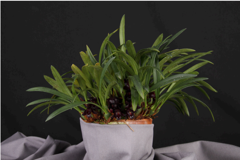
Max. schunkeana Hanging Garden CCM/AOS (84 pts)