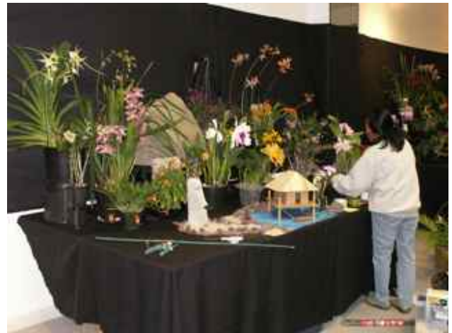
Perfection takes time