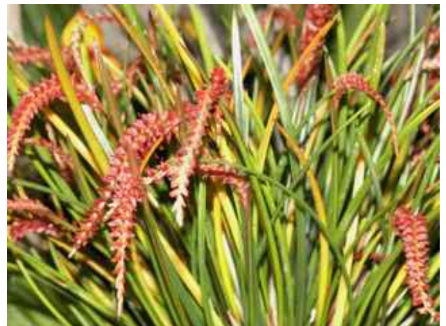
Why can't I grow them like that? ( Dendrochilum wenzelii )