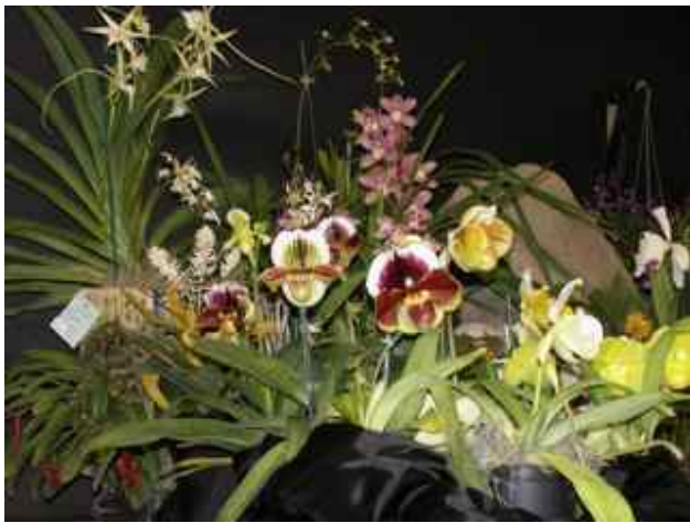
The Paph Corner