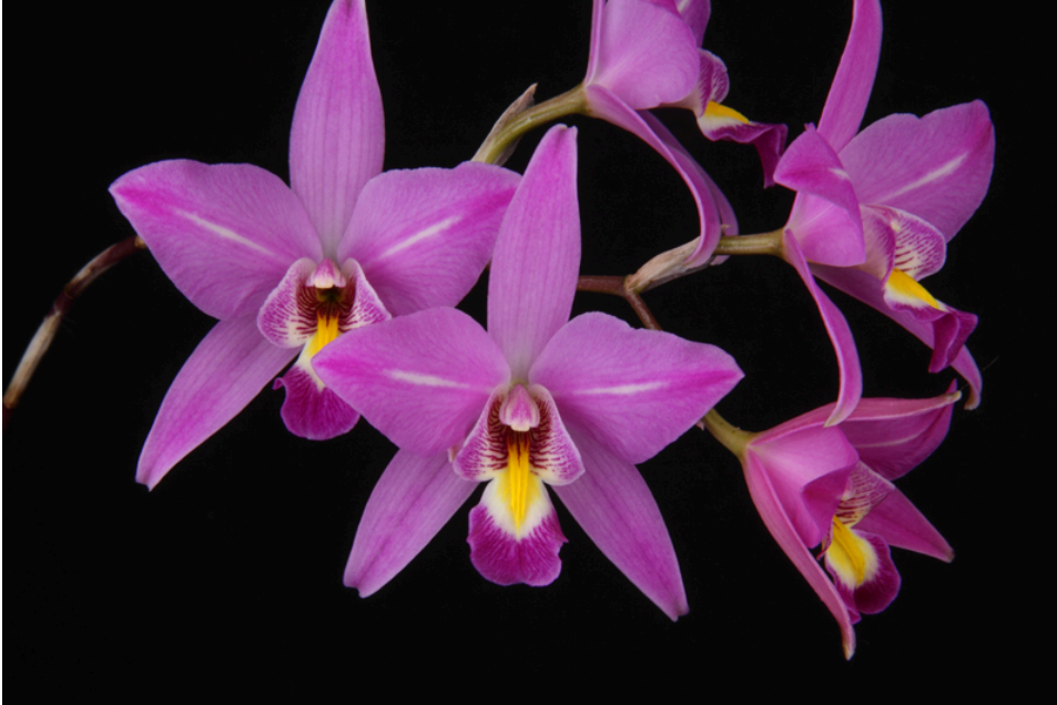
Laelia finckeniana 'Diamond Orchids' AM/AOS (82 pts)