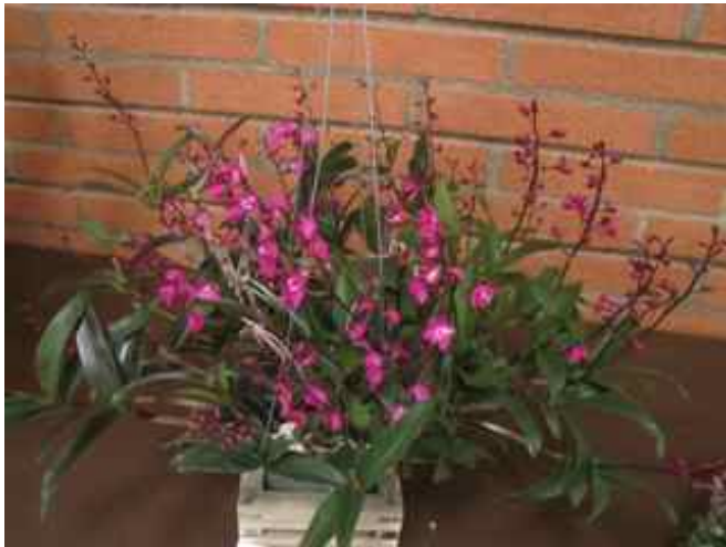
Dendrobium Bright Angel