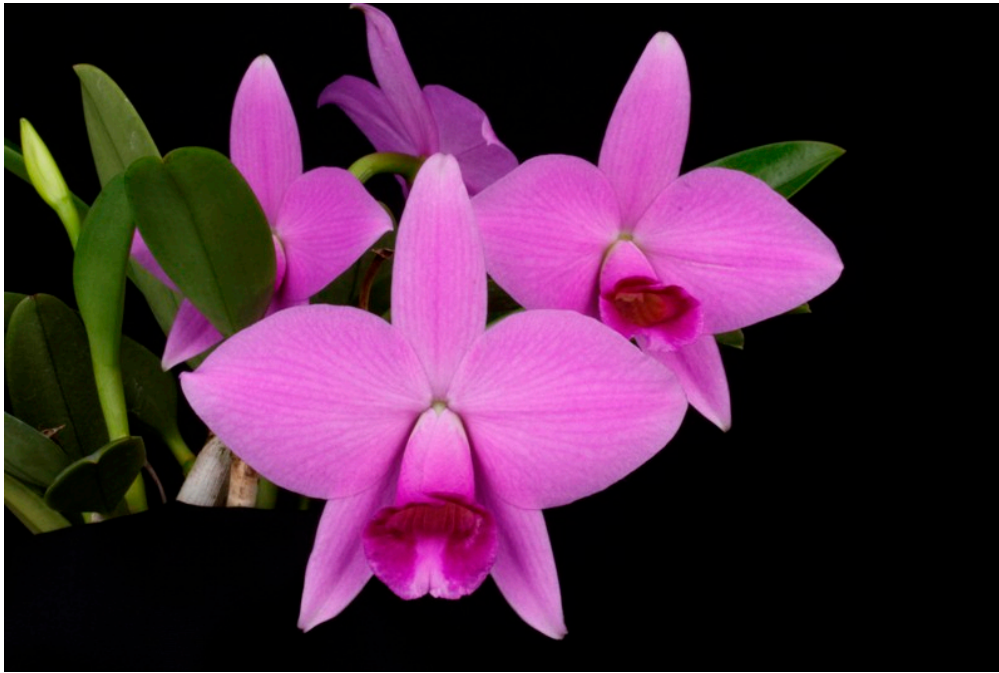
Cattleya praestans 'Brandi'