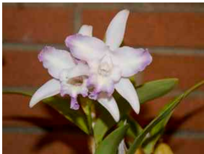
Lc Interceps coerulea