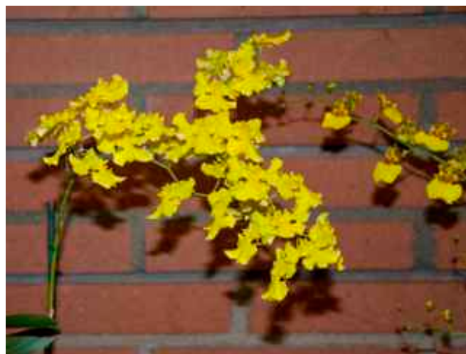
Oncidium Mayfair 'Trinity'