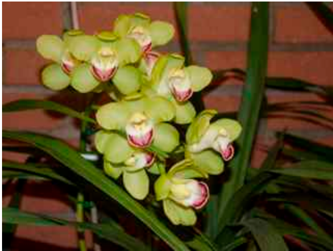
Cym. High Sierra 'Green Glory' x Pure Love