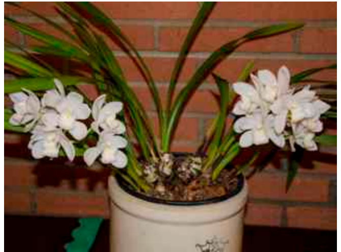
Cym. Sarah Jean 'Ice Cascade'