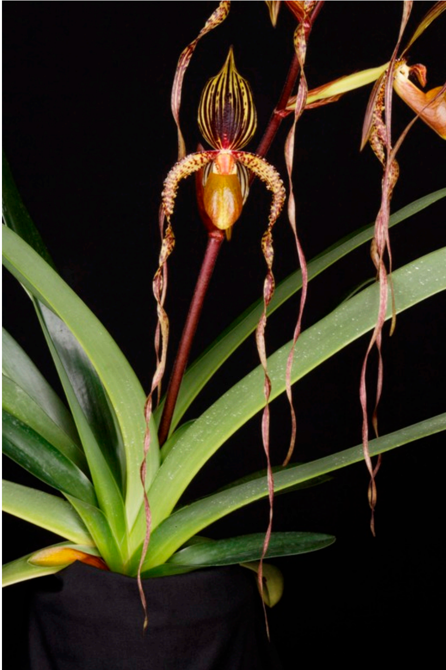
Paphiopedilum Colonel Sanders 'Sunset Valley Orchids'