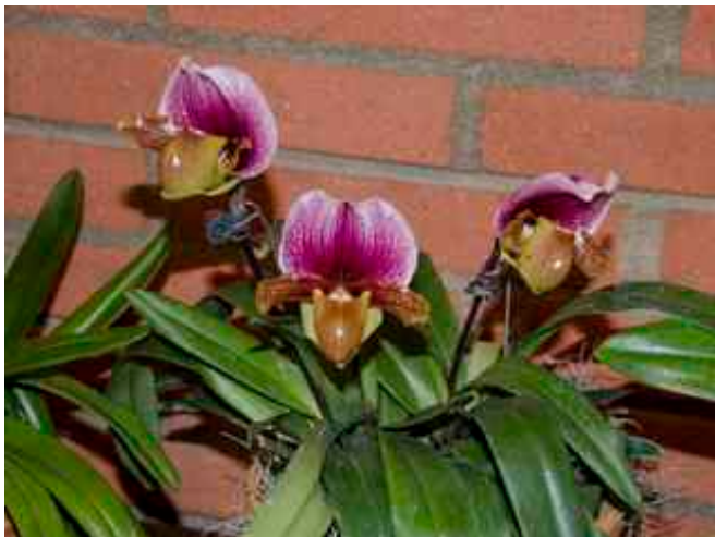
Paph. Wawona Maiden x charlesworthii