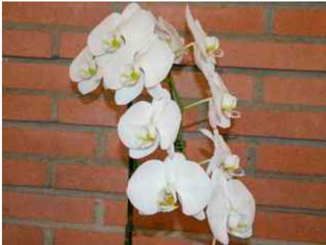
Phal. Sozo Yukidian