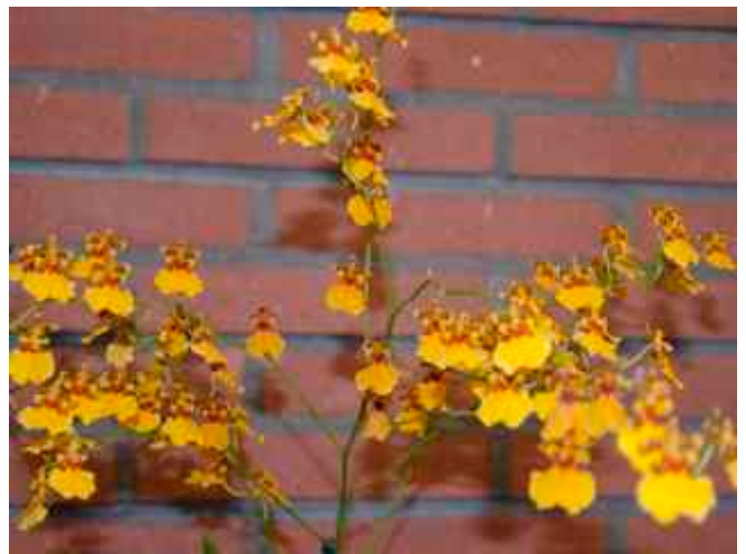
Oncidium Gower Ramsey