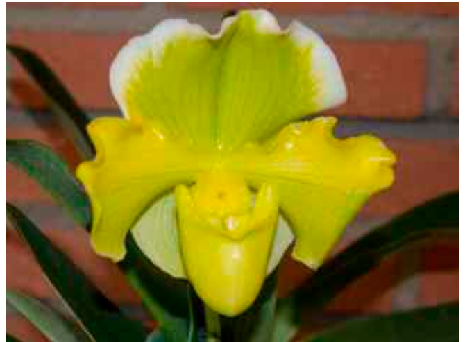
Paph. Coro Beauty