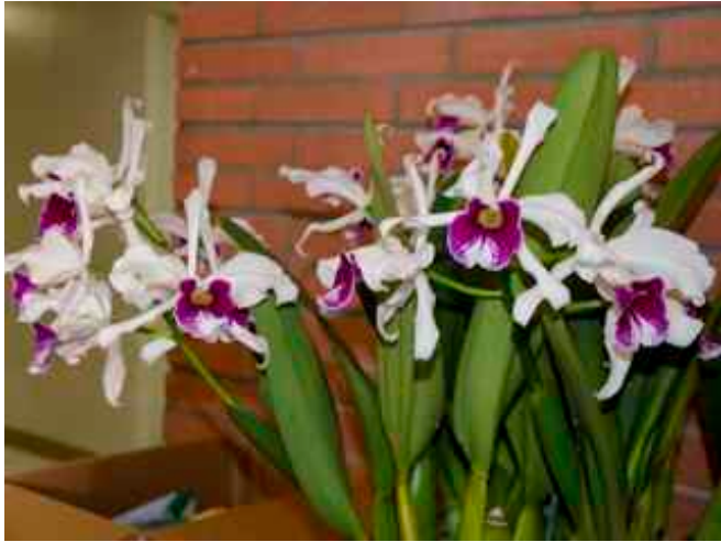
Cattleya (Laelia) purpurata v. semi-alba

Thanks to our members for the wonderful flowers and informative demonstrations.