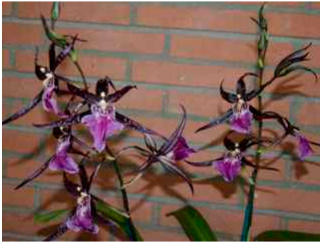
Pacific Bright Star 'Willy Nilly'