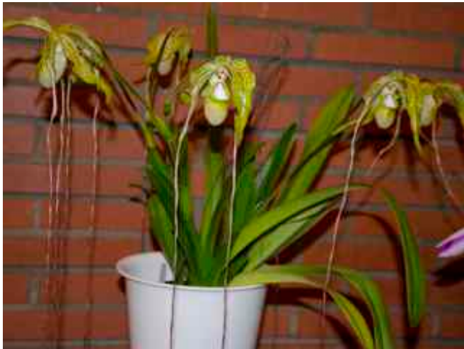
Phrag. Tall Tails