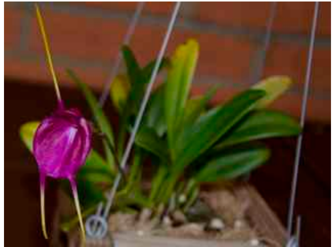
Masdevallia Fuchia Dawn