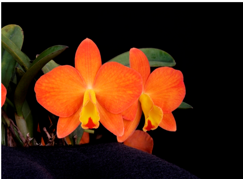
Cattleya N. R. 'Diamond Orchids'