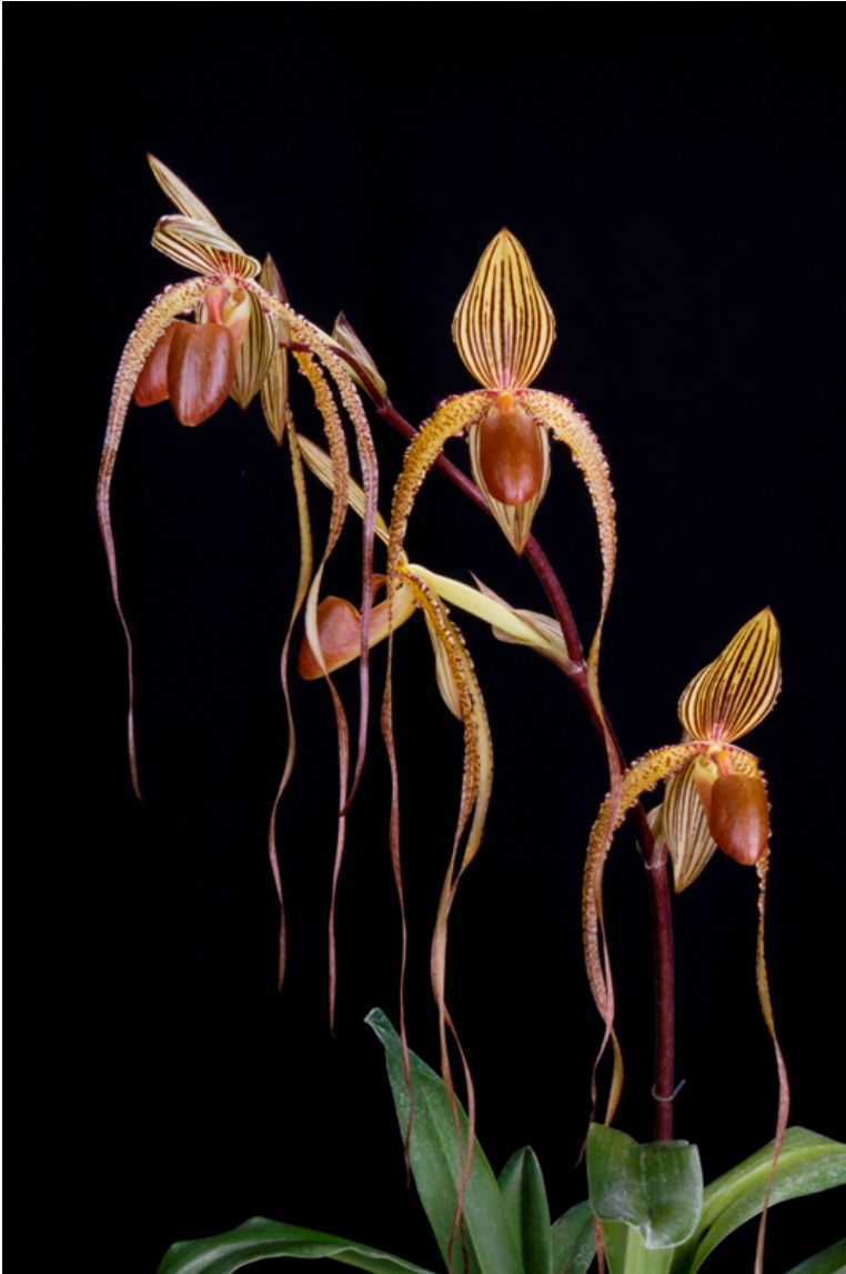
Paphiopedilum Prince Edward of York 'Huntington's Mystery'