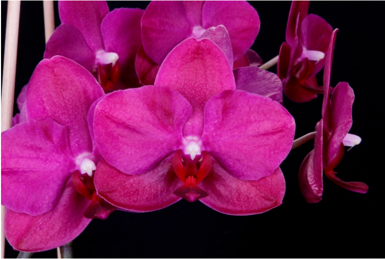
Phalaenopsis San Jacinto Beauty 'San Jacinto'