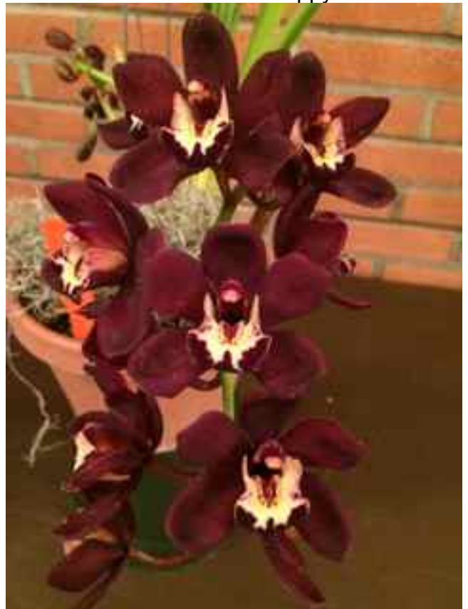
Cymbidium Kiwi Midnight 'Geyerserland'