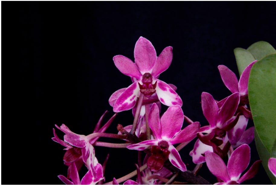
Vandachostylis Pinky 'Magenta Ice'