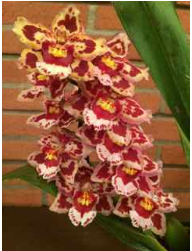
Wilsonara Tan Treasures 'Puppy Pleasure'