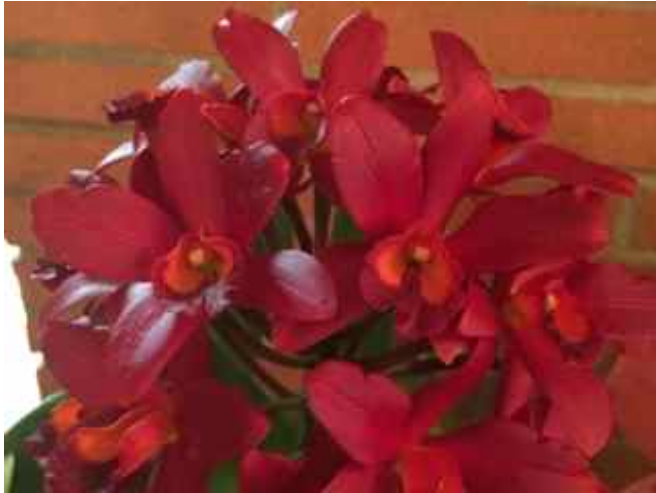
Slc (Lc Koolan Seagulls x Slc Golden Treat)