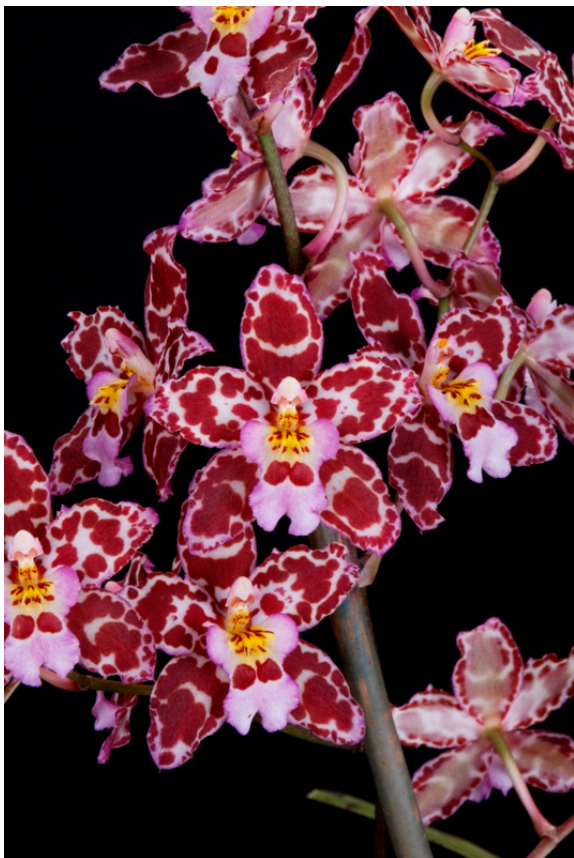
Oncidium N.R. 'Pacific Palisades'