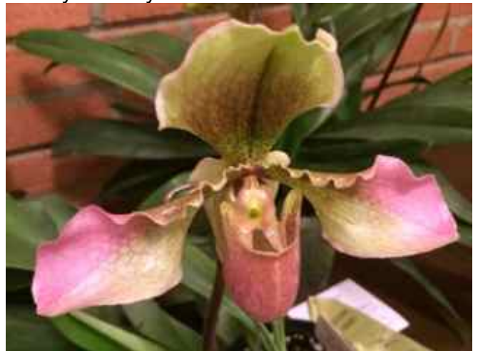
Paphiopedilum Topsy Turvey