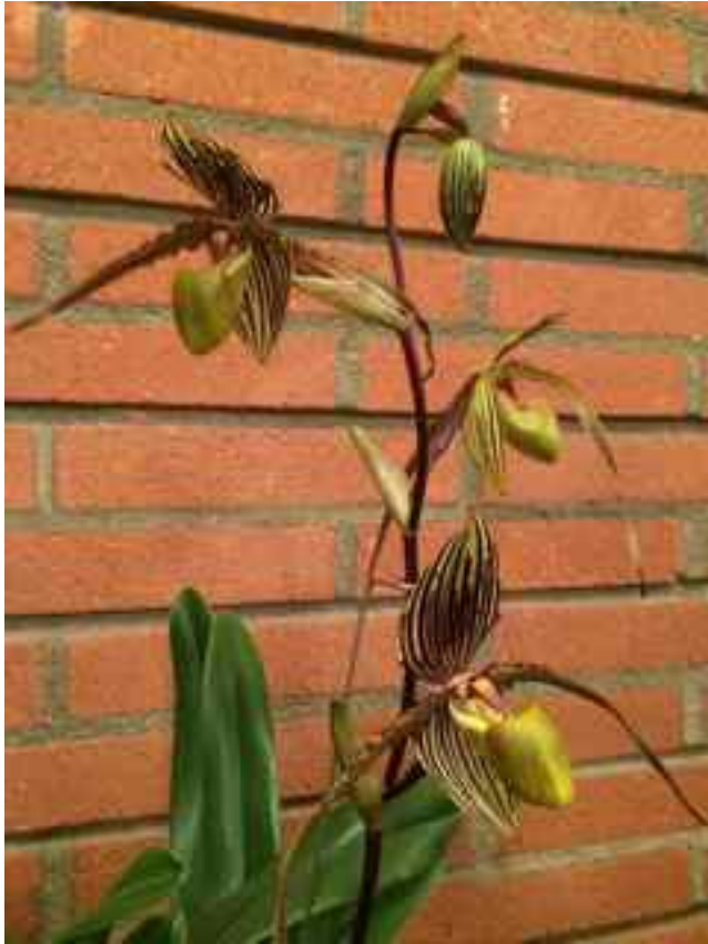
Paphiopedilum St. Swithin