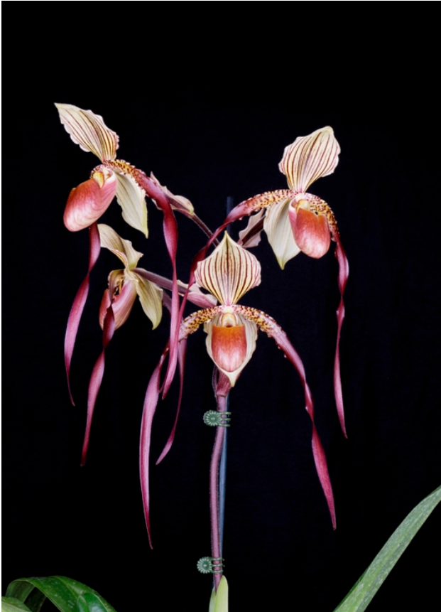
Paphiopedilum Shin-Yi Dragon 'Thornton Fu Manchu'