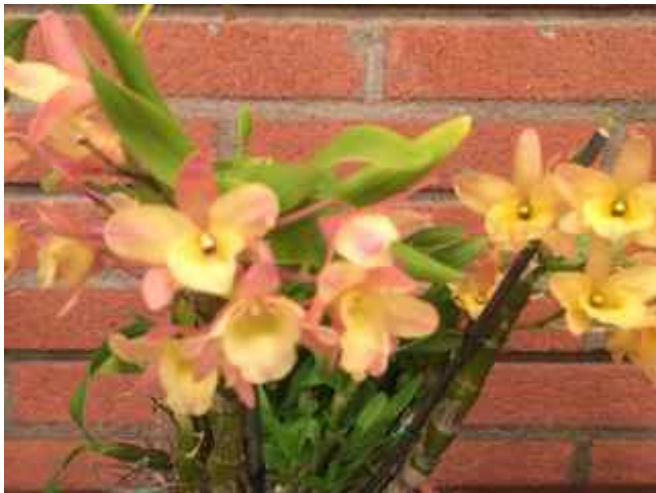
Dendrobium Spring Bird