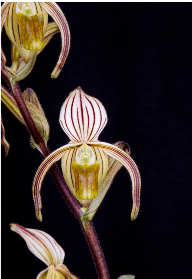
Paphiopedilum randsii 'Huntington's Green Goblin'

Exhibited by Huntington Botanical Gardens