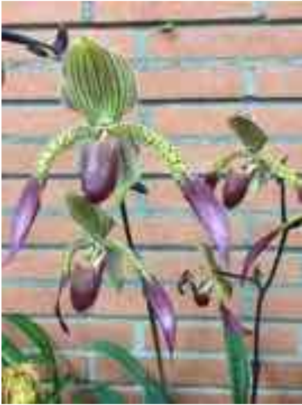
Paphiopedilum Julius #4

Thanks to our members for the wonderful flowers.