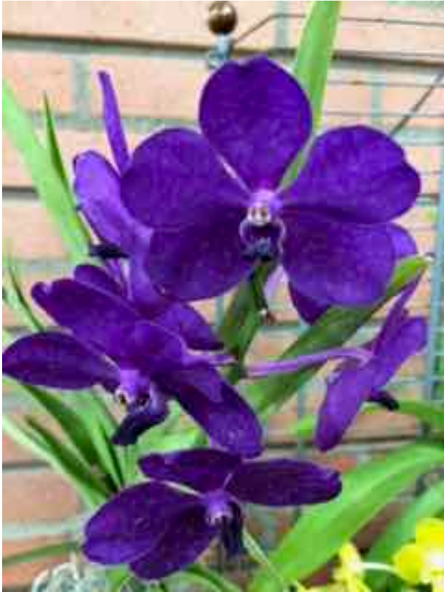
Ascocenda Princess Mikasa