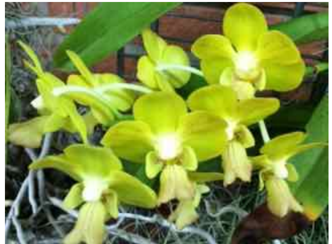
Aeridovanda Photisan x V. Udom Gold