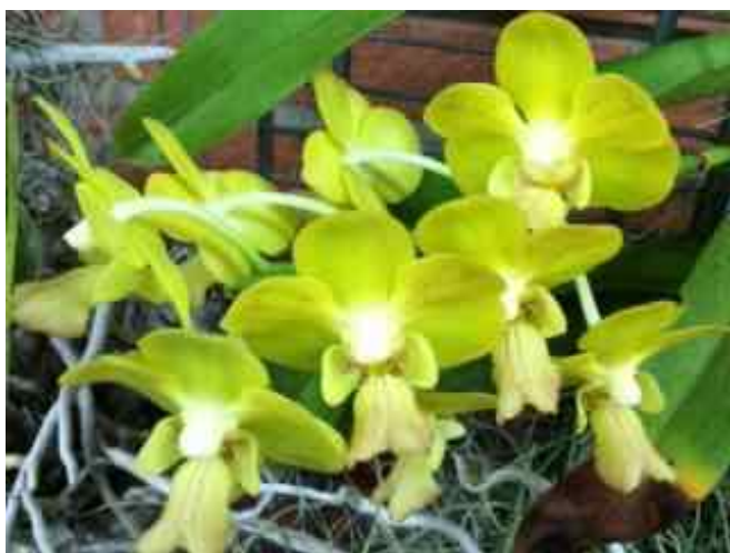
Aeridovanda Photisan x V. Udom Gold