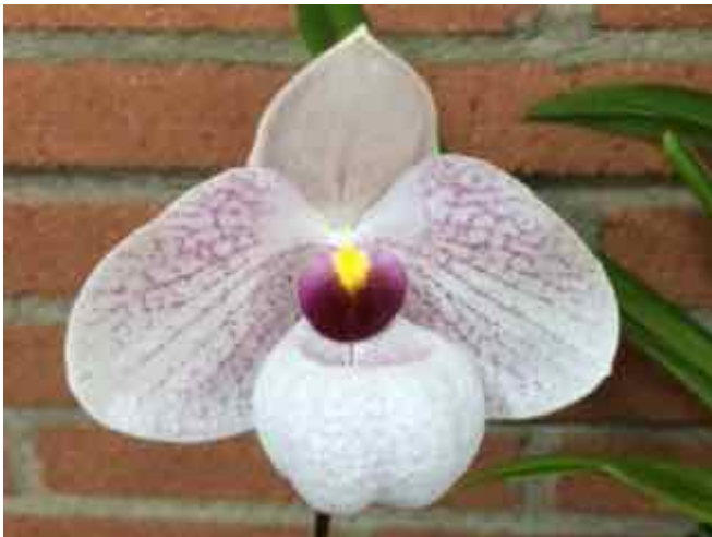
Paphiopedilum Carolyn Butcher