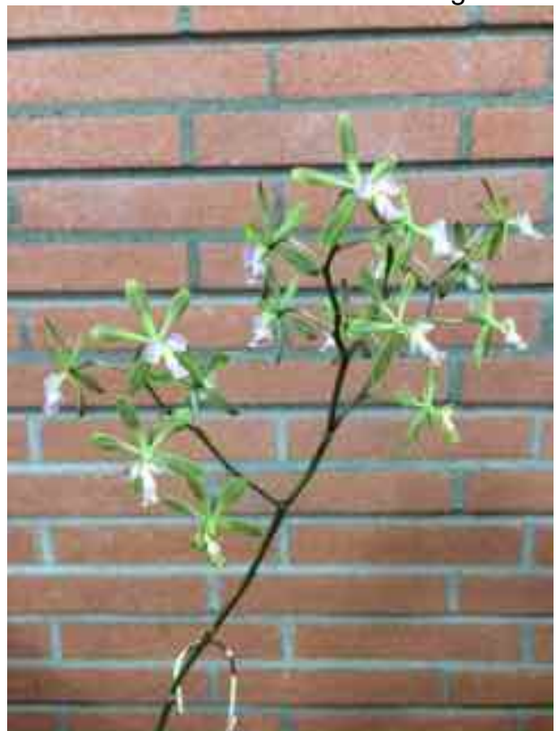
Encyclia (Aberdeen x Mooreanax Alata)