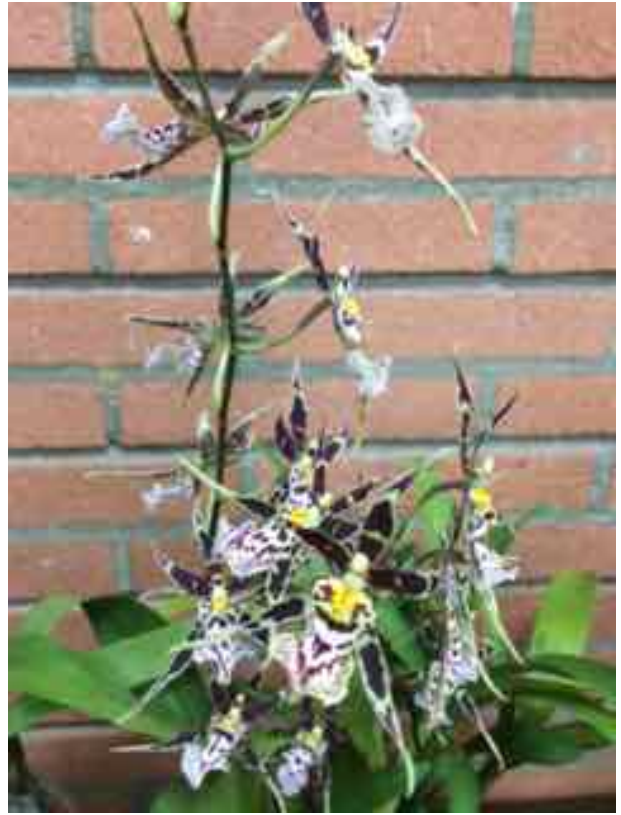
Brscdm Golden Gamine 'White Knight'