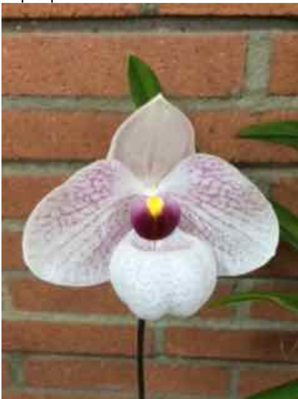
Paphiopedilum Carolyn Butcher