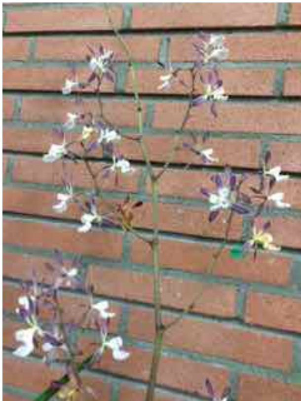
Encyclia (alata 'SVO' AM/AOS x Cashen's Brown Sugar 'Agogo' AM/AOS)