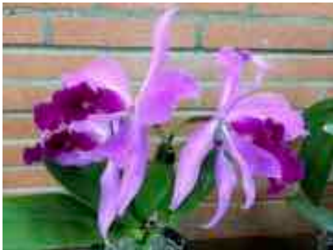
Lc. (C. gaskelliana x L. purpurata)