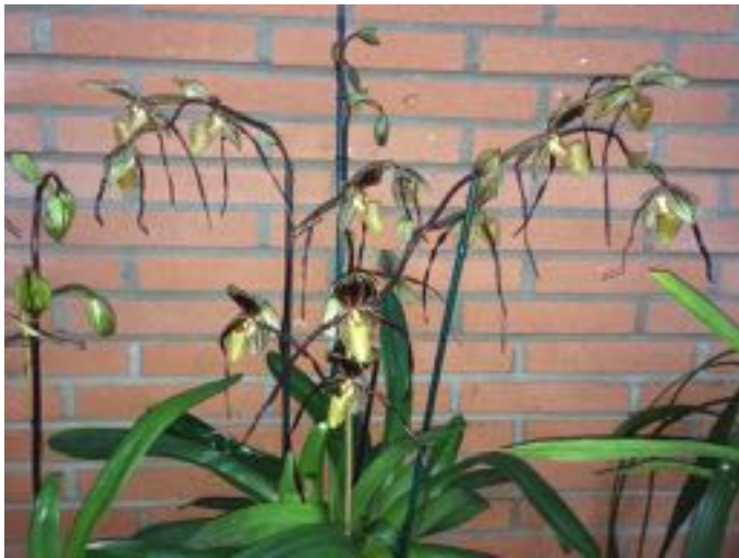
Paph. St. Swithin 'Pine Ridge '87'