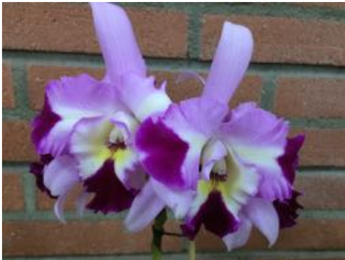
Lc. Miss Wonderful