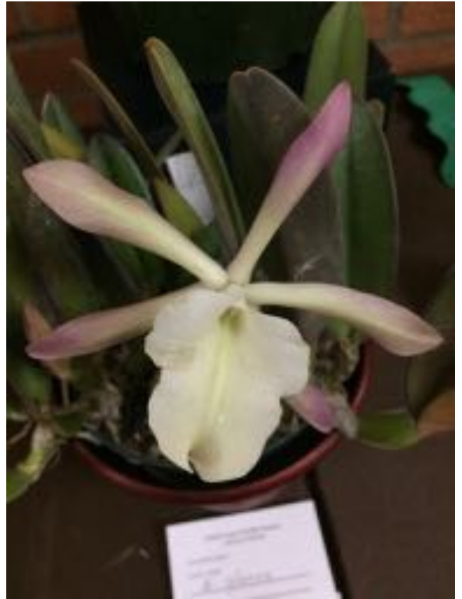
Brassavola (Rhyncholaelia) glauca