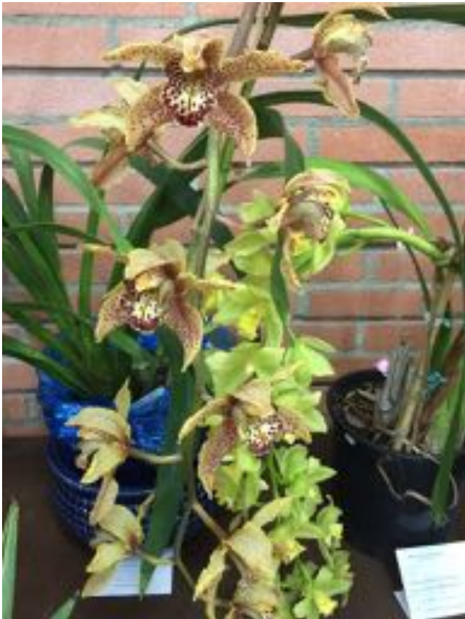
Cym. Casa de Las Orquideas