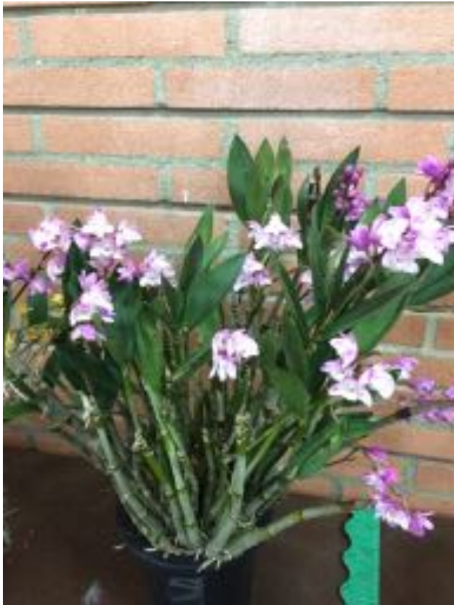
Dendrobium Bardo Rose