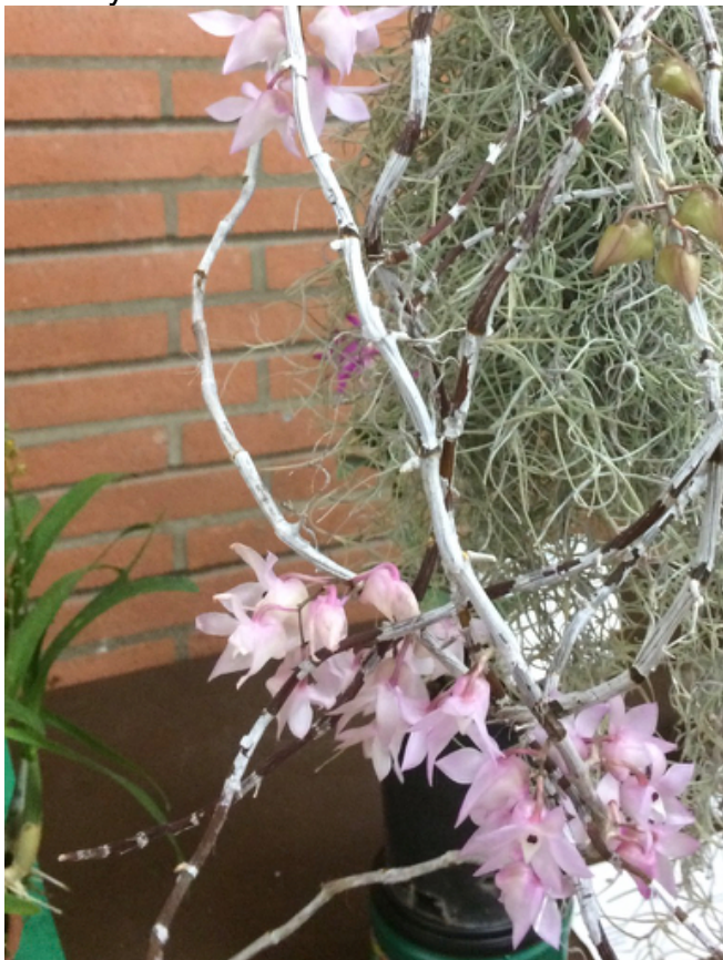
Den. aduncum 'Tan huong Nguyen'