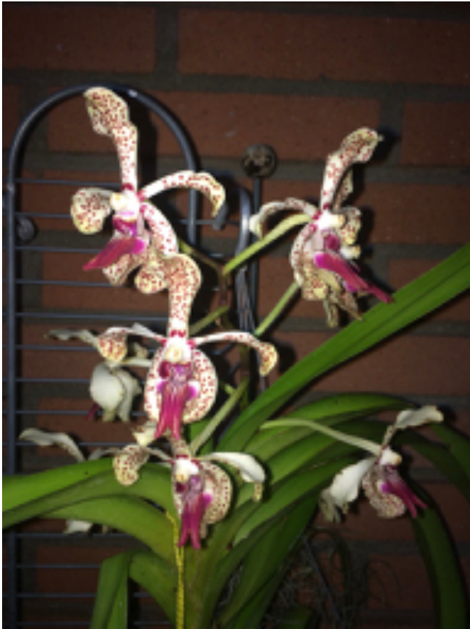
Vanda Kenneth Roberts