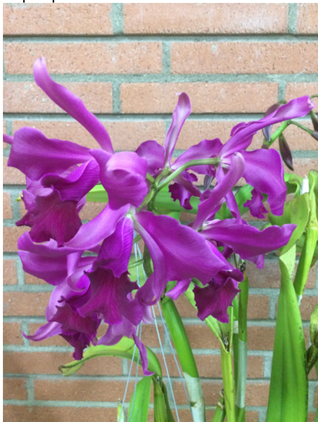
Lc. Elegans (sanguinea strain)