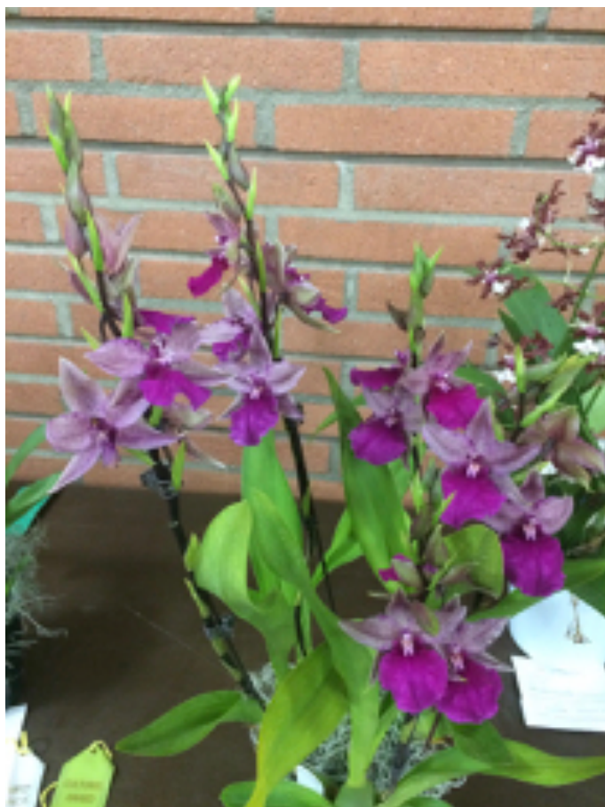
Odontia Pacific Paranoia 'Other Side of Cool'