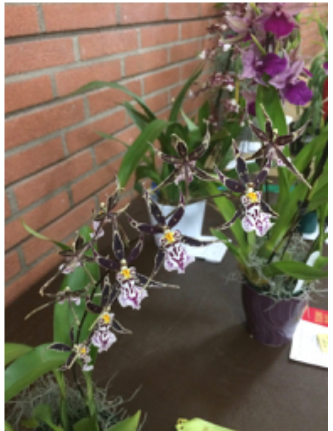
Brsdm. Golden Gamine