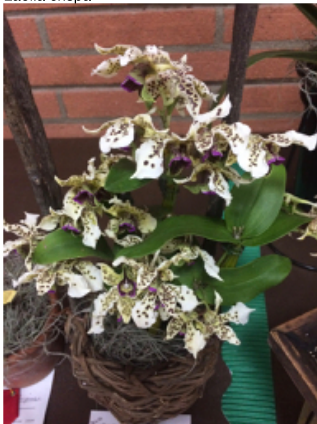
Dendrobium (atroviolaceum x normanbyense)