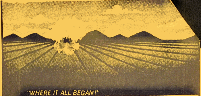
"WHERE IT ALL BEGAN!"

CLARK DAY JR. ORCHIDS 19311 Bloomfield Ave Cerritos, California (213) 865-8270