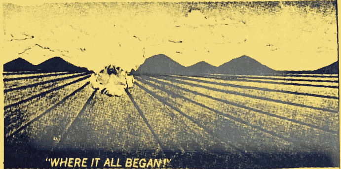
"WHERE IT ALL BEGAN!"

LOOKING AHEAD: STEWART'S WASHINGTON BIRTHDAY SALE - FEBRUARY 18,19,20.