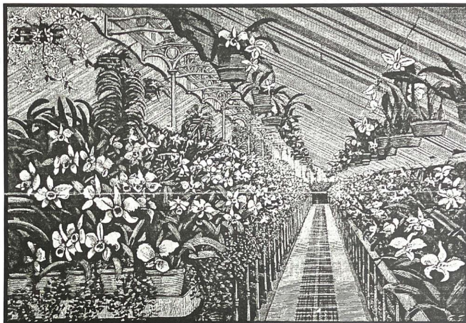
Cattleya House at the Royal Exotic Nursery, King's Road, Chelsea A Manual of Orchidaceous Plants James Veitch & Sons

Phone and fax: 310-318-5640 e-mail: babsorchid@aol.com