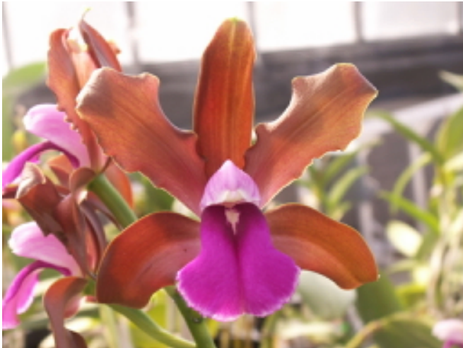
Cattleya bicolor . This example has lighter brown sepals and petals. The sidelobes covering the column are pink and the lip is a solid dark pink.

Although there are at least two distinct varieties of Cattleya bicolor , it is amazing how many differences you will find by growing different cultivars. Here are a few examples of the species, displaying differences one might not expect.