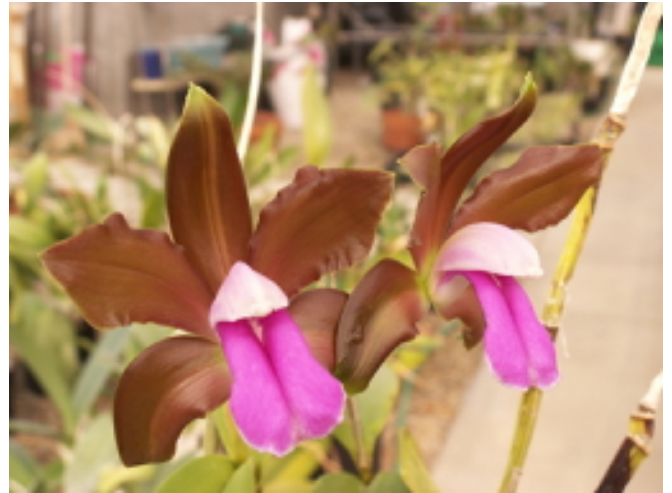
Cattleya bicolor . This bicolor has darker brown sepals and petals, the sidelobes are mostly white, and the lip is a lighter pink. The lip is also more narrow, and the dorsal sepal pointed.