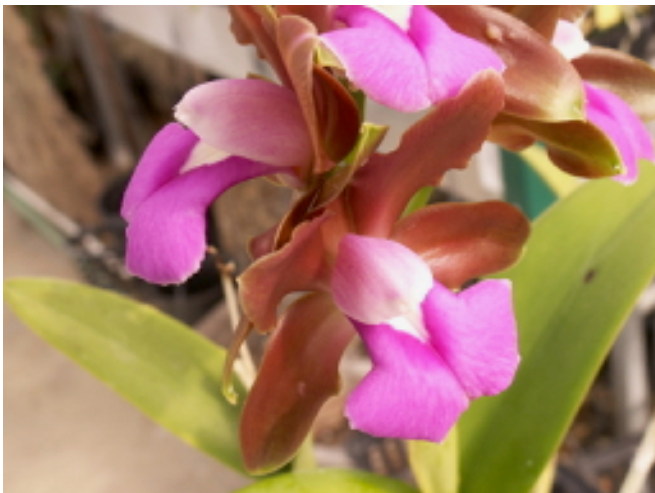
Cattleya bicolor var. braziliensis . The lip is flared at nearly right angles on each side.