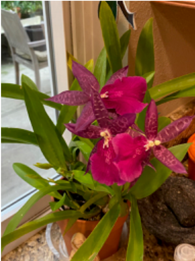
Mtssa. Dark Star 'Darth Vader'