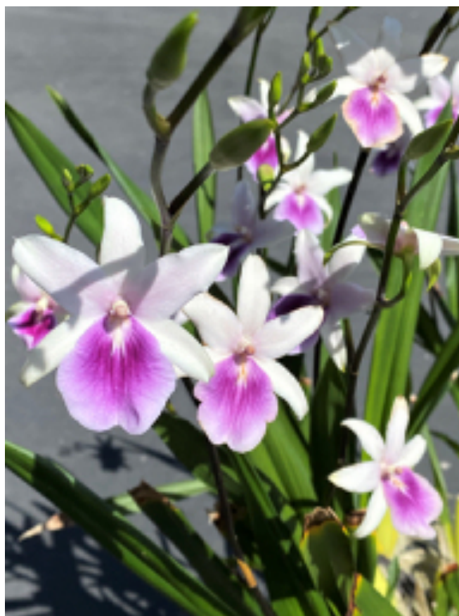
Miltonia regnellii.