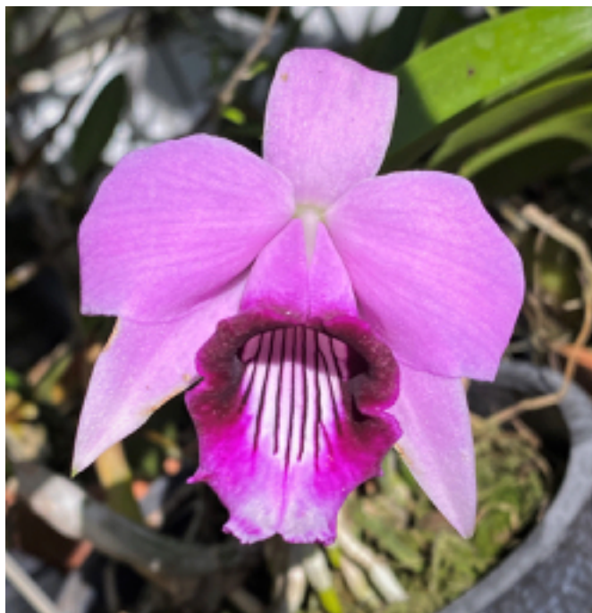
Cattleya (Laelia) dayana v. major.