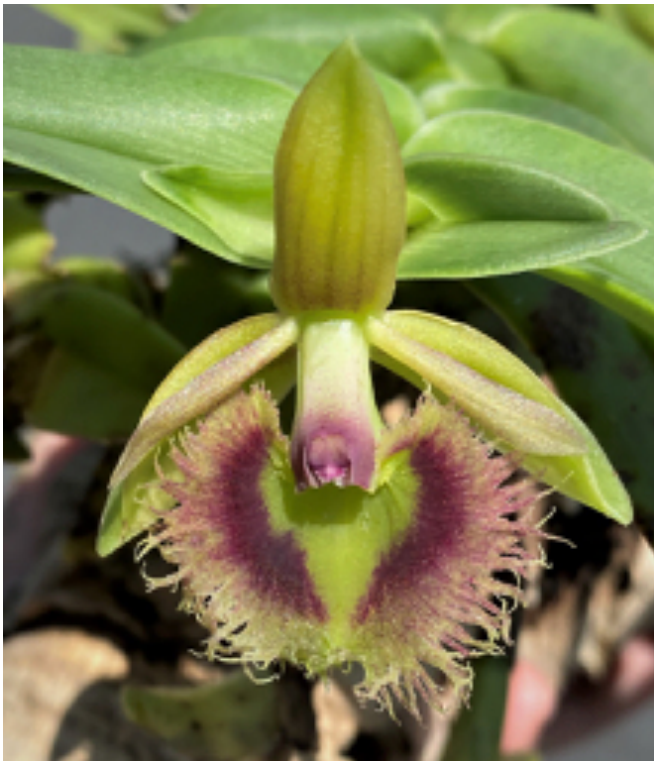
Epidendrum medusae.