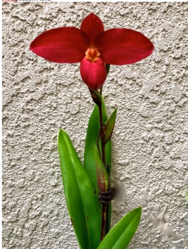
Phrag. Jason Fisher.