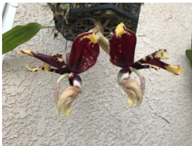
Stanhopia tigrina 'Predator'