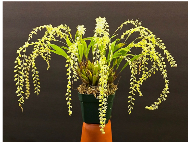
Dendrochilum gracile. Lynn Wiand