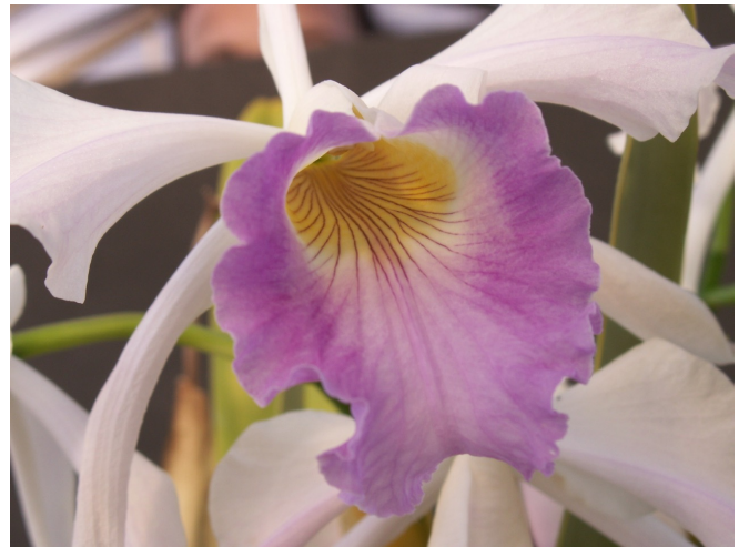
Laelia ( Cattleya) purpurata var. russeliana.