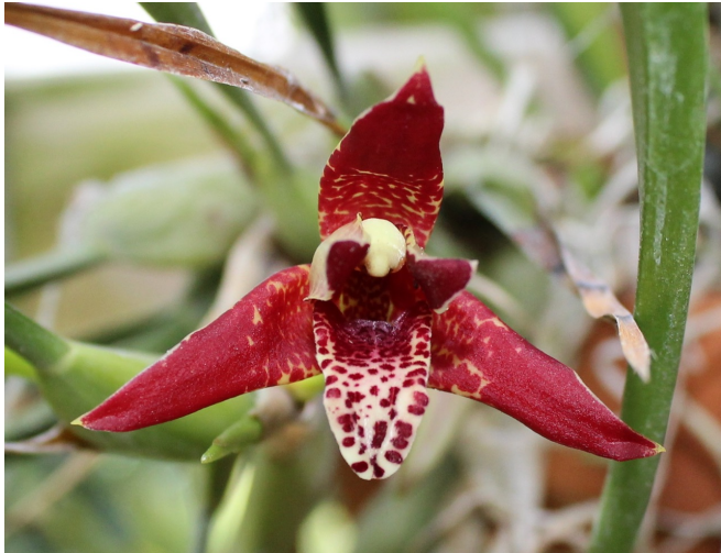
Maxillaria tenuifolia, the coconut orchid.