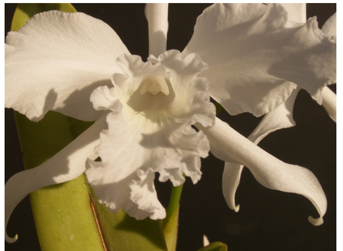
Laelia ( Cattleya) lobata var. alba, acquired at the last NHOS auction (Feb 2020).