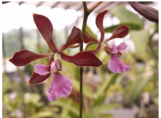
Encyclia hanburyi, a species from Mexico and Guatemala.