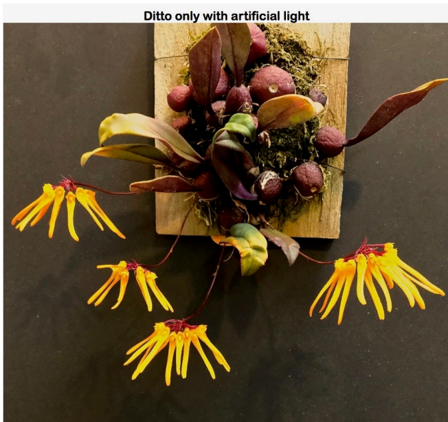
Cirrhopetalum (Bulbophyllum) thalorum , a Vietnamese species mounted on a shingle. Lynn Wiand