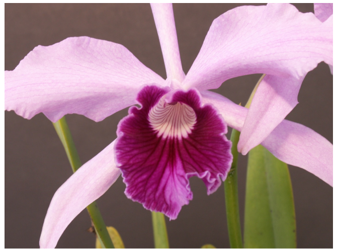
Laelia (Cattleya) purpurata var. vinicolor, another of the many color forms of this celebrated species. Russ Nichols