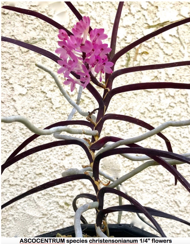
ASCOCENTRUM species christensonianum 1/4" flowers