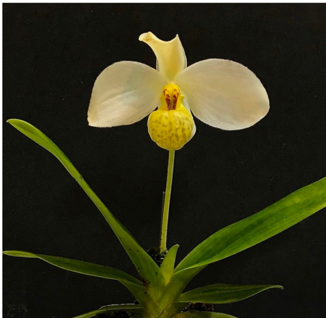
PAPHIOPEDALUM species emersonii (China) in 4" pot in mix