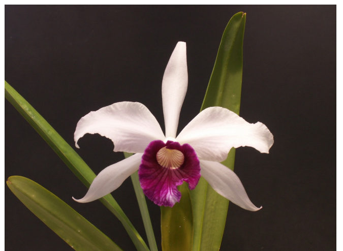
Laelia ( Cattleya ) purpurata (' Cindarosa ' x ' Schusteriana ')