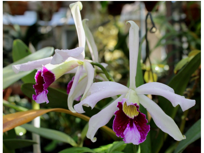
Cattleya (Laelia) purpurata var. aco 'Clito'.