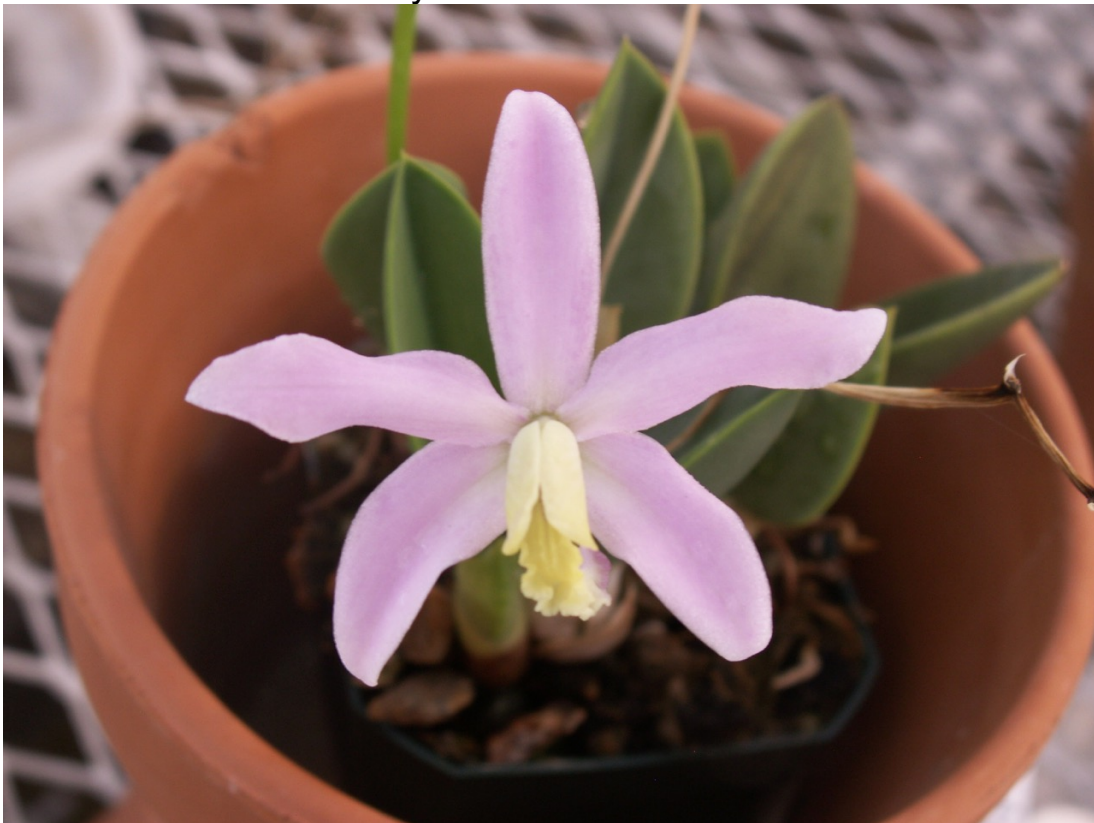
Laelia lucasiana . Herein lies the answer to the question "When is a bicolor not a bicolor?" When it is a Laelia lucasiana , with purple-pink sepals and petals, and a contrasting yellow lip. Russ Nichols