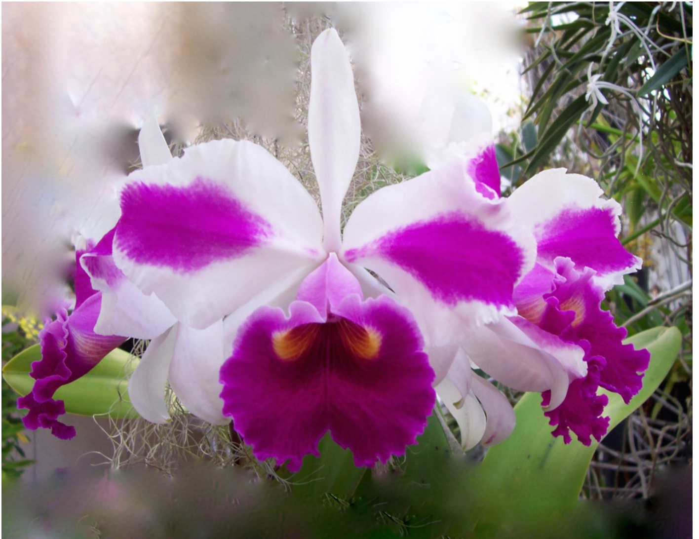
Lc. Remo Prada 'Clown'

One of my favorite cattleys. Wonderful citrus fragrance...usually 4 blooms to a spike (from Ed Wise 2010) Lynn Wiand