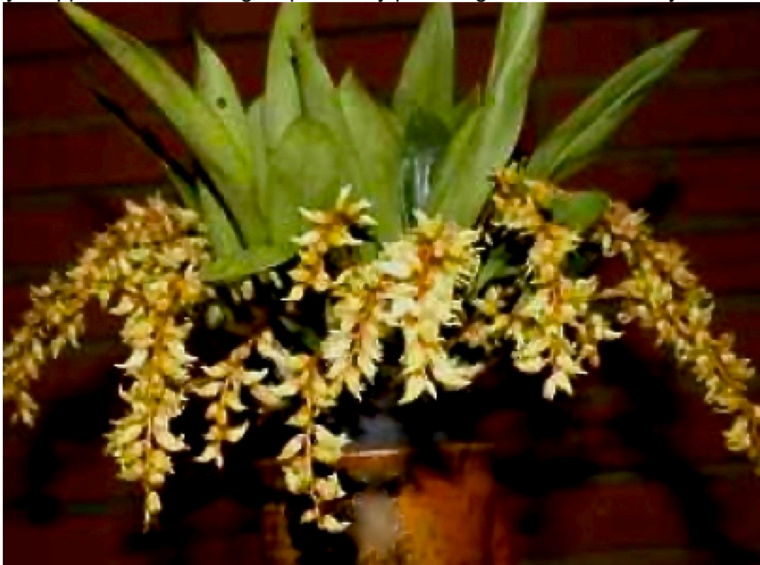
Dendrochilum cutesii (Philippines) In 2" pot...blooms every year about this time...fragrant but not very pleasant. Lynn Wiand