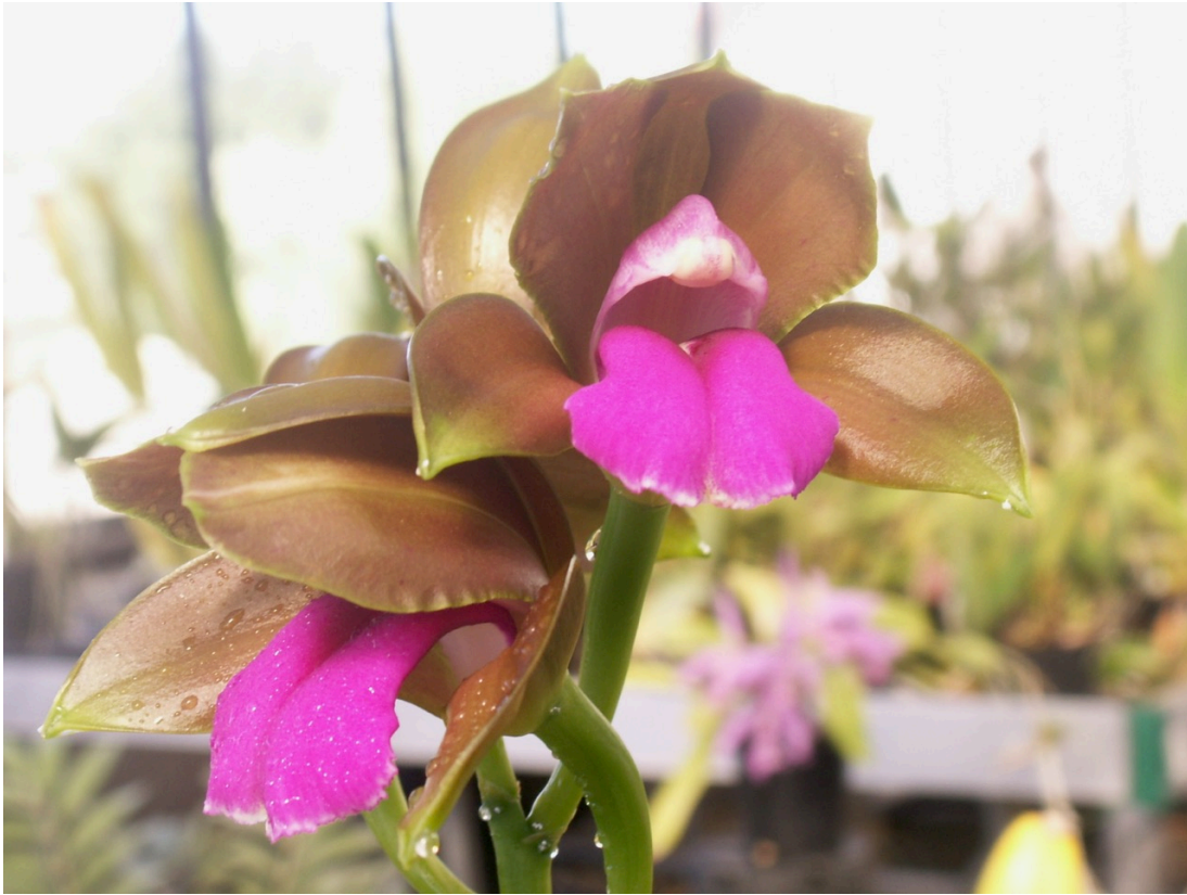
Cattleya bicolor . Russ Nichols