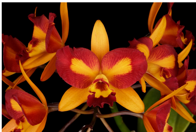
Lc. Fire Gem 'Hot Splash' AM/AOS 1/24