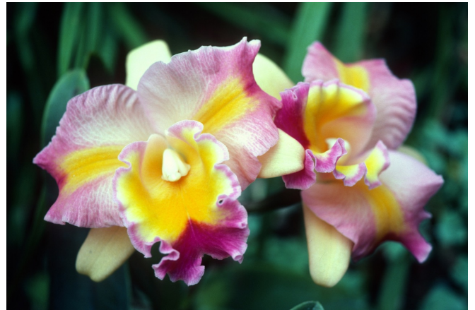
LaelioCattleya Prism Palette 'Kay' 1982