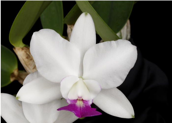
Cattleya walkeriana var. semi-alba 'Ronald Brockers' AM/AOS 1/24