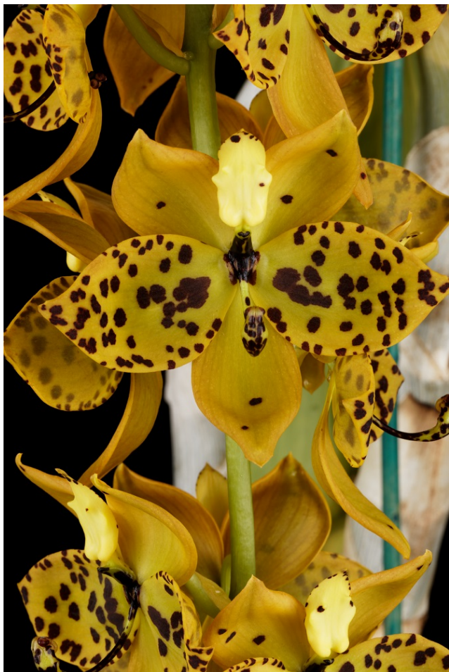
Cyc. Providence 'Sunset Valley Orchids' AM/AOS 1/24