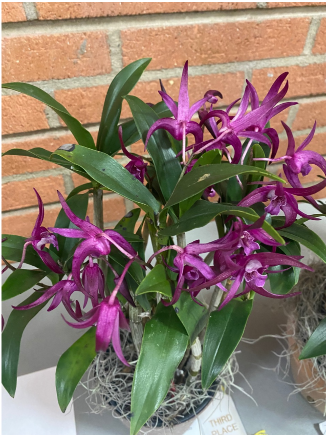
Den (Gilliston Jazz x Tosca Rutherford)