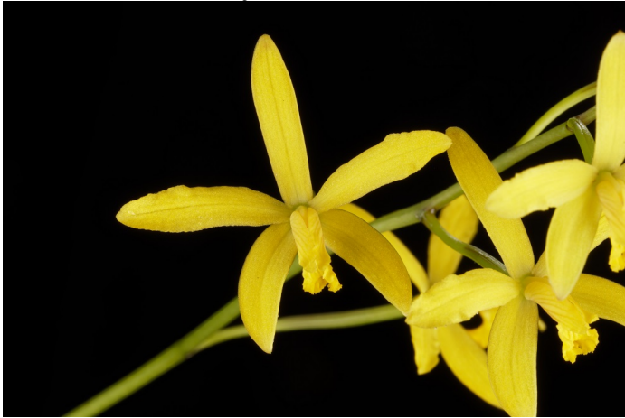
Laelia endsfeldzii 'Susan's Sunshine' AM/AOS 1/24