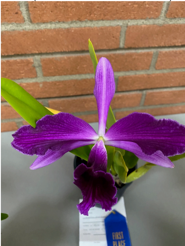
Cattleya (Laelia) purpurata var rubra'