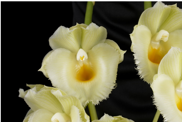
Clowesetum White Magic 'Sunset Valley Orchids' AM/AOS 1/24