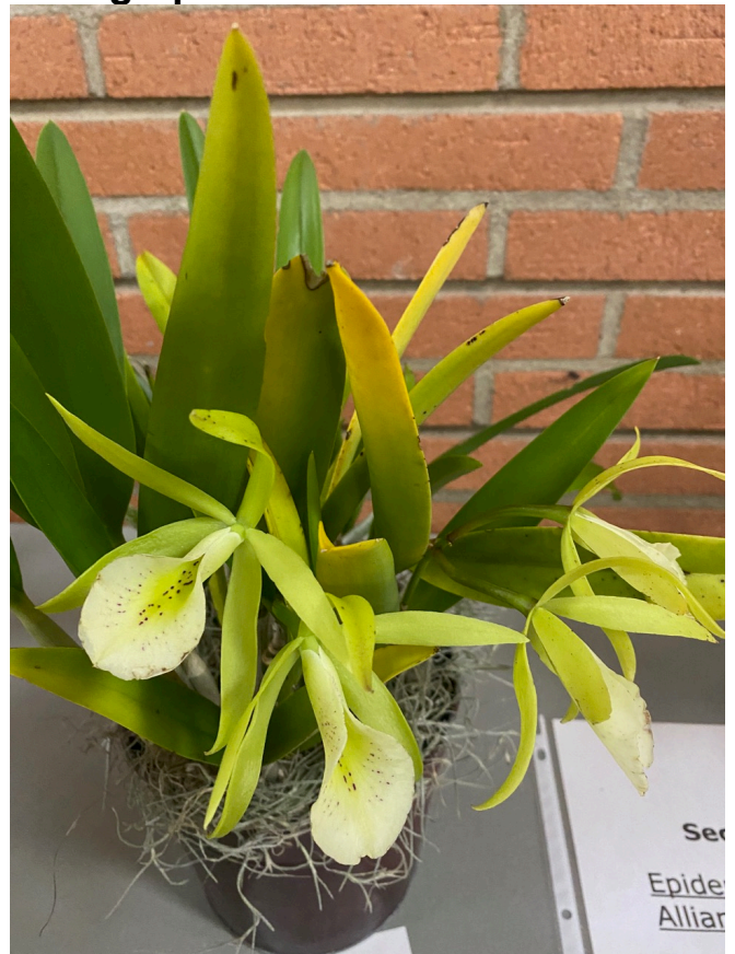
Proc Key Lime Stars