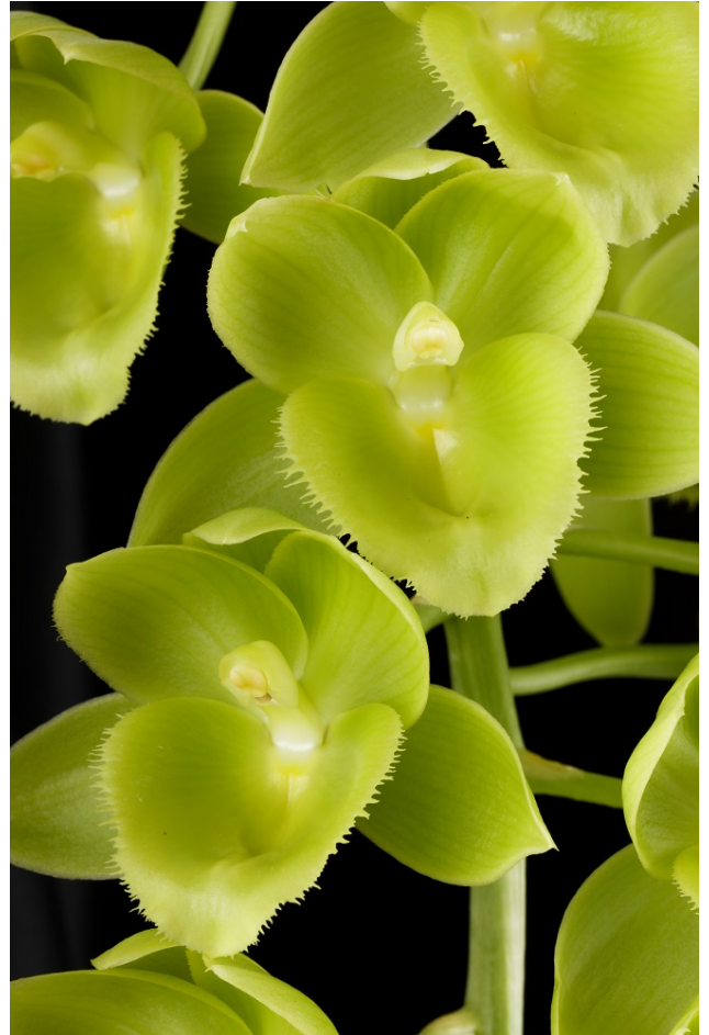
Fredclarkara Emerald Gem 'SVO Green Jeans' FCC/AOS 1/24