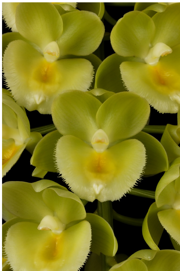
Fdk. Upgrade 'Sunset Valley Orchids' AM/AOS 12/23