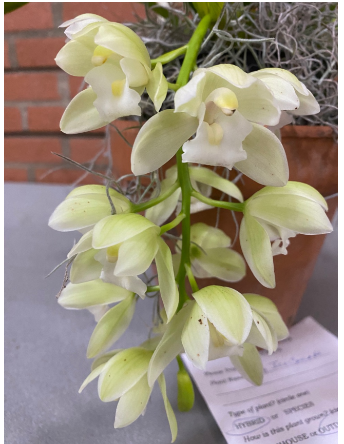
Cymbidium [Sarah Jean] 'Ice Cascade'