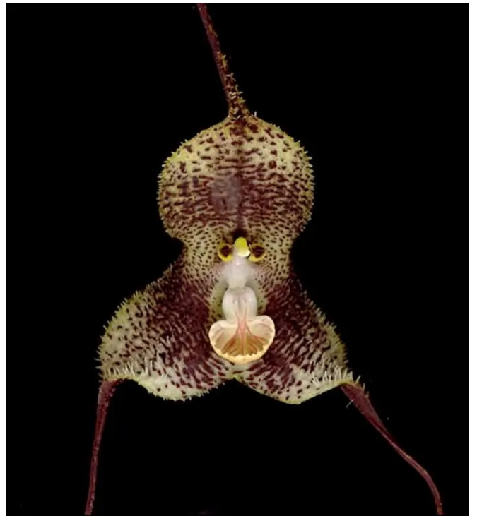
Dracula fuligifera , one of the species in the Orchid Reserve