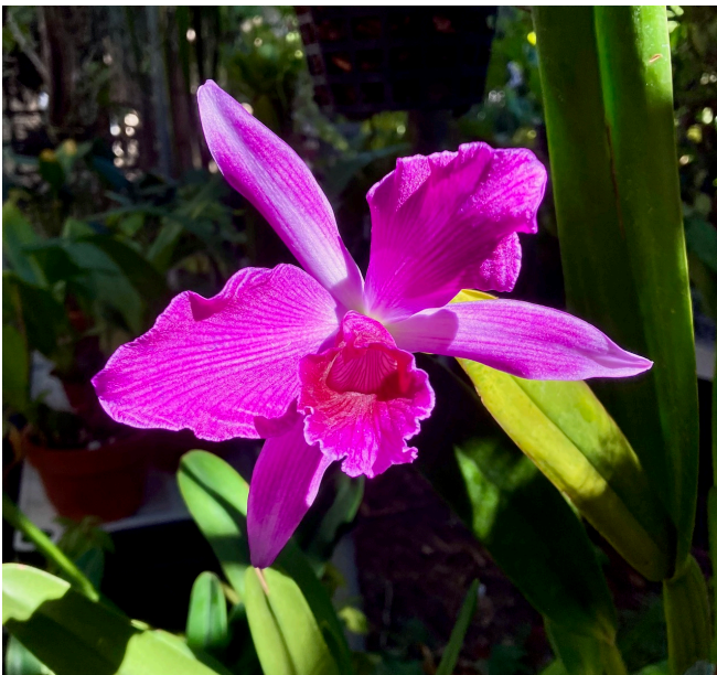
Cattleya purpurata (striata x rubra)