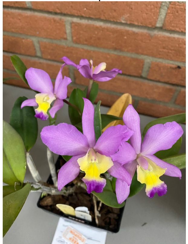
Cattleya Jupiter Drops