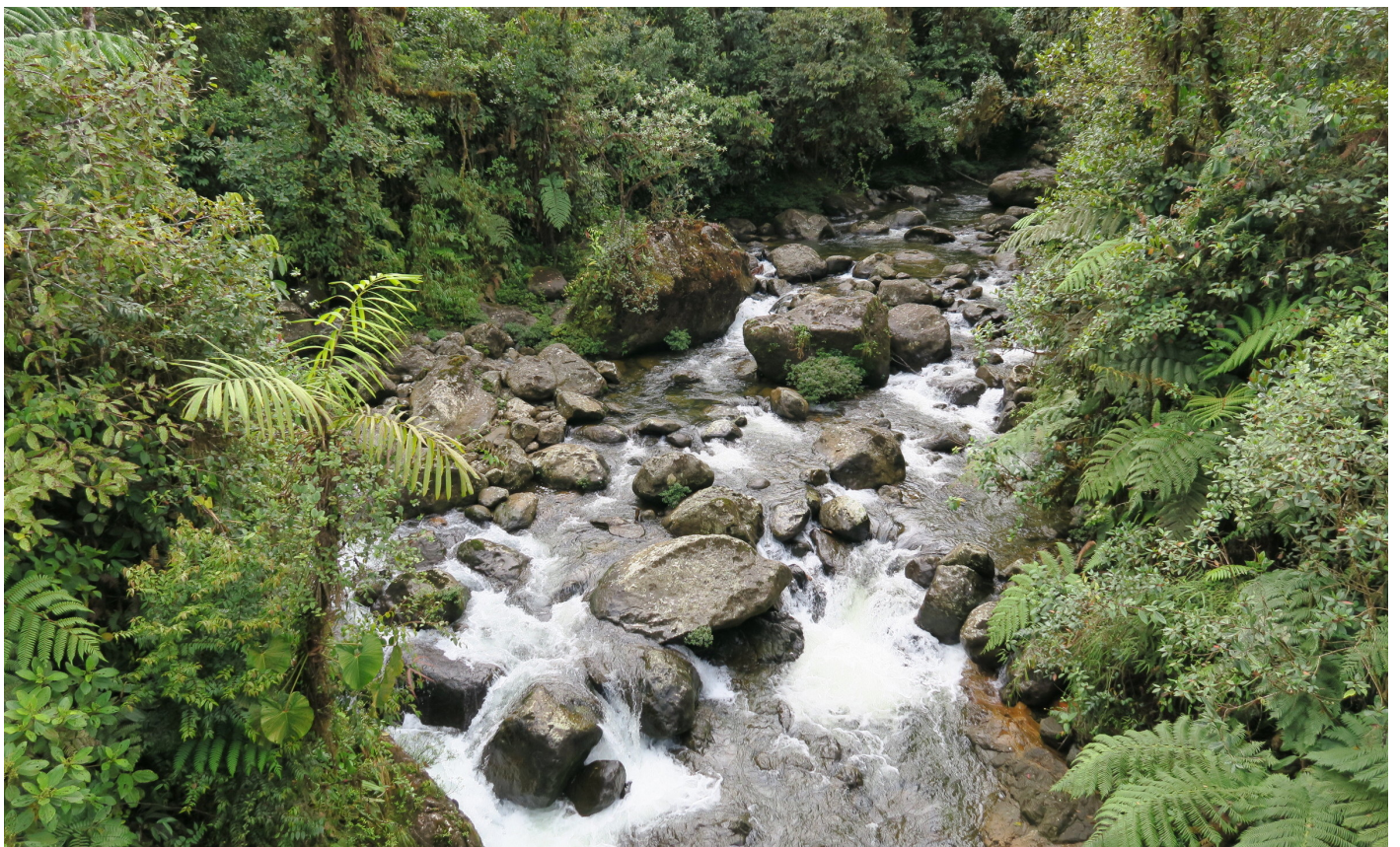
Dracula Reserve, Ecuador