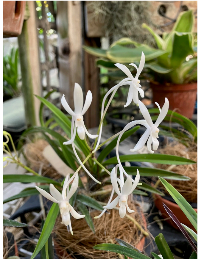
Vanda falcata (Amami Island type)