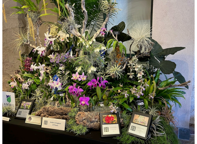
Ambriz Orchids Exhibit