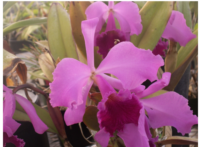
Cattleya labiata rub