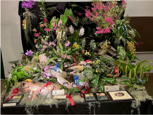
Vietnamese Orchid Society Exhibit