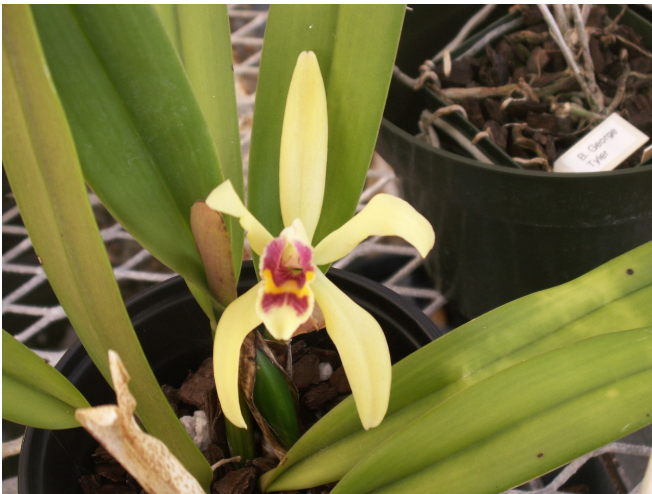
Cattleya My Special Angel