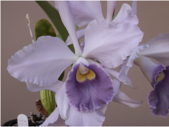
Lc. Eximia coerulea 'Sea God'