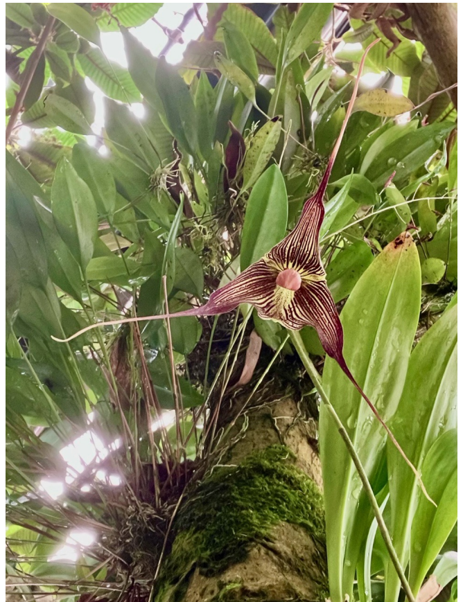
Dracula species in the Huntington's cloud forest