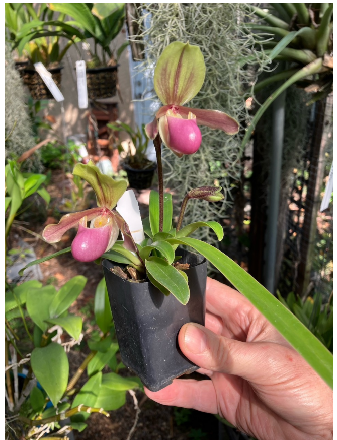
Paph Wössner's Ministar ( henryanum x helenae )