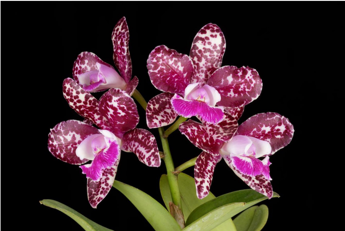
Cattleya Quest Cuba Libre Mentirita 'Fuerte'