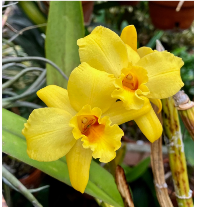
compact cattleya (no ID)