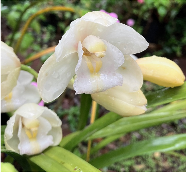
Cymbidium Snow Court 'Altissima'