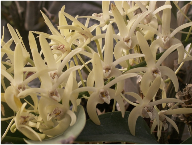
Dendrobium speciosum var. boreale subv. biconvexus