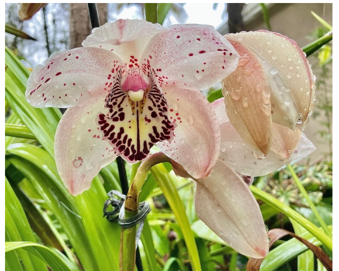
A spotted Cymbidium