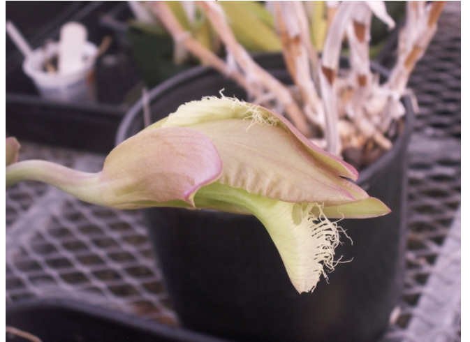
Brassavola ( Rhyncholaelia ) digbyana bud