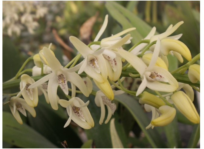
Dendrobium speciosum var. boreale subv. rupicola