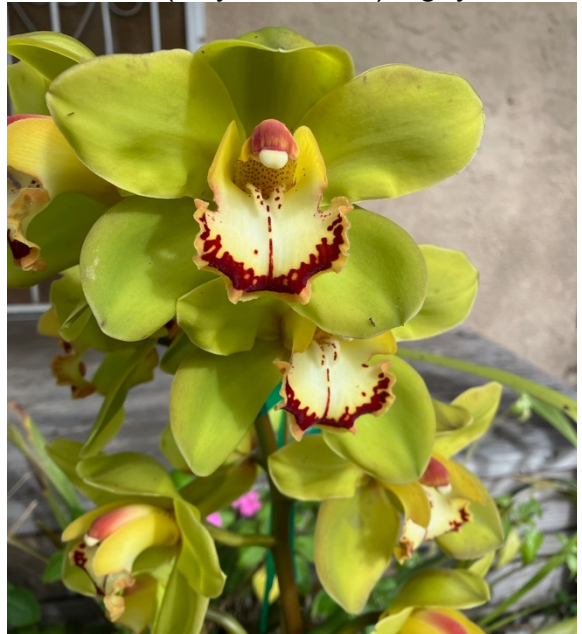
A green Cymbidium