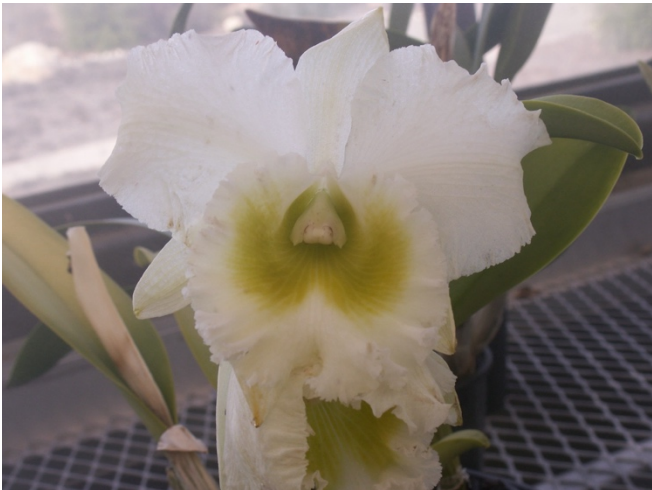
Blc Burdekin Wonder 'Lakeland'