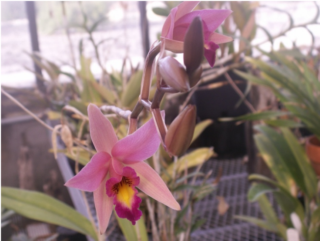
Laelia Santa Barbara Sunset 'Showtime'