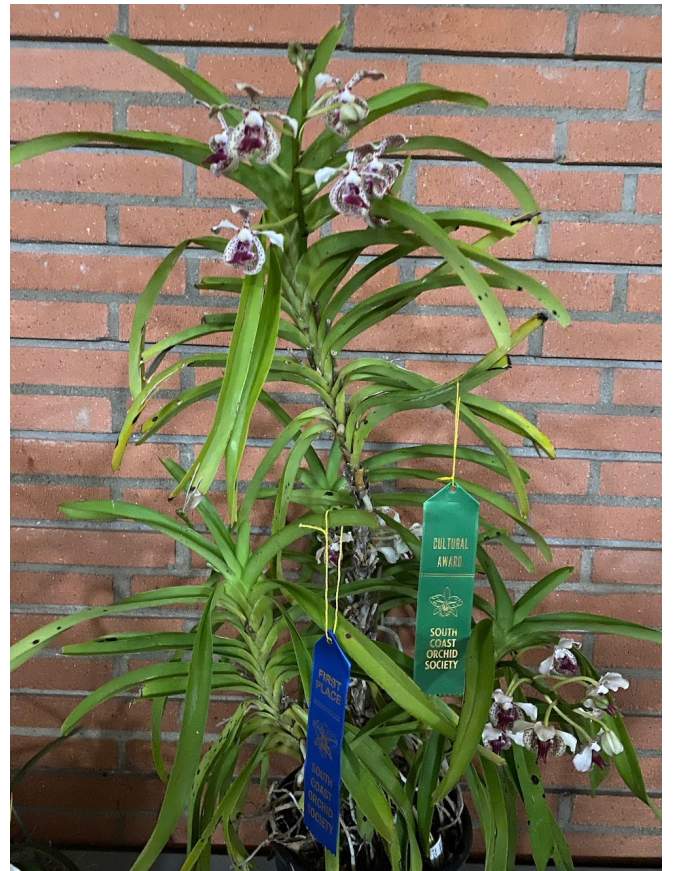
Vanda Kenneth Roberts