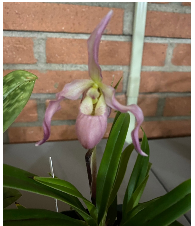
Phragmipedium Paz en Columbia