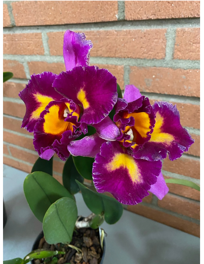
Potinara Dick Smith 'Dark Beauty'