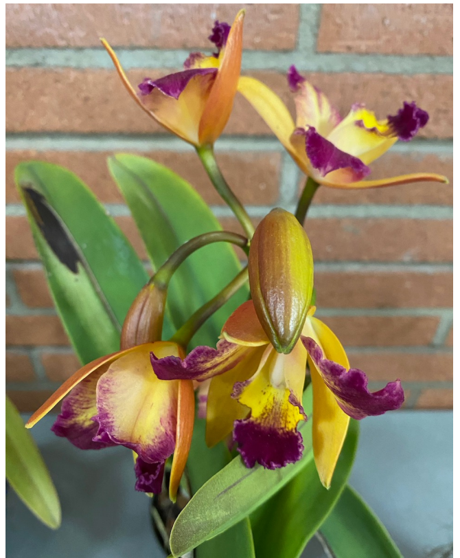
Lc. Straight Answer 'No Question'