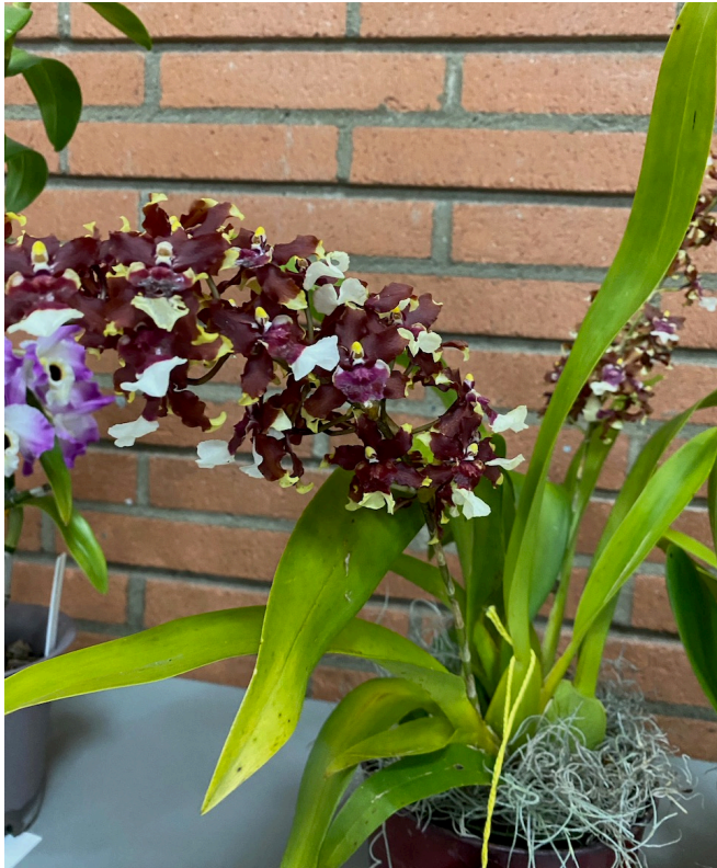
Oncidium Sherry Baby