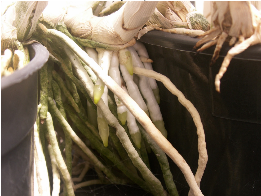
Brassavola (Rhycholaelia) digbyana