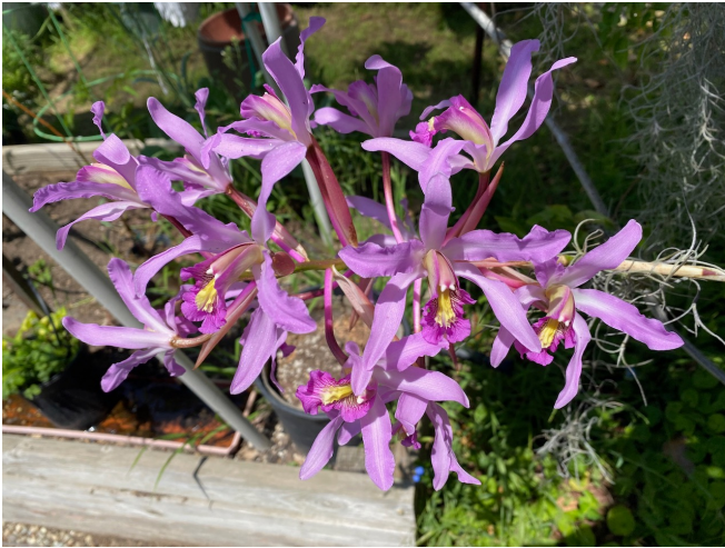
Laelia (Schomburgkia) superbians (?)