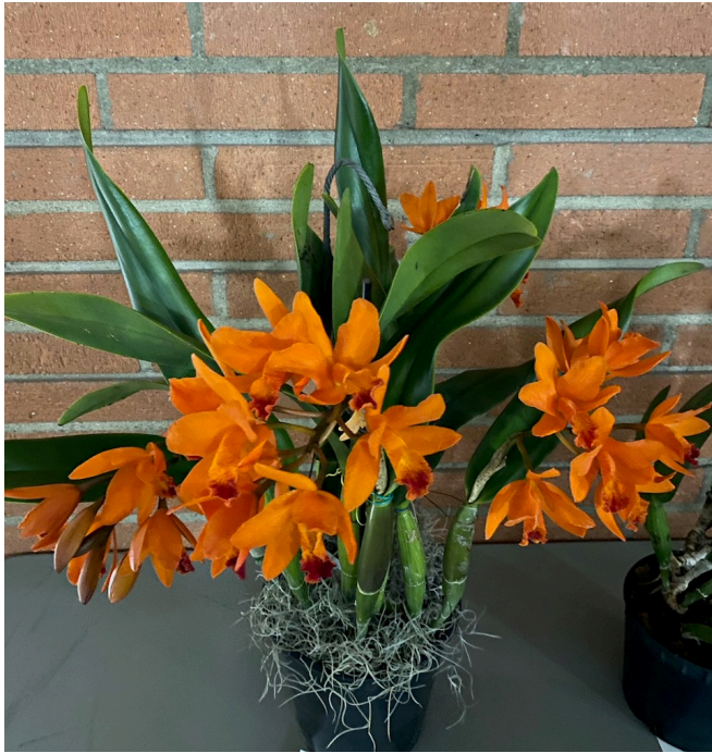
Potinara Linda Vee