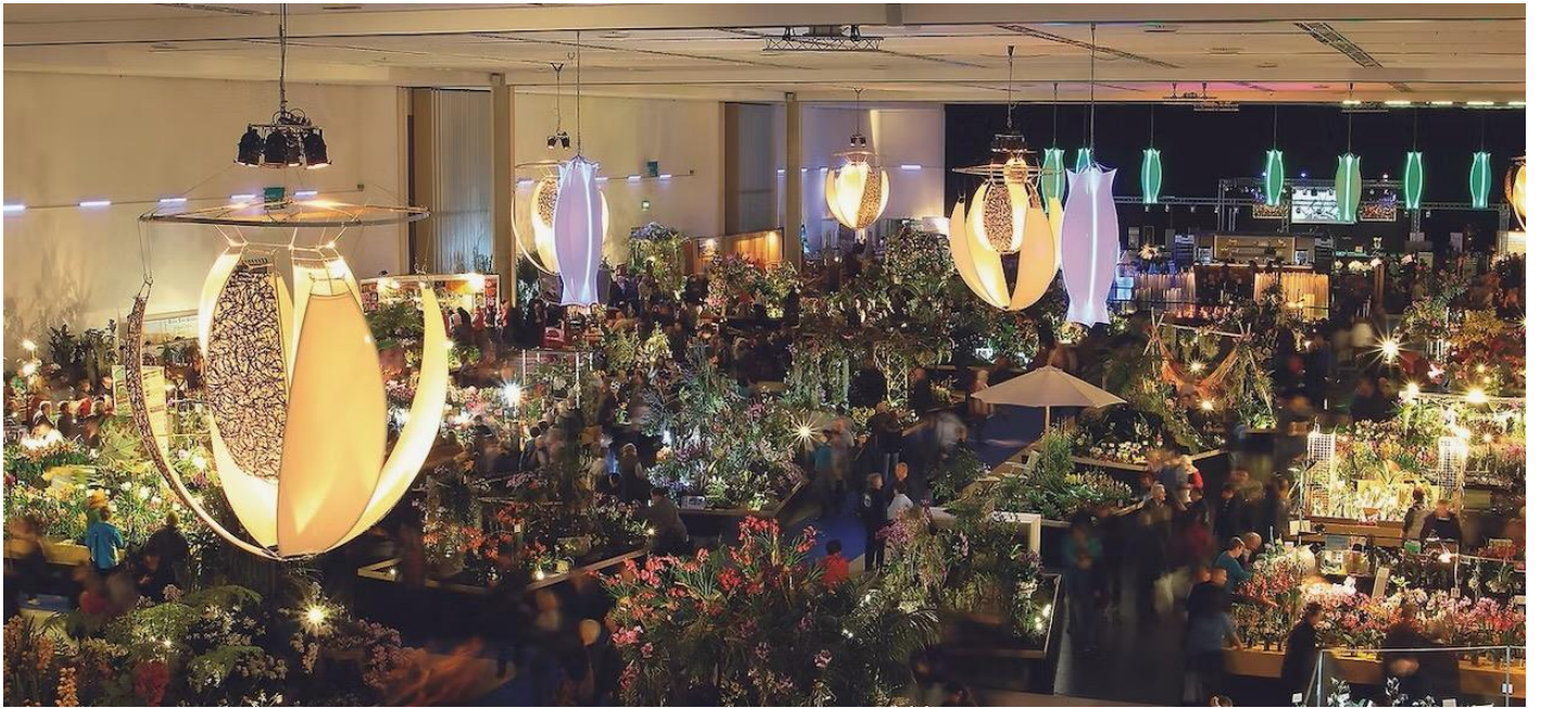
The Exhibitory Area, Dresden, Germany