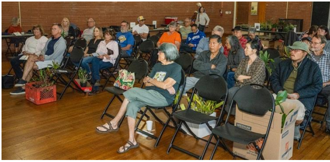
Buyers eagerly await their choice offerings