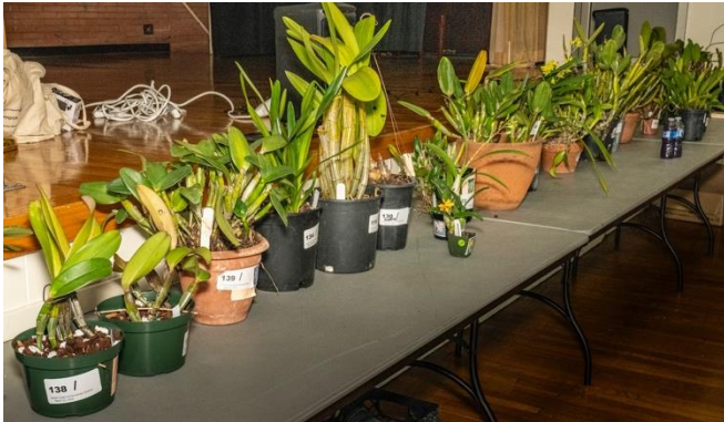
Some of those offerings